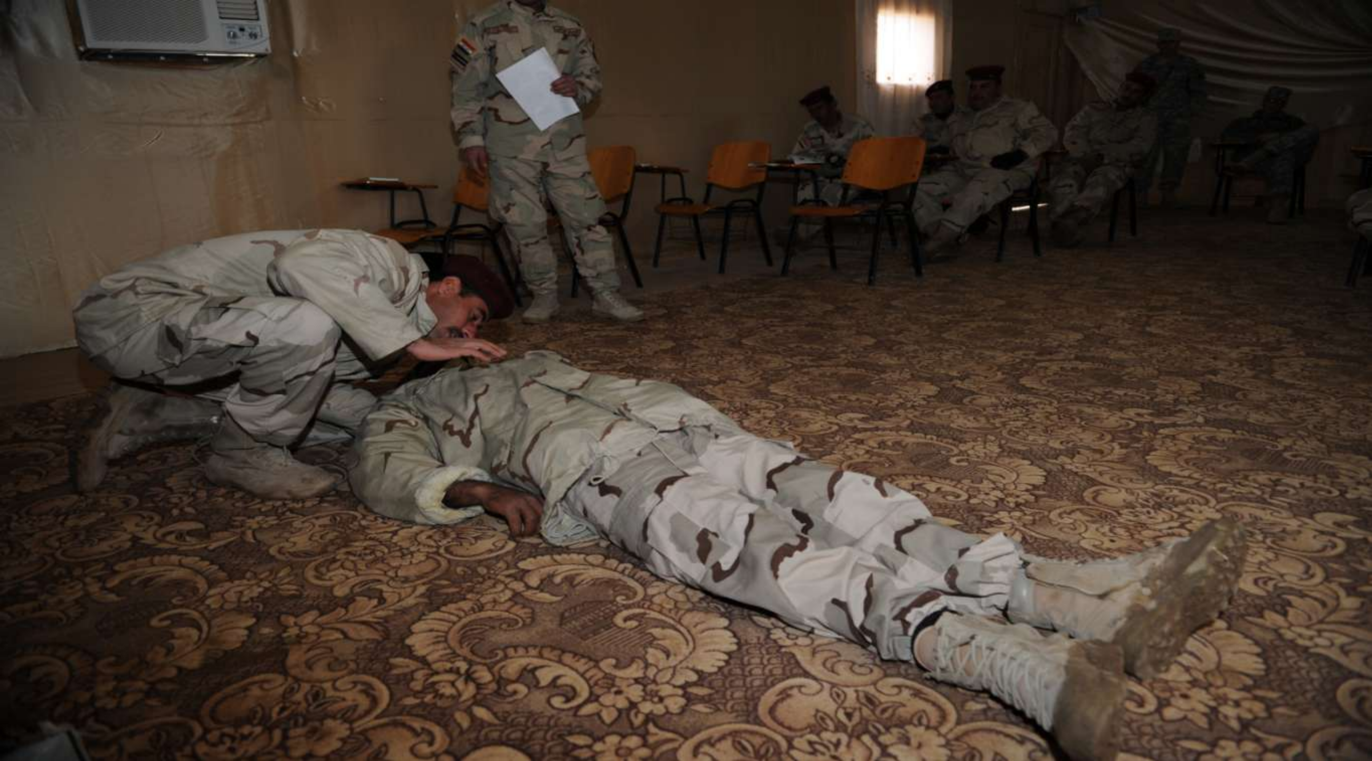
Iraqi Army soldiers at Joint Security Station (JSS) Sparrow Hawk, Iraq train on Combat Lifesaver (CLS) aid January 16, during a "train the trainer" exercise. Soldiers from 3rd Advise and Assist Brigade, 4th Infantry Division, advise and assist the Iraqi Army through training conducted at JSS Sparrow Hawk.