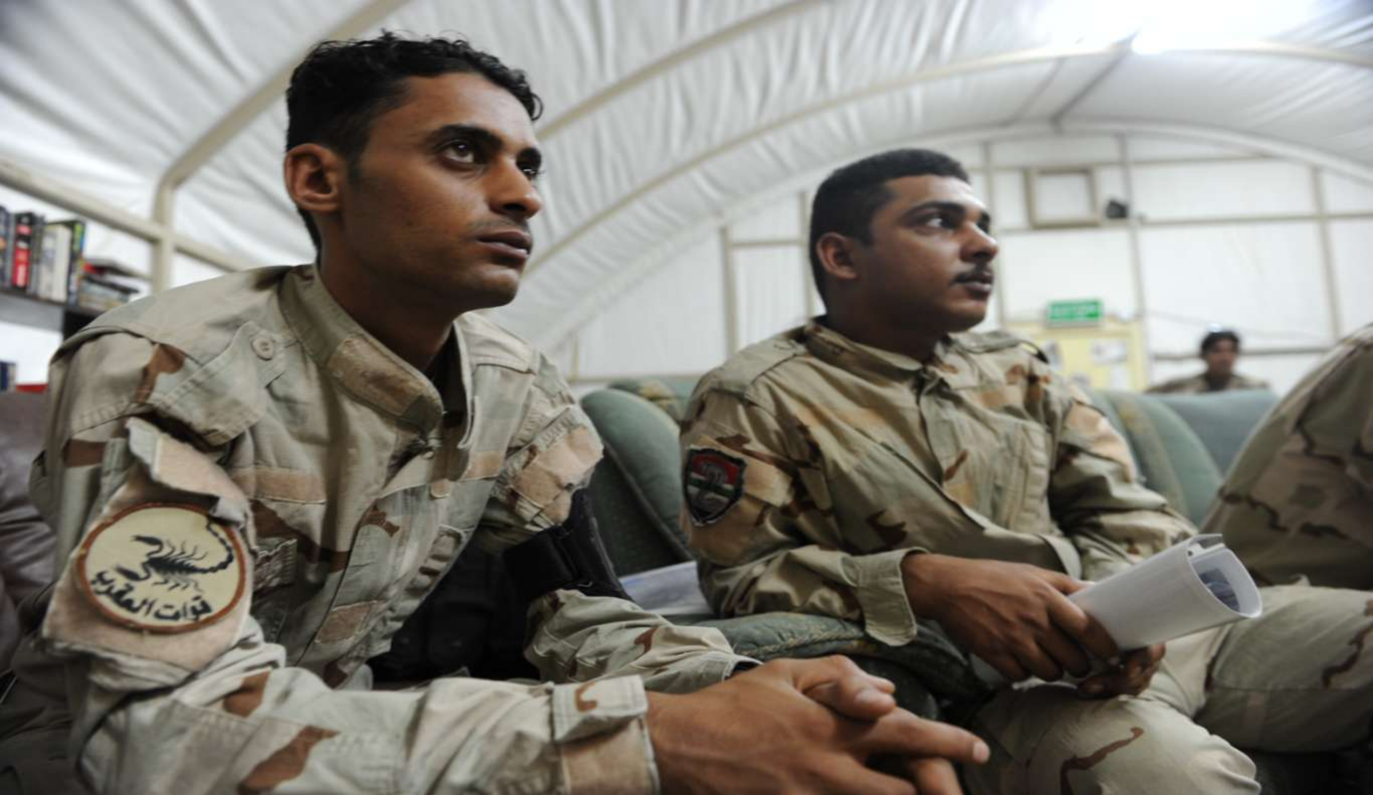
Iraqi Police officers with Basra Special Weapons and Tactics (SWAT) Team learn land navigation from U.S. Soldiers with Bravo Company, 3rd Advise and Assist Brigade, 4th Infantry Division in Basra, Iraq, October 6, 2010. U.S. Soldiers with Bravo Company, 3rd Advise and Assist Brigade conducted classes to assist Basra SWAT Team with professional development in support Operation New Dawn.