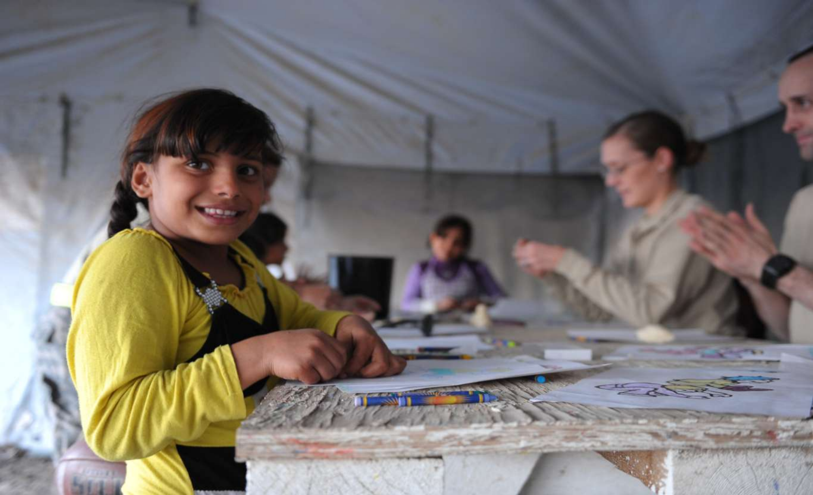
An Iraqi girl with Kashafa, Iraqi Boy and Girl Scouts, plays with clay in Victory Base, Baghdad, Iraq, November 20, 2010.