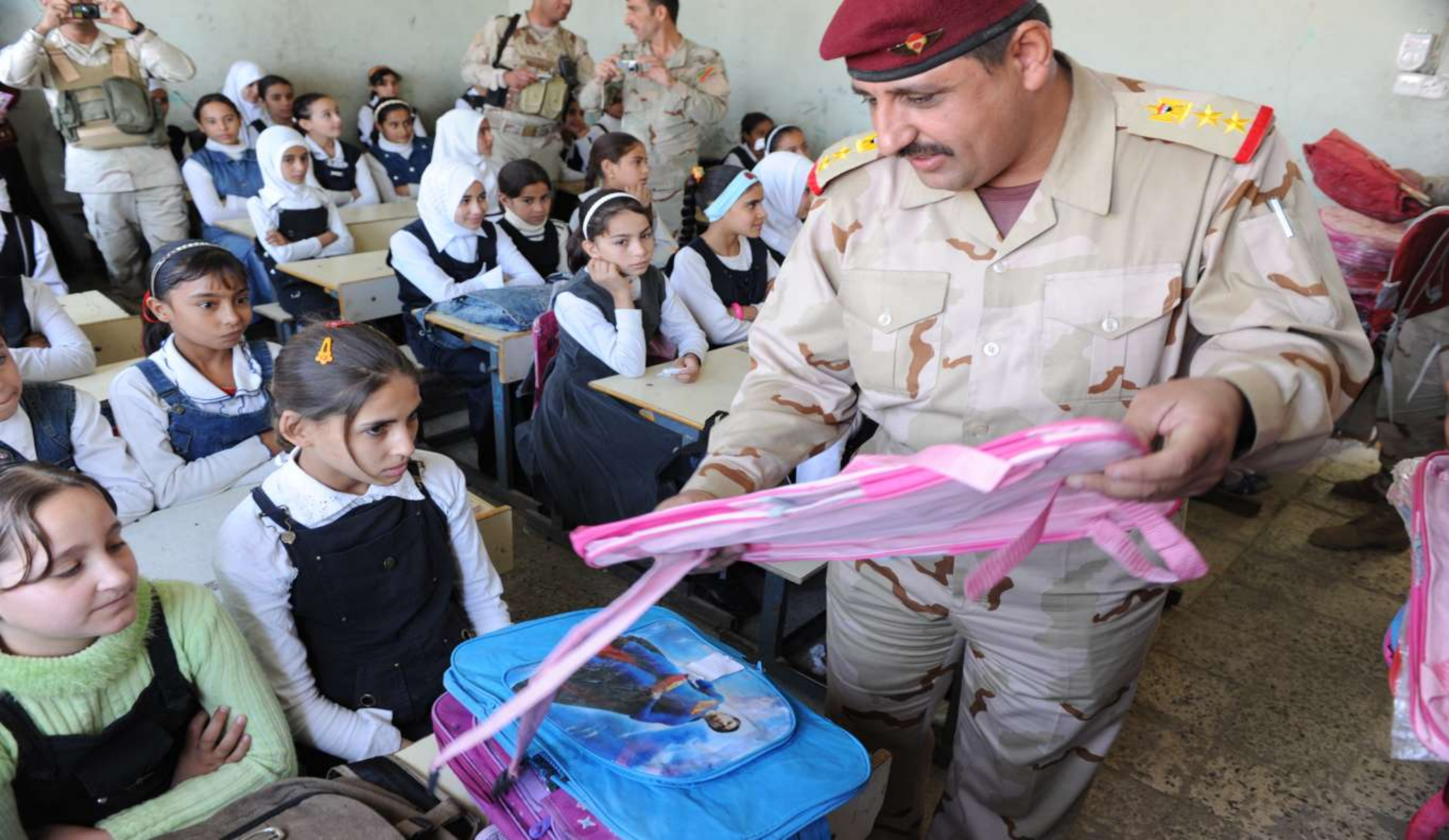
Iraqi Army soldiers with 8th Iraqi Army Brigade distribute backpacks to Iraqi school children in Habbaniyah, Iraq, November 10, 2010. U.S. Soldiers assigned to 3rd Battalion, 7th Infantry Regiment, 4th Brigade, 3rd Infantry Division observed and assisted Iraqi Army soldiers in distributing backpacks filled with school supplies to Iraqi children at three different schools in support of Operation New Dawn.