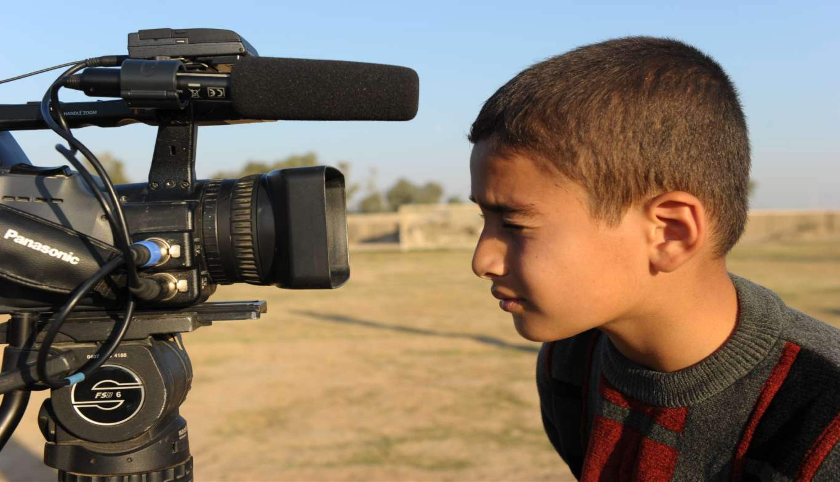
An Iraqi boy with Kashafa, Iraqi Boy and Girl Scouts, looks into a video camera in Victory Base, Baghdad, Iraq, November 20, 2010.