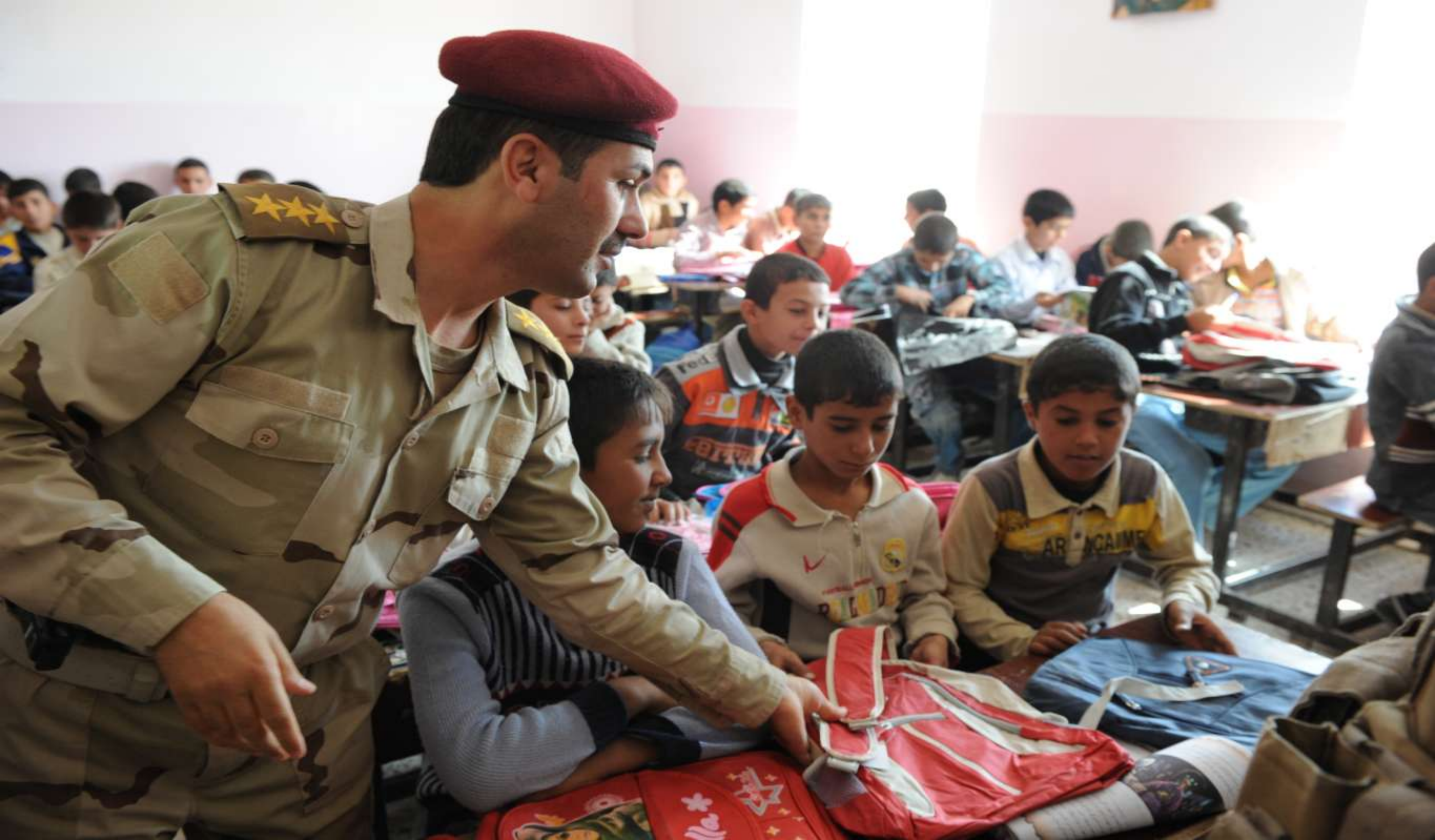
Iraqi Army soldiers with 8th Iraqi Army Brigade distribute backpacks to Iraqi school children in Habbaniyah, Iraq, November 10, 2010. U.S. Soldiers assigned to 3rd Battalion, 7th Infantry Regiment, 4th Brigade, 3rd Infantry Division observed and assisted Iraqi Army soldiers in distributing backpacks filled with school supplies to Iraqi children at three different schools in support of Operation New Dawn.