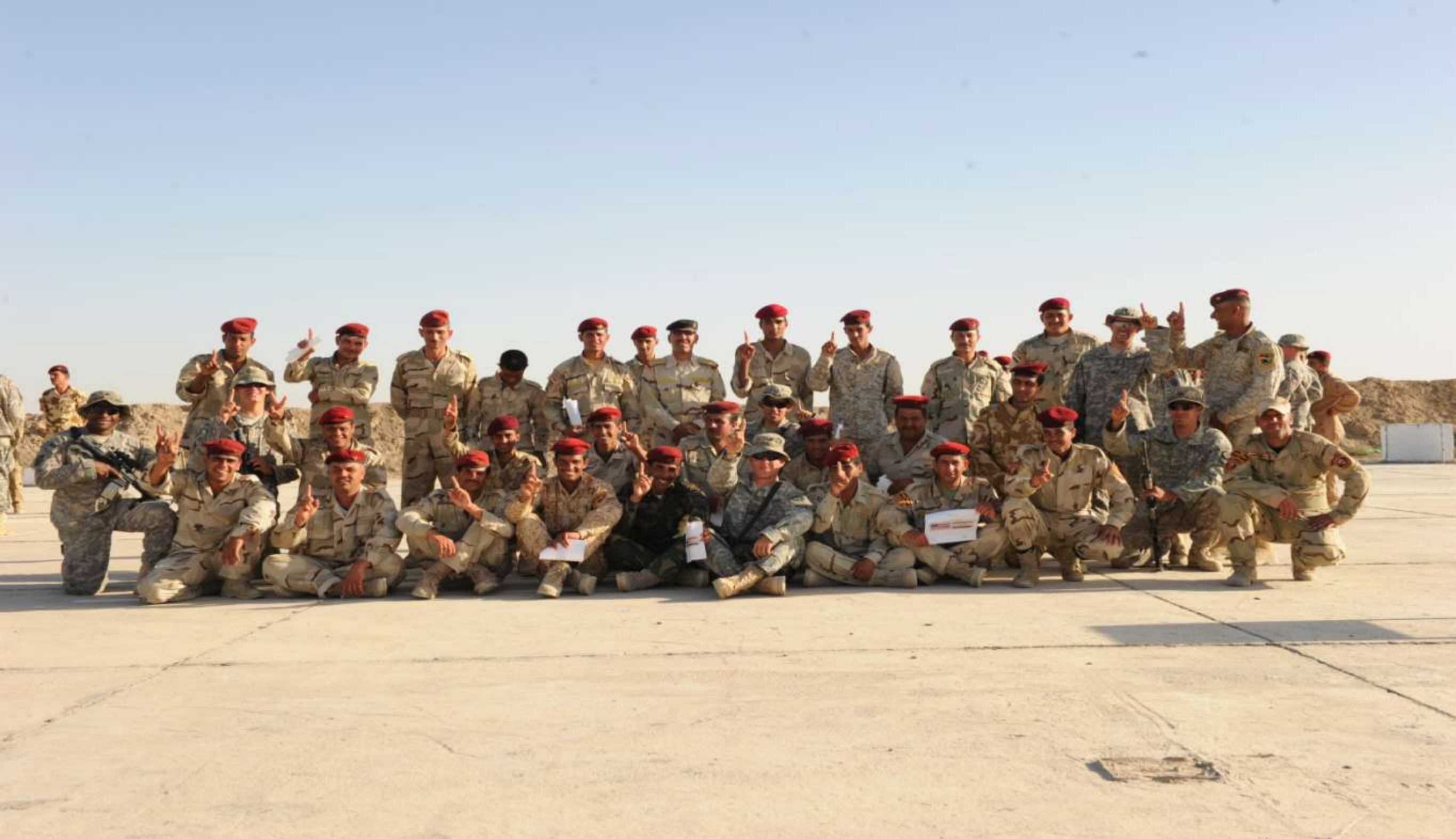
Iraqi Army soldiers and U.S. Army soldiers pose for a photo at their graduation at FOB Cruz-Morris, Diyala Province, Iraq, October 20, 2010. U.S. Army soldiers from Bravo Company, 1-21, 2nd Advise and Assist Brigade 25th Infantry Division trained Iraqi Army soldiers on movement techniques in a densely vegetated area.