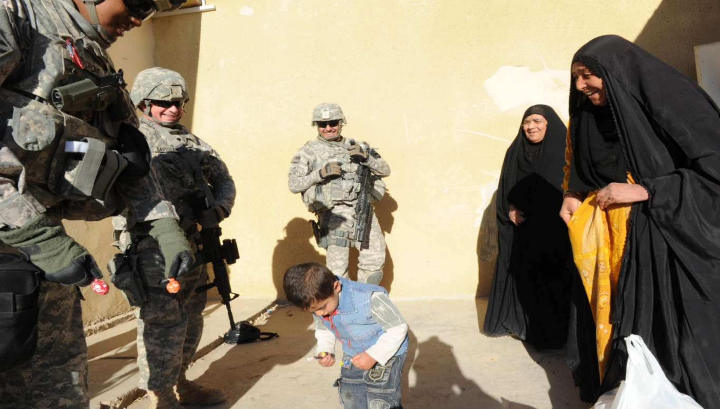
U.S. Soldiers assigned to 442nd Military Police Company, New York National Guard share a laugh with Iraqi women as a child fumbles with candy during a family day visit to an Iraqi detention facility in Ramadi, Iraq, November 5, 2010. U.S. Soldiers assigned to 442nd Military Police Company, New York National Guard along with Iraqi Army soldiers assisted and observed the Iraqi police during a family day visit to the Iraqi detention facility in support of Operation New Dawn.