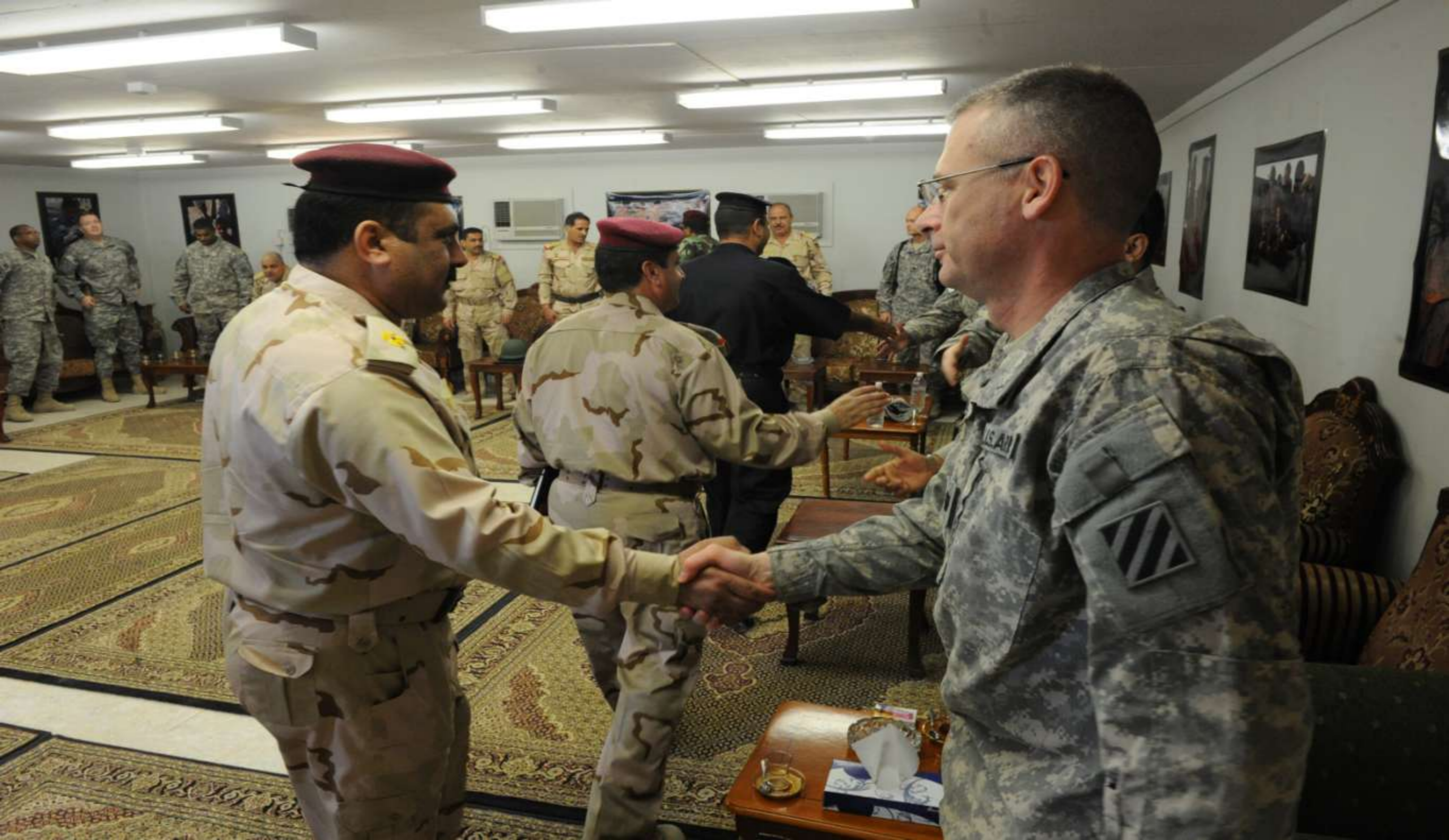
US Soldiers from 4th Advise and Assist Brigade, 3rd Infantry Division (4/3 AAB) greet Iraqi Army at Camp Ramadi, Iraq, October 23, 2010. 4/3 AAB hosted the Iraqi Army for Anbar Province to a joint briefing concerning improvised explosive devices in the area in support of Operation New Dawn.