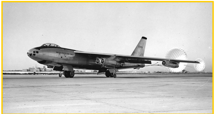
With its small landing chute, and deceleration parachute, streaming in the breeze, B-47E, 51-2359, taxi's by the photographer after landing at McConnell AFB, Kansas.

KC-135A, 55-3134, was the only aerial refueling tanker used for the record-setting flight of the B-47. making ten aerial refuelings over the 80-hour mission. Modified later as part of the early Airborne Laser Experiment program, the designation changed to NKC-135A.