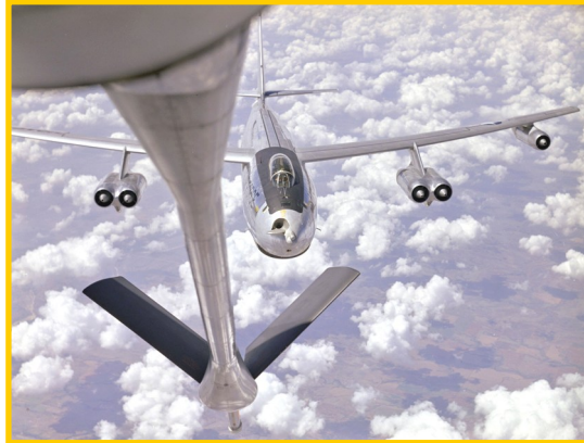
A B-47 Stratojet pulls in behind the KC-135 Stratotanker to take on fuel.