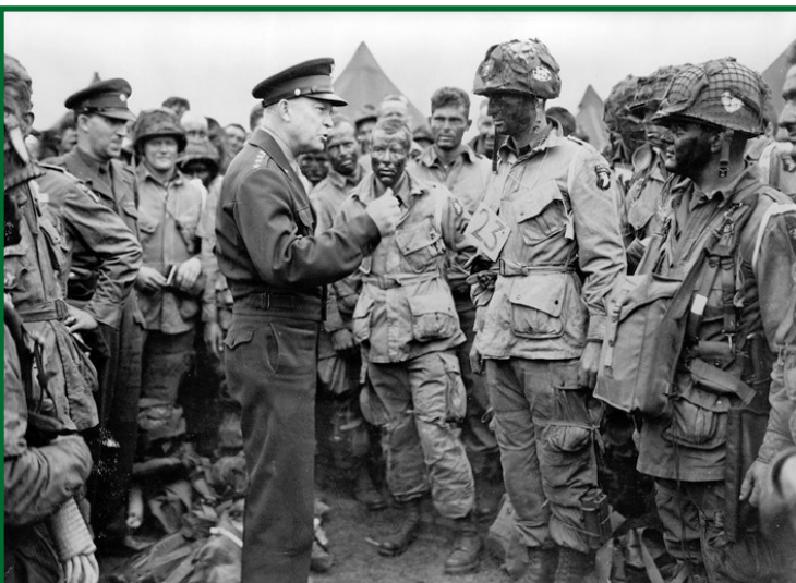
General Eisenhower addressing the US Airborne troops prior to launch of D-Day missions.

Prior to June 1944, glider use by the military had been semi-successful during operations in North Africa and Italy but soon they were thrust center stage on 6 June 1944. Commonly referred to as “D-Day,” the familiar Normandy