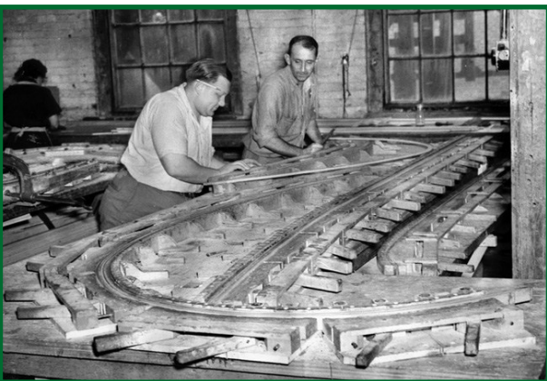
Waco CG-4A wings being constructed.

Another issue arose within the glider program dealing with the tooling for the CG-4A production. During the original procurement of the CG-4As, the Materiel Center began negotiations relating to the establishment of a coordinated tooling program. The Bromley Engineering Company of Detroit received control for the design of tools suitable for the