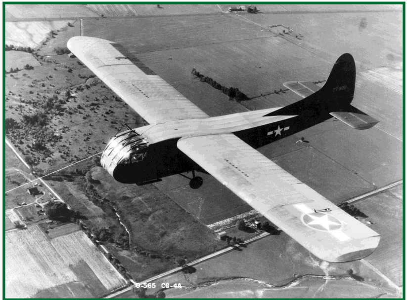
Waco XCG-4 flying over Wilmington County, Ohio.

One of the most significant features of the XCG-4 grew out of a suggestion of General Arnold when he stated he would “like very much to have a small light jeep constructed...to carry two men and have light armor and guns. This jeep should be designed and constructed with a view of fitting wings to it so that we can take it off as a glider and drop it as a glider. Having dropped as a glider, it lands on a field somewhere, sheds its wings, and goes around as a jeep.” In November 1941, Wright Field reported that Waco was, in fact, building both gliders to carry a jeep and a crew of six men. The XCG-4 was constructed to allow the entire nose, including the crew compartment, to swing upward, thereby creating a way for the jeep to unload by simply driving it out of the glider. 13