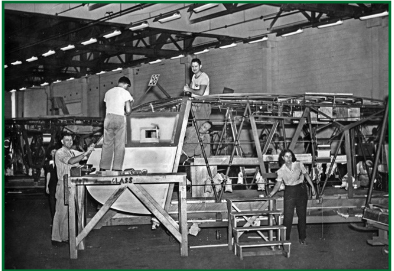
Waco CG-4A under construction.

Dated 4 February 1942, CTI-480 directed the procurement of 200 to 500 eight-place gliders and 500 to 800 fifteen-place gliders, the numbers would be constantly revised through the years, and at times stopped for weeks. The urgent needs for gliders at a time when the demand for powered aircraft was already taxing American demands put the Materiel Center up against a staggering task. Officials at Wright