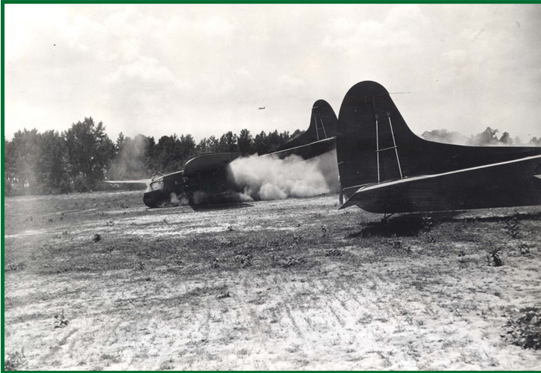
CG-4A landing during Operation MARKET GARDEN.

bridgehead across the Meuse-Escaut Canal northward towards the Rhine and the Zuider Zee, thus flanking the Siegfried Line, and secondly, taking possession of the area between Arnhem and the Zuider Zee to advance across the IJssel River into the Northern German Plain. 31