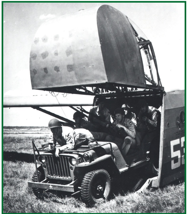
Demonstration of a fully manned Jeep exiting a Waco glider.

On 28 April 1942, Waco delivered the fifteen place XCG-4 static test article and the flight test article on 14 May to Wright Field, earning the company an official commendation from the Materiel Center which acknowledged the work of the Waco employees devotion to the project, stating that the XCG-4s had been "delivered several months prior to dates that would have been possible under normal operating conditions of this Company." 11 The first XCG-4 flight article flew on 20 June and, despite having a new rudder and fin combination installed, it received satisfactory remarks. In another significant test, the XCG-4 was successfully towed from