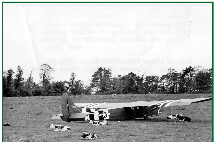
CG-4A in field.

At around noon, 1,546 aircraft and 478 gliders carrying roughly half the British 1 st and U.S. 82 nd and 101 st Airborne Divisions converged on their designated drop and landing zones with 1,481 aircraft and 425 gliders successfully reaching their target areas; losses were far less than had been projected. Paratroopers from the 101 st , having landed between Veghel and Eindhoven, moved quickly to establish their position at Zon, roughly between St. Oedenrode and Eindhoven. After slight opposition from enemy tanks but overcome with assistance by the RAF Second Tactical Air Force (TAF), the paratroopers quickly seized the bridge at Veghel; however, the Germans destroyed the bridge at Zon over the Wilhelmina Canal as the paratroopers approached. To the north, the 82 nd landed southeast and southwest of Nijmegen and captured the bridge over the Maas River at Grave and the two smaller bridges over the Maas-Waal Canal but could not secure the Nijmegen bridge. The British 1 st Airborne Division succeeded in capturing the northern end of the Neder Rijn bridge north of Nijmegen but failed to capture the entire bridge due to the presence of the 9 th SS and 10 th SS Panzer Divisions; Allied intelligence had not foretold of their presence in the area and they presented an unexpected and exceedingly strong opposition to the British 1 st Airborne Division. 34