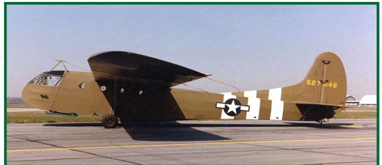
Waco glider on display at the National Museum of the USAF.

Like most of the procurement programs of the time, there were pressures of wartime and immediate pre-war needs that caused the Air Corps to sometimes cut corners within the development and production of material and to not always follow the prescribed regulations. The glider program was no different. At the beginning of the program, the Air Corps quickly realized the need for gliders to deliver a number of troops, equipment, and/or supplies to one spot, which led to the decision to procure experimental gliders before the completion of design studies. However, prior to the completion of the design studies, preliminary engineering requirements for the fifteen-place gliders were sent out on 8 March 1941 to eleven companies with only four submitting a favorable response back to Wright Field, Ohio – Frankfort Sailplane