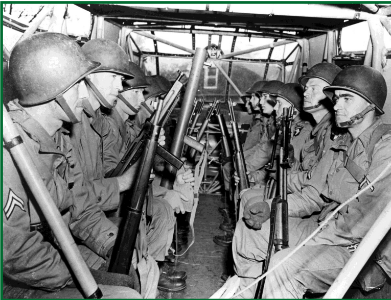
Infantrymen loaded in glider preparing for launch towards Europe.

Divisions boarded C-47s or Waco CG-4As for drops behind Utah beach. Plans called for a total airlift for over 17,000 men together with support equipment – jeeps, 57-mm antitank guns, and small tanks – that would be carried by over 900 C-47s and 500 gliders of IX Troop Carrier Command heading west for peninsula behind Utah beach. To persuade the participants to the success of the operation, Eisenhower and Breton visited units of the 101 st during the evening and observed their departures. By the end of D plus 1, losses amounted to 41 aircraft and 9 gliders. With losses far below those feared, Leigh-Mallory quickly admitted his error and congratulated Eisenhower on the wisdom of his difficult discussion of 30 May. However, not all was congratulatory. Prior to the invasion, aerial reconnaissance had failed to show that the Germans had flooded fields on both sides of the two rivers, the Douve and Merderet. It was within these marshes that many of the heavily laden paratroopers had tumbled and drowned. 27