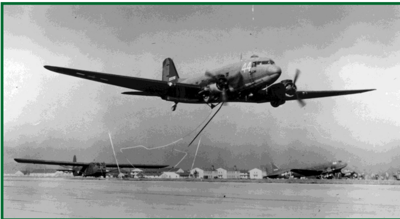
Waco XCG-4 being “snagged” by tow aircraft.

Interestingly, before Waco had even delivered a static test glider on the XCG-4 contract, the Glider Branch of the Aircraft Laboratory discovered that the other experimental contracts for tactical gliders show little promise to deliver an acceptable fifteen-place glider. Due to this, the urgent need for gliders and Waco's progress, production contracts were let before the completion of the experimental articles. Before the first flight of the article, XCG-4 was delivered, eleven companies had been awarded contracts for a total of 649 CG-4As. 15