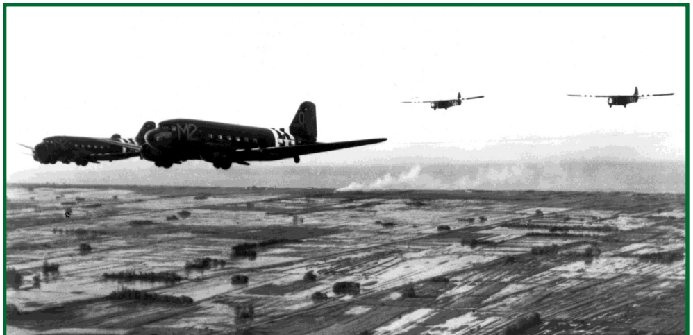
C-47's with CG-4A gliders in tow prior to release during Normandy operations over flooded hedgerows/fields.

Airfields ranging from Devon to Lincolnshire saw action during the night of 5 June as paratroopers from the 82 nd and 101 st Airborne