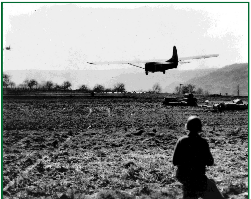
CG-4A landing during Operation MARKET GARDEN.

The ground phase of the campaign – coded GARDEN – was given two major objectives: first, a rapid advance of the British Second Army's