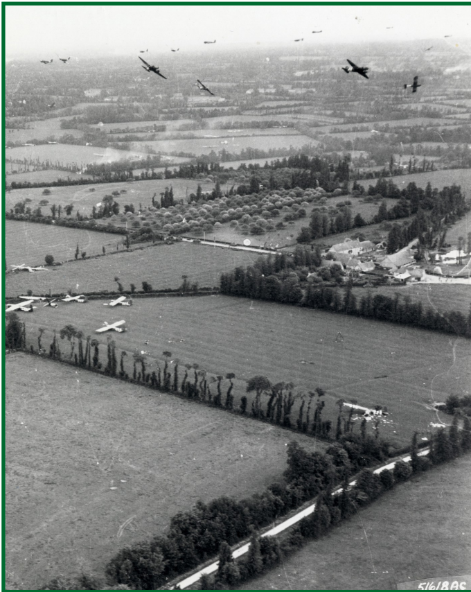
Gliders landing during Normandy operations.

At roughly 0100 on 6 June, D-Day, those on the topsides of Allied ships heading toward Normandy could hear the hundreds of C-47's overhead in route to their drop zones behind the beaches. Approximately an hour later, six C-47 aircraft flew over the village of St. Moxel near the headquarters of the German 709 th Infantry Division. Moments later, German sentries engaged the paratroopers from the 101 st Airborne Division. After two years of planning and a 24-hour postponement due to weather, the liberation of Europe had commenced. 23