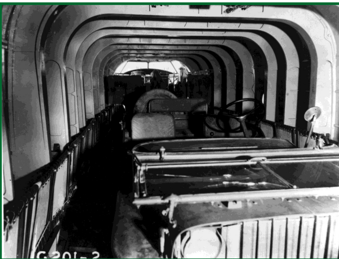
Jeep inside a Waco glider.

In March 1941, officials at Wright Field began negotiations with Waco Aircraft Company of Troy, Ohio for the construction of experimental gliders. A contract approved in June provided that Waco would build one static test and one flight test model of an eight place (XCG-3) glider and one static test and two flight test models of a fifteen place (XCG-4) glider. Although Waco was not a large company, it had experience in manufacturing commercial aircraft and was better equipped to handle a development contract than most of the corporations the Materiel Division had turned to in the early days of the glider program. 10