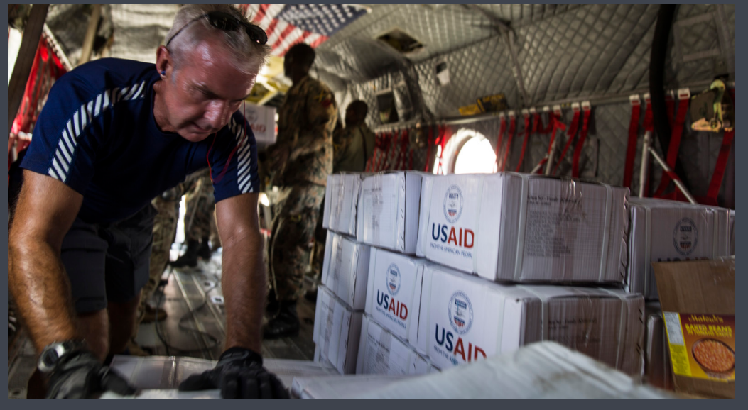
A volunteer loads relief supplies on a U.S. Army CH-47 Chinook helicopter at the port of Roseau, Dominica, Oct. 3, 2017. The aircraft delivered rice and kitchen sets from the U.S. Agency for International Development to the community of Wotten Waven, Dominica. At the request of USAID, JTF-LI has deployed aircraft and service members to assist in delivering relief supplies to Dominica in the aftermath of Hurricane Maria. The task force is a U.S. military unit composed of Marines, Soldiers, Sailors and Airmen, and represents U.S. Southern Command's primary response to the hurricanes that have affected the eastern Caribbean.