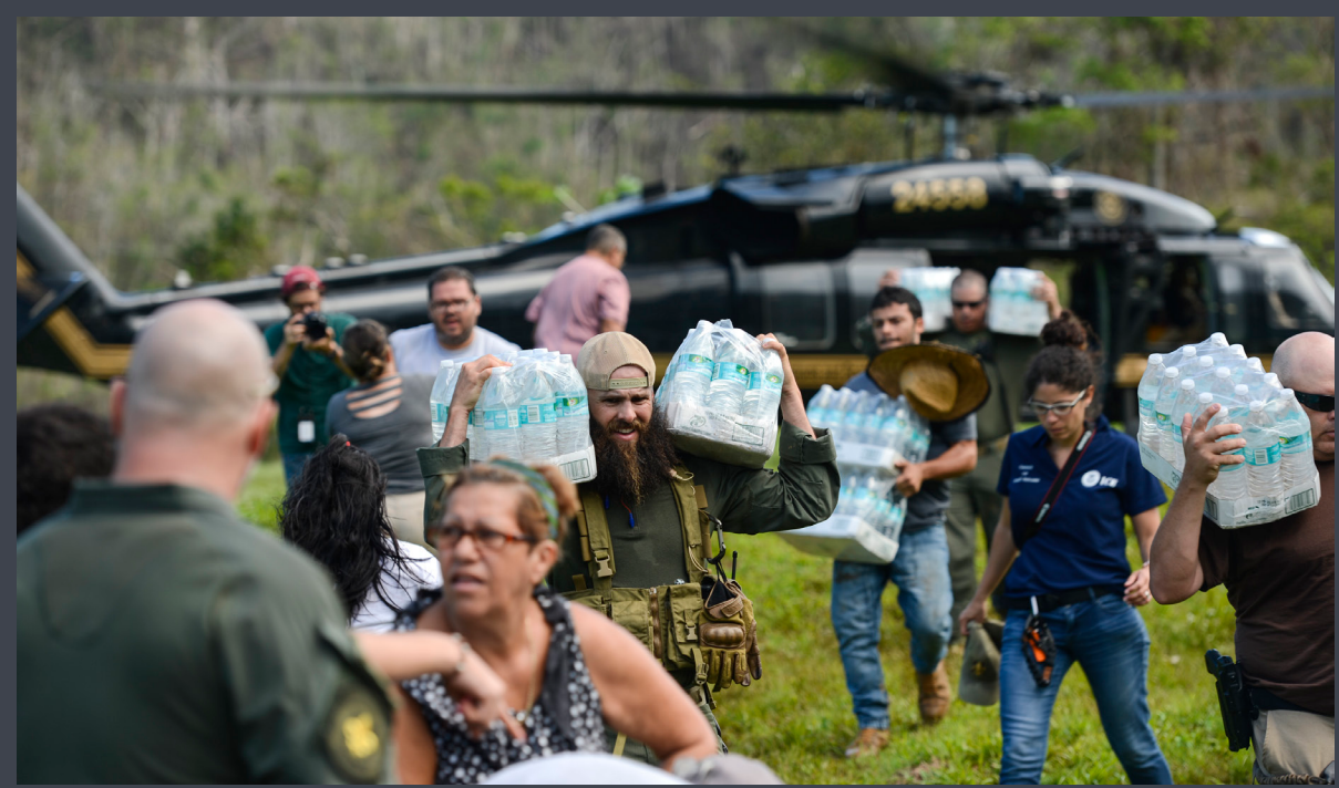
Employees if the U.S. Department of Homeland Security deliver food and water to isolated Puerto Rico residents after their bridge was destroyed by Hurricane Maria in the mountains around Utuado, Puerto Rico, Oct. 12, 2017. The Federal Emergency Management Agency and its federal partners continue 24-hour operations to conduct missions in support of those affected by Hurricane Maria.