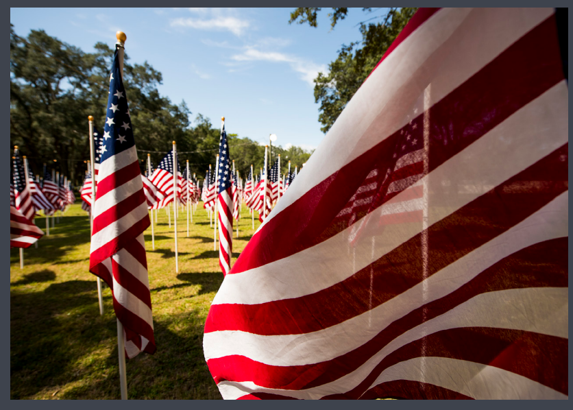
American flags flap in the light breeze on the Field of Valor display in Niceville, Fla. Sept. 14, 2017. The display features 13 rows of 27 flags and one extra to create the field. Names of recently fallen military members, including 10 Airmen, adorn each of the approximately 352 American flags.