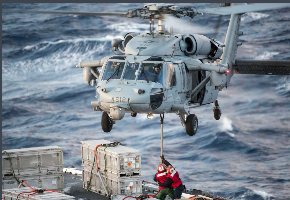
A U.S. Navy MH-60S Sea Hawk helicopter, attached to Helicopter Sea Combat Squadron (HSC) 9, prepares to offload ammunition from the aircraft carrier USS George H.W. Bush (CVN 77) in the Atlantic Ocean March 26, 2018. The ship was underway conducting sustainment exercises to maintain carrier readiness.