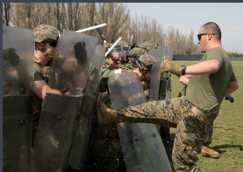
U.S. Marines with Black Sea Rotational Force 18.1 deflect attacking simulated enemy role-players during the riot control portion of non-lethal weapons training at Mihail Kogalniceanu Air Base, Romania, April 5, 2018. The training taught Marines how to properly handle large crowds in hostile and non-hostile situations.