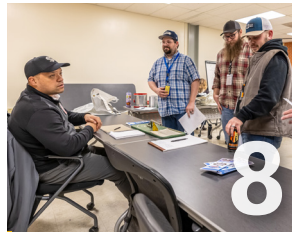
8 Apprenticeship program looking for new applicants