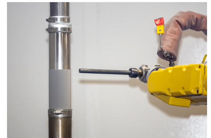
ABOVE: Cold spray, also known as supersonic particle deposition, is a cutting-edge repair process that uses a high-speed gas jet to spray metal powders onto a surface.