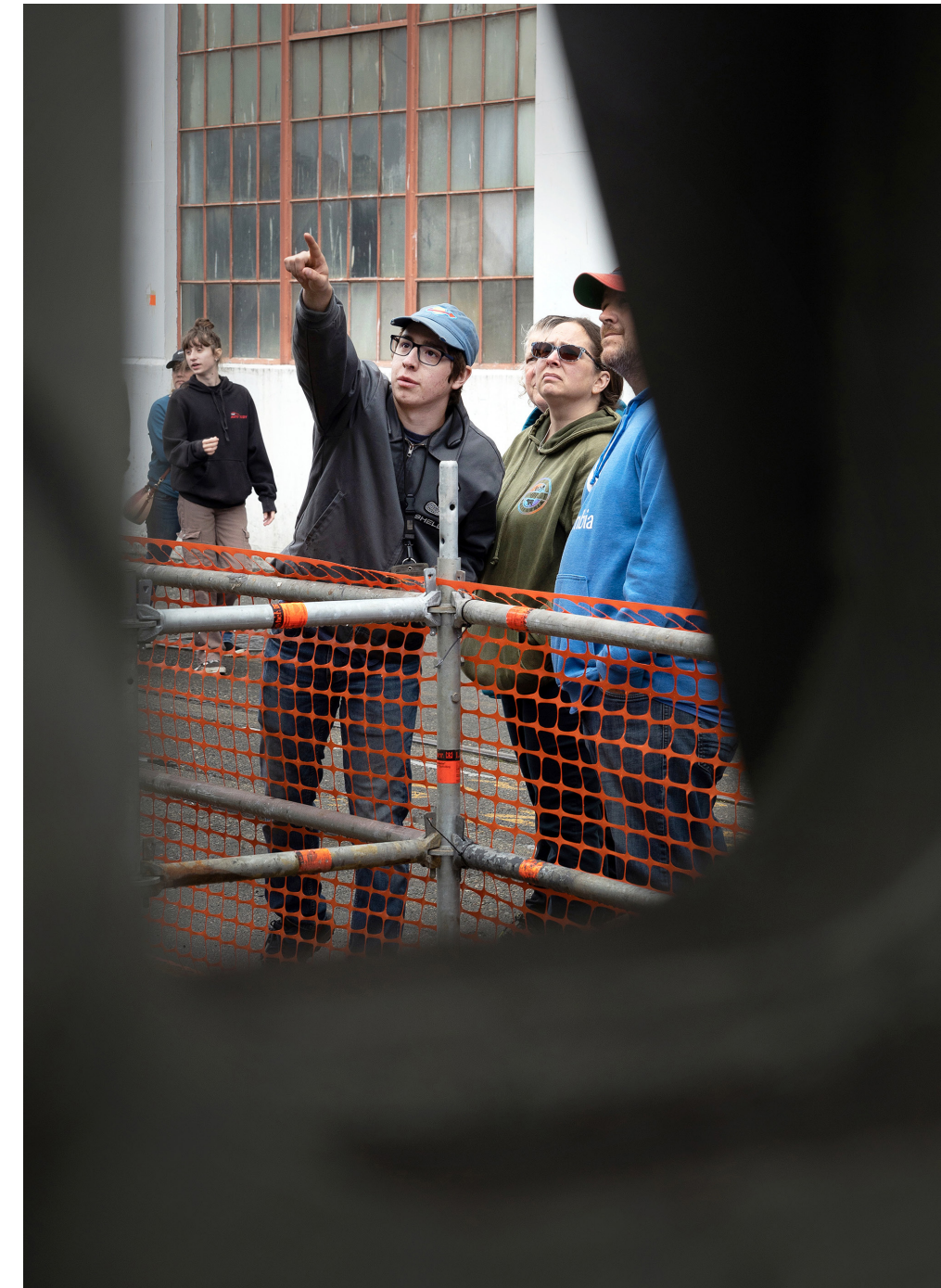
ABOVE: An employee shows family members a cut-up section of a decommissioned submarine near Dry Dock 3 during Family Day 2023 at PSNS & IMF.