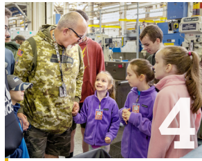
4 Mark your calendars for Friends & Family Day