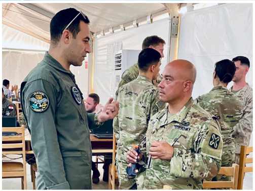
Soldiers from Charlie Company, 341st Military Intelligence Battalion, Illinois Army National Guard took part in Bright Star 25's Command Post Exercise at Mohamed Naguib Military Base, Egypt, Aug. 31 to Sept. 19, 2025

KINGDOM OF THAILAND MALAYSIA SOUTH KOREA HAWAII SINGAPORE AUSTRALIA INDIA