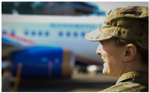
Soldiers from the 122nd Theater Public Affairs Support Element participate in a Puget Sound Honor Flight event at Seattle-Tacoma International Airport, April 12, 2025.

WASHINGTON UTAH MARYLAND PENNSYLVANIA RHODE ISLAND WASHINGTON D.C.