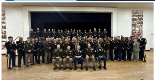
110th Information Operations Battalion soldiers held a dining-in following its 3rd Annual Information Operations Symposium at Fort Meade, Maryland.