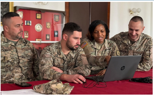
Five soldiers from 110th Information Operations Battalion teamed up with the Armed Forces of Bosnia and Herzegovina in Sarajevo for a military-to-military engagement, enhancing cyber cooperation and boosting our partners' cyber security capabilities.

BOSNIA AND HERZEGOVINA ESTONIA GERMANY POLAND