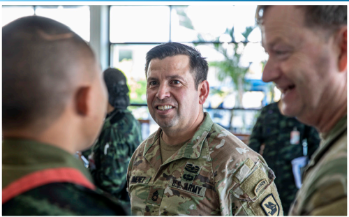
Soldiers from the 56th TIOG were chosen to join the State Senior Enlisted Leaders during multiple exchanges with State Partners, Thailand and Malaysia at the beginning of Fiscal Year 2025.