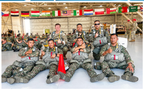
A soldier from Alpha Company, 1st Battalion, 29th Special Forces Group joined a group from the Malaysian Armed Forces at the 2025 LEAPFest in North Kingstown, Rhode Island.