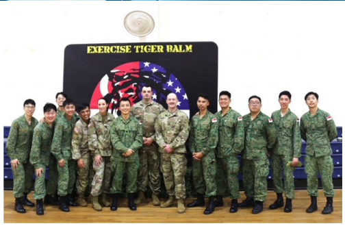
Soldiers from the 156th Information Operations Battalion take part in a staff exercise as part of Tiger Balm 2025 in Singapore. The next two years, the 56th TIOG will support with public affairs.