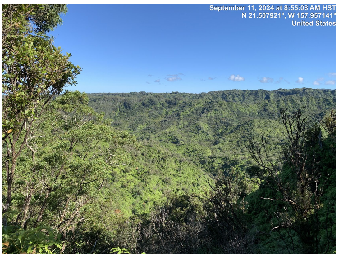
Figure 2: Facing northerly direction