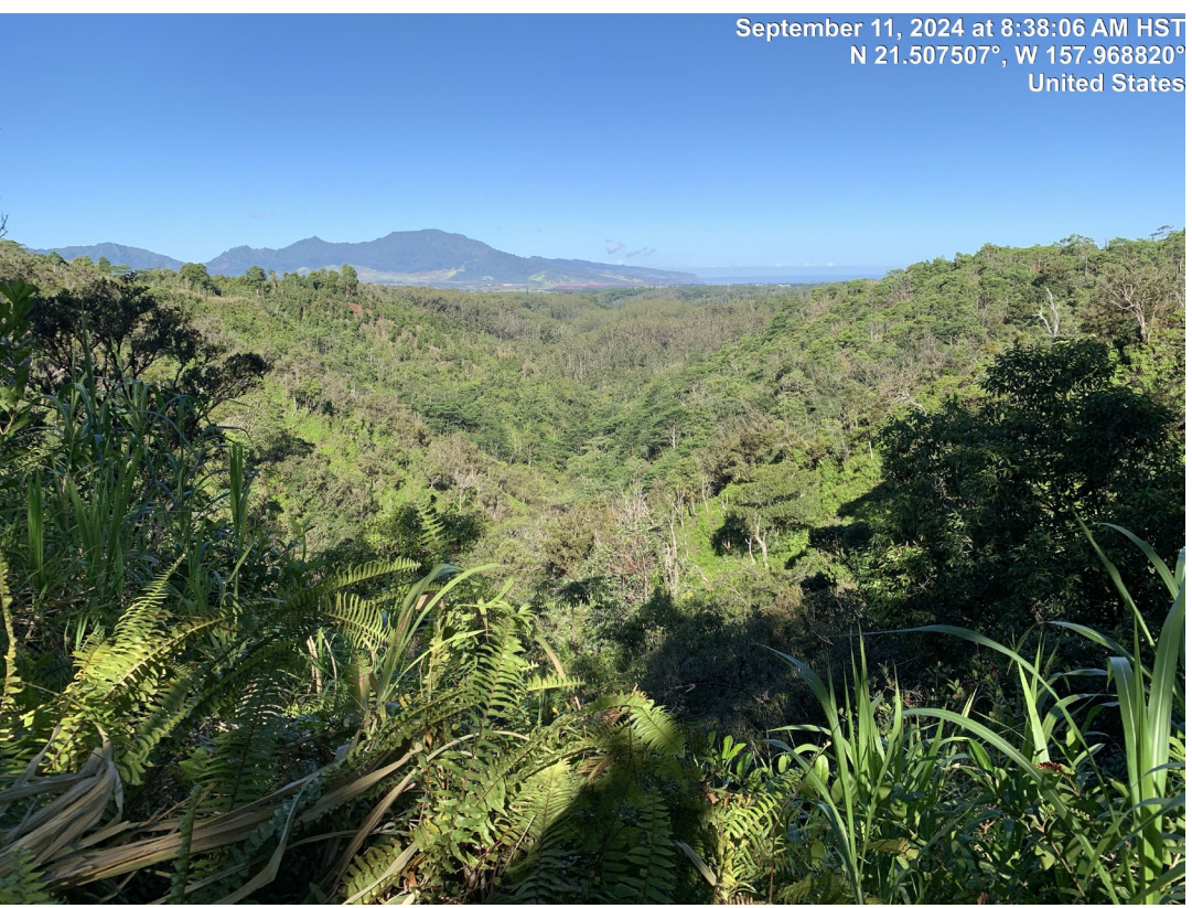
Figure 1: Facing westerly direction - Helemano/Whitmore Village