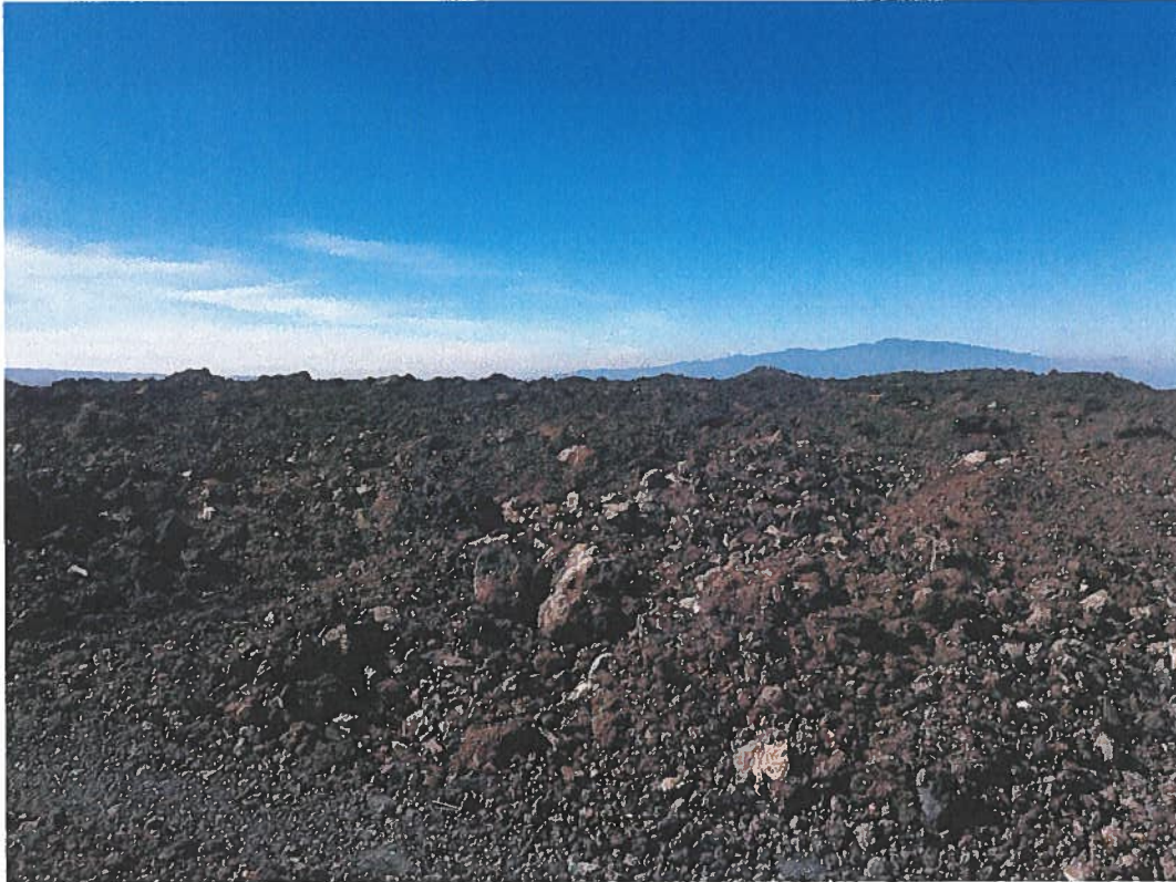
CLEARED BAZOOKA SHELL AREA