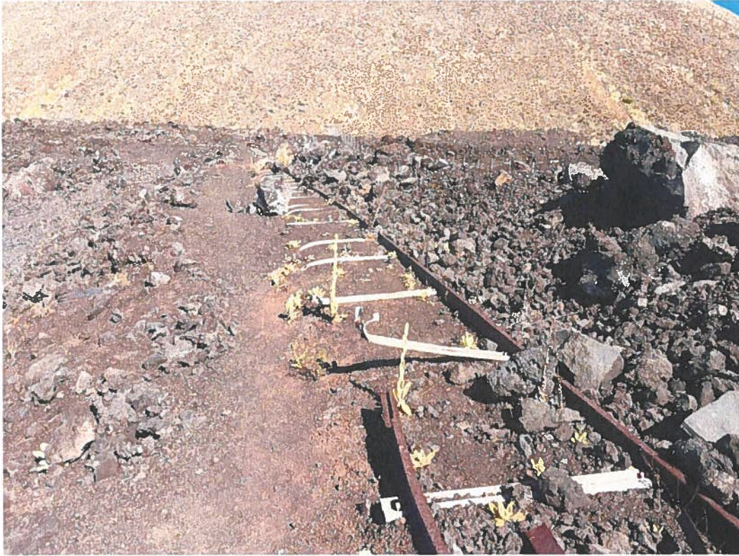
REMNANT TARGET TRACK