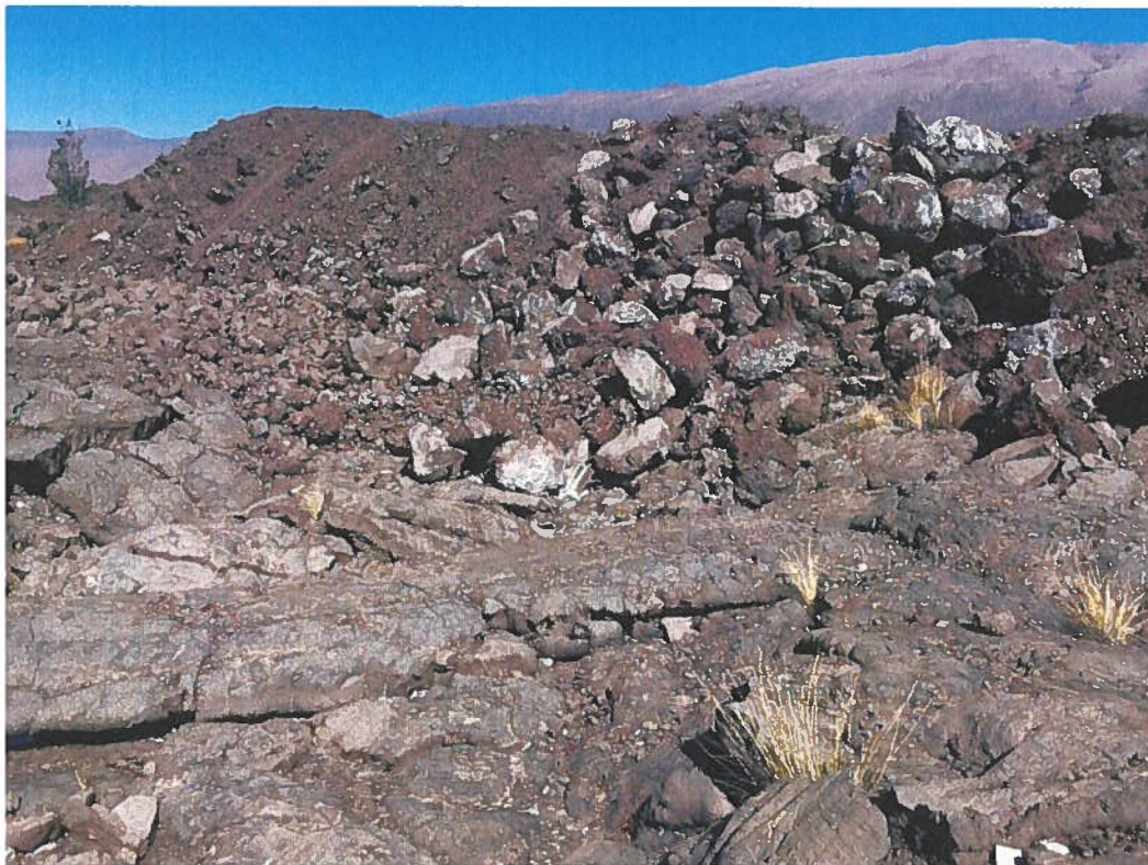
AREA CLEARED OF USED ARTILLERY SHELLS