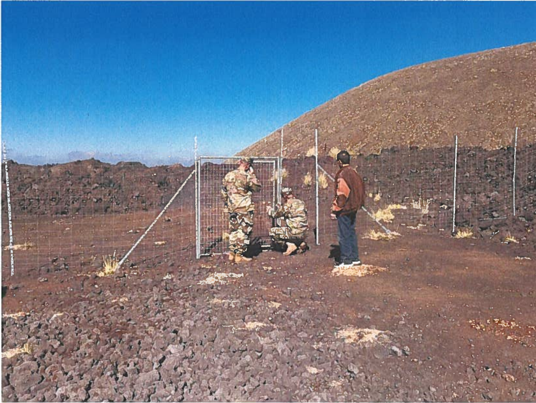
ENTRANCE TO FORMER BAZOOKA RANGE