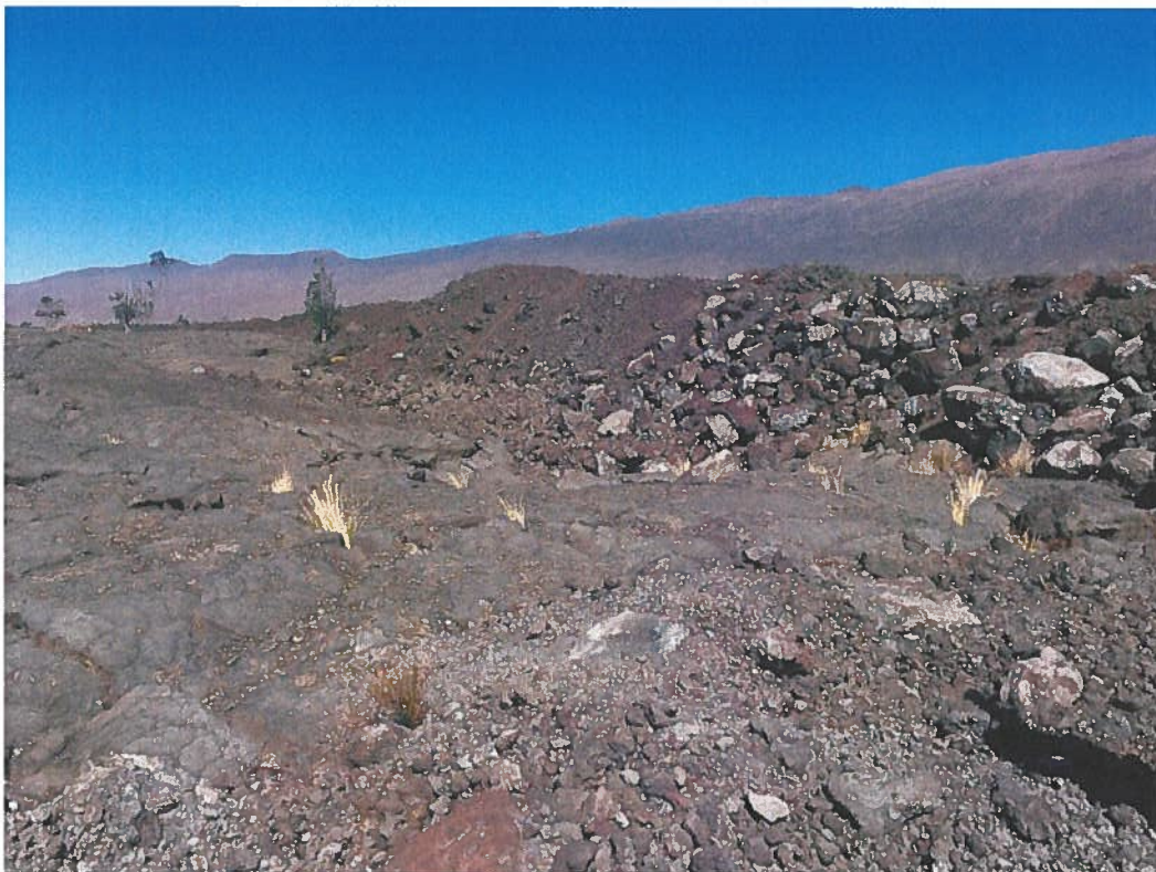
AREA CLEARED OF USED ARTILLERY SHELLS