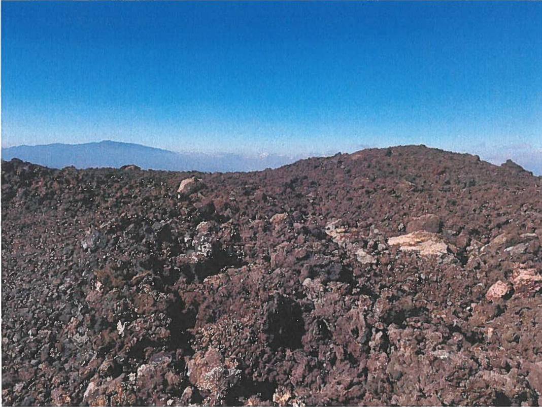
CLEARED BAZOOKA SHELL AREA