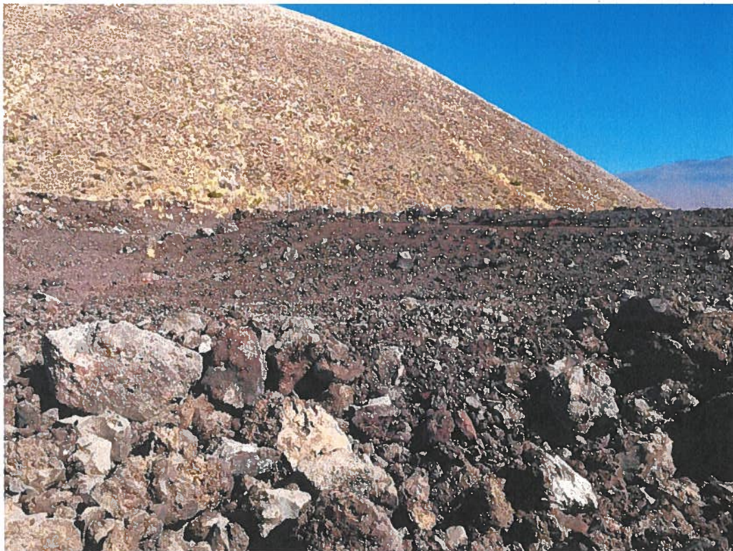
CLEARED BAZOOKA SHELL AREA