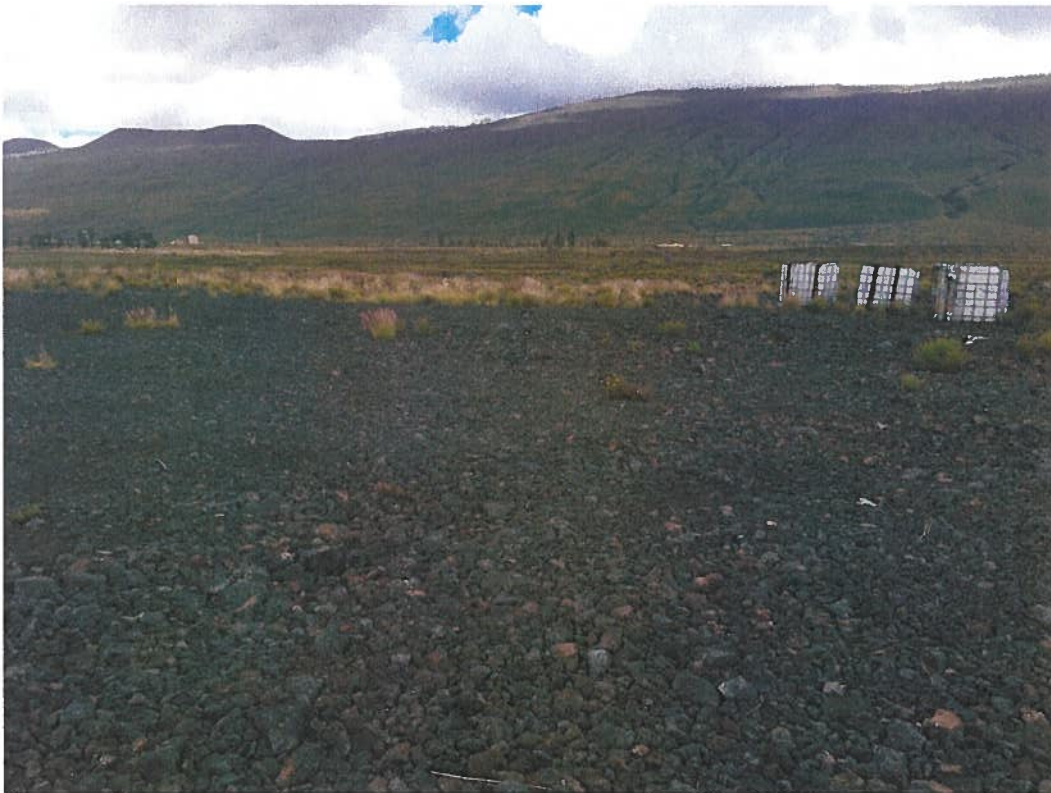
AREA PREVIOUSLY USED TO STORE VEHICLES FOR TARGET PRACTICE