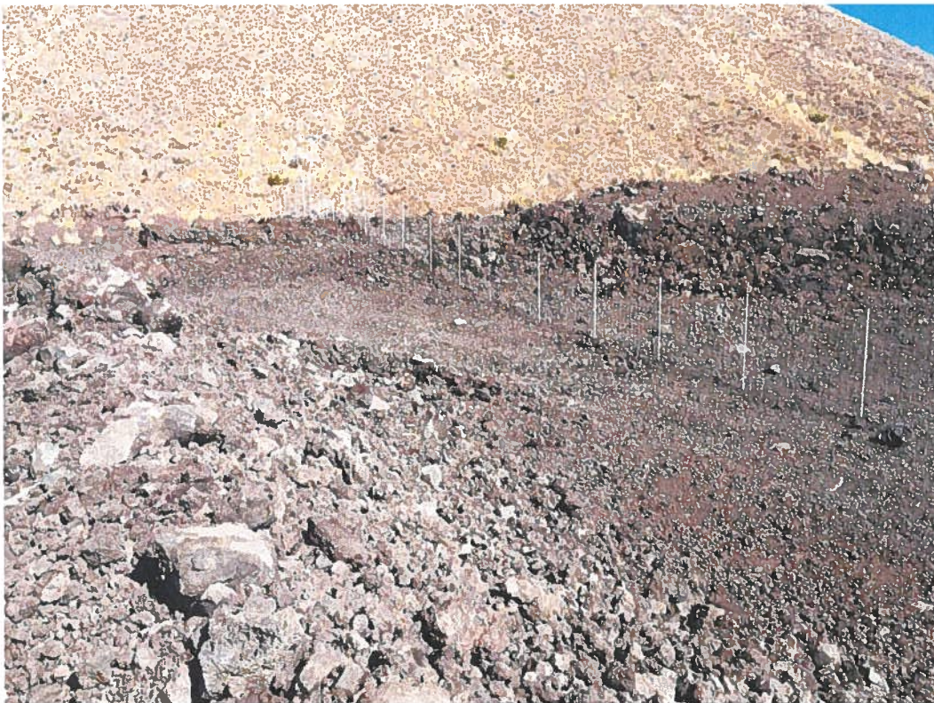
BAZOOKA RANGE PERIMETER FENCING