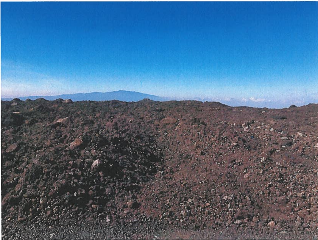
CLEARED BAZOOKA SHELL AREA