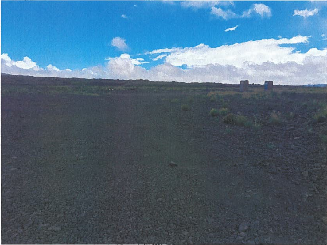
AREA PREVIOUSLY USED TO STORE VEHICLES FOR TARGET PRACTICE