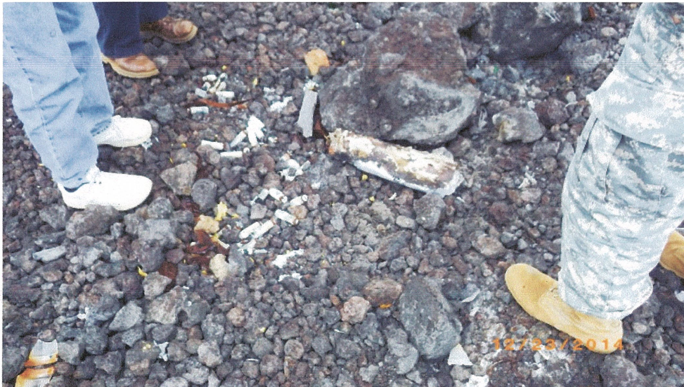
USED ARTILLERY SHELLS