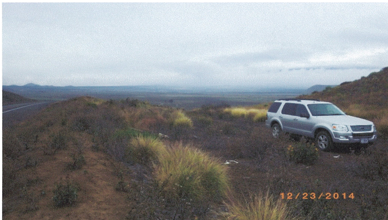
LOCATION OF USED SHELL CASINGS OFF OF RE-ALIGNED SADDLE RD.