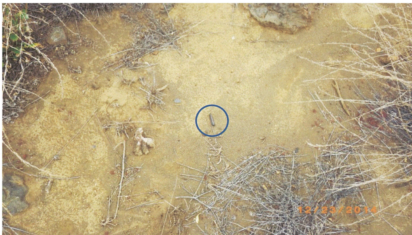
SAMPLE OF USED SHELL CASINGS