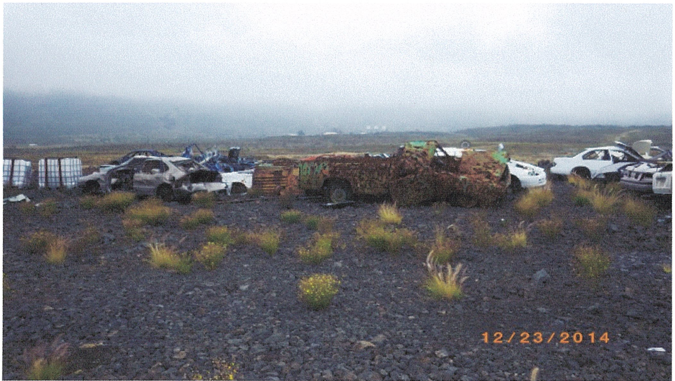
DERELICT VEHICLES USED FOR TARGET PRACTICE