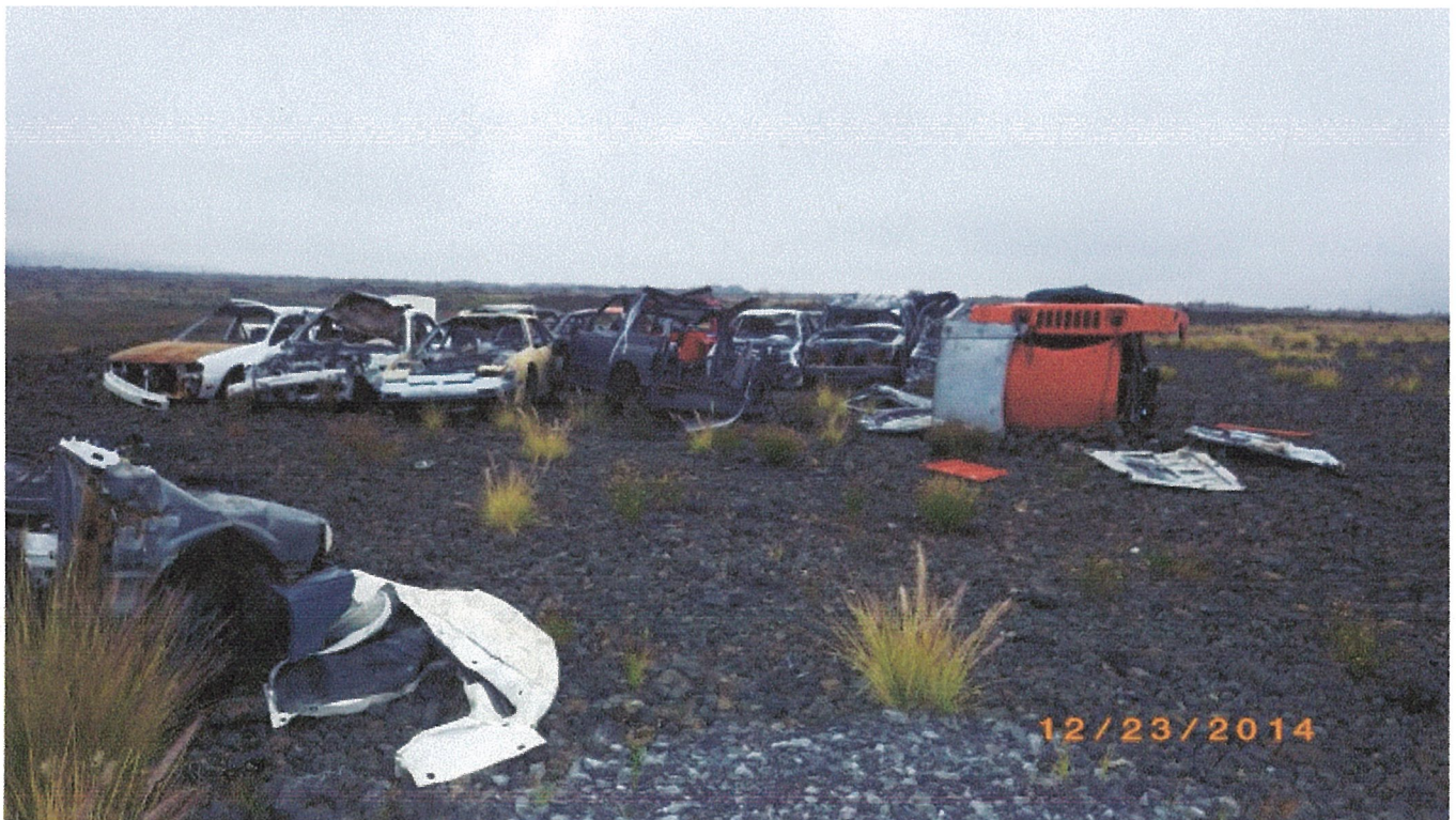
DERELICT VEHICLES USED FOR TARGET PRACTICE