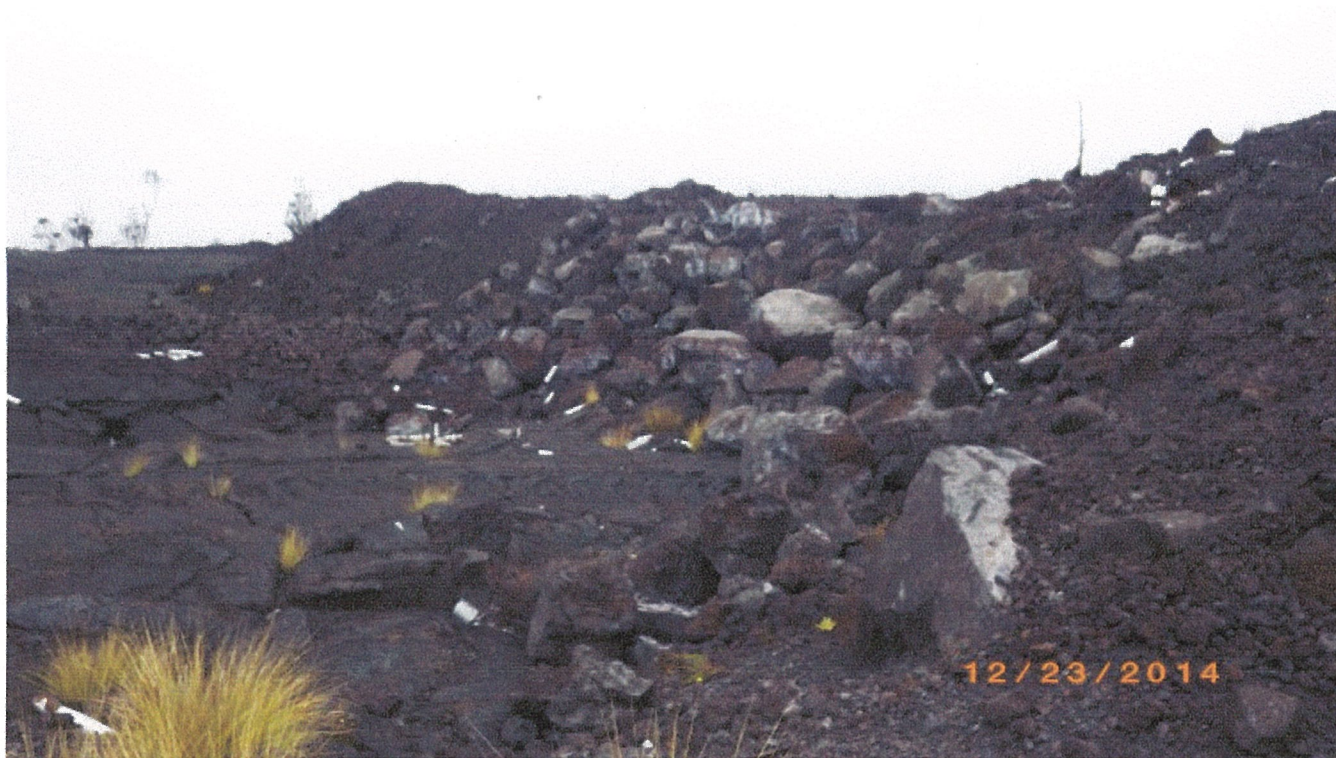
ARTILLERY SHELL DUMP GROUND