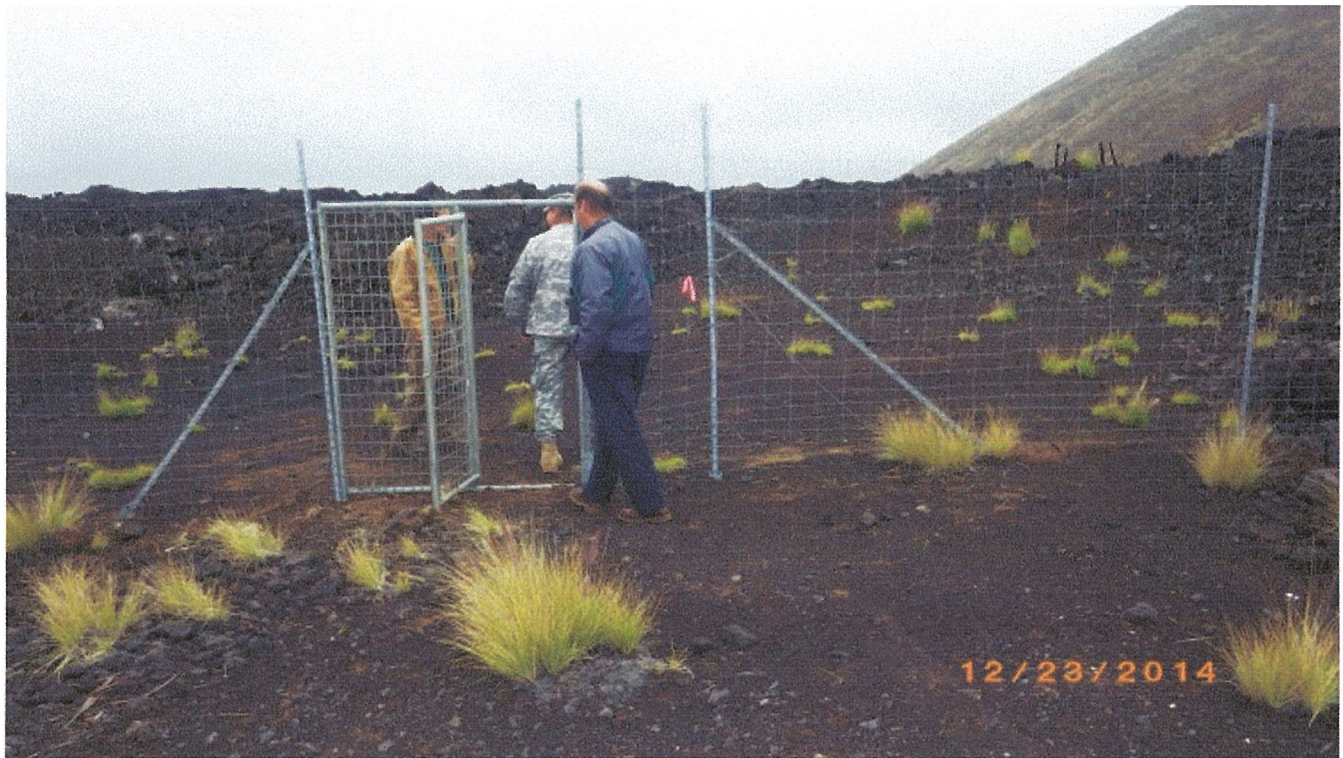
ENTRANCE TO FORMER BAZOOKA TARGET RANGE