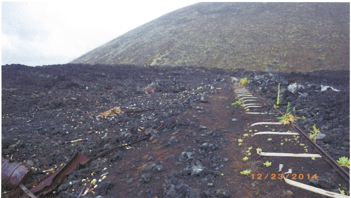
REMNANT OF BAZOOKA TARGET RAIL TRACKS