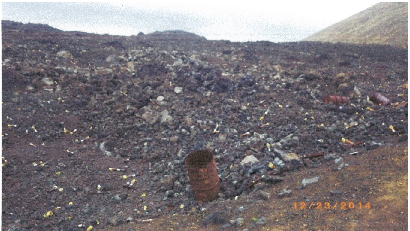
SHELL DEBRIS FROM BAZOOKA TARGET RANGE