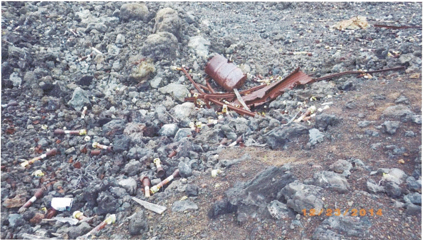
SHELL DEBRIS FROM BAZOOKA TARGET RANGE