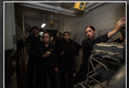
Sailors test and transfer steering control to the pilot house from port aft steering prior to departing the pier Oct. 26.