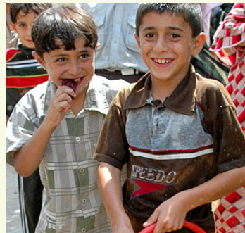
Iraqi children enjoying the availability of new water.

ERBIL PROVINCE, Iraq — More than 26,000 residents in 13 villages receive potable water now due to 13 water well projects recently completed as part of the Iraq Reconstruction Program. The U.S. Army Corps of Engineers (USACE) began the well project initiative last year and completed it last March.