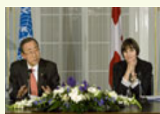
Ban Ki-moon and Swiss President Calmy-Ray.

The Compact is a five-year national plan that includes benchmarks and mutual commitments from both Iraq and the international community, all with the aim of helping Iraq