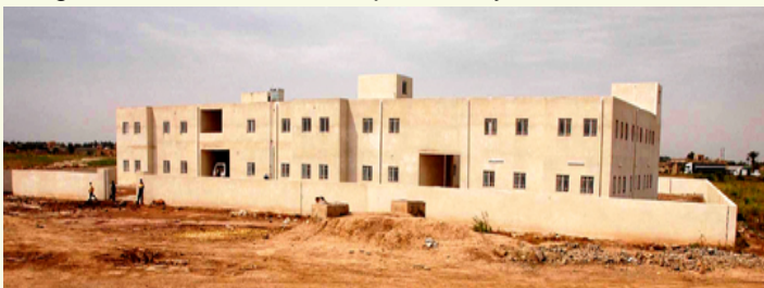
A new primary school in north Baghdad Province nears completion. The 23-classroom facility also contains a four-room guard house.