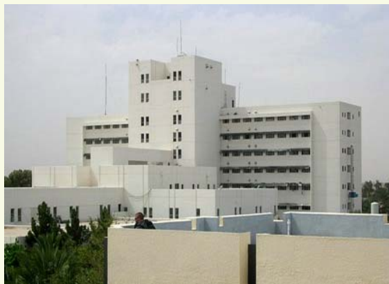
The new hospital facility of the Najaf Teaching Hospital has seven floors, it can hold over 400 patients, and has 13 operating rooms.

NAJAF, Iraq — The Najaf Teaching Hospital, a project worth over $10 million, will open in early 2007 featuring a seven-story building capable of housing 420 patients and containing 13 operating rooms. The hospital development, which has survived gun battles, as well as technical and serious security issues, first came to the attention of the Iraq Reconstruction Management Office (IRMO) in September 2004. During that month, the flooded basement, containing debris and human remains, was cleaned and repaired, as were outpatient emergency services.