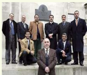
Members of the Iraqi delegation.

LONDON — A delegation of Iraqi Government officials has recently visited the Ministry of Defense and other UK Government Departments to learn more about cross-government communications work.