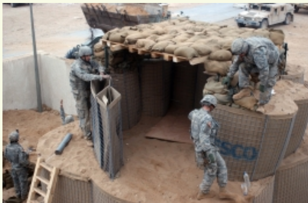
U.S. Soldiers from the 618th Engineer Company put the finishing touches on a new guard tower at a new Iraqi police station in Siniyah in December.