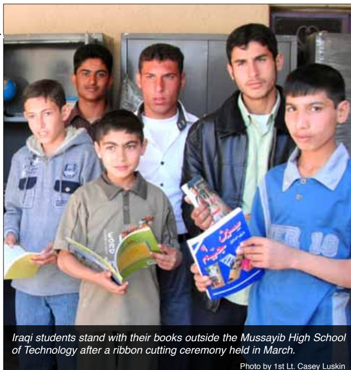
Iraqi students stand with their books outside the Mussayib High School of Technology after a ribbon cutting ceremony held in March.

Many children in northwest Babil drop out of school at a