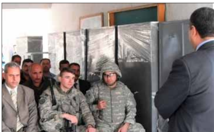
Local educators of Babil province and Soldiers of C Troop, 1st Squadron, 3rd Armored Cavalry Regiment, listen as the provincial director of education speaks at the re-opening of the Mussayib High School of Technology in March.