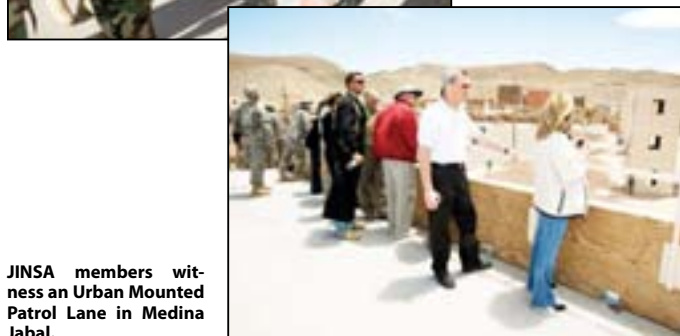
JINSA members witness an Urban Mounted Patrol Lane in Medina Jabal.