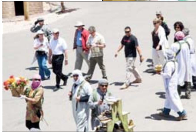
Members of JINSA walk the streets of Medina Jabal and interact with role players.