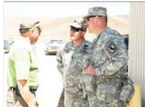
Commanders from the Regimental Support Squadron speak to a member of JINSA during a site visit.