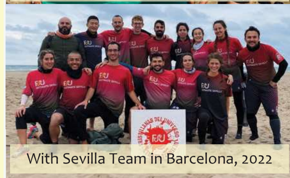
With Sevilla Team in Barcelona, 2022