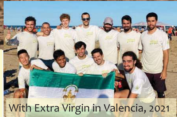
With Extra Virgin in Valencia, 2021