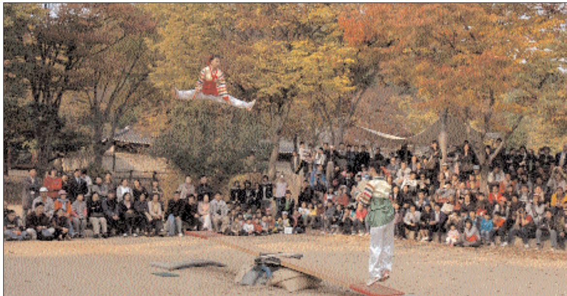
Performers wowed the crowd with acrobatic feats on seesaws at the Korean Folk Village on the Gyeonggi Cultural and Industrial tour Oct. 30-31.