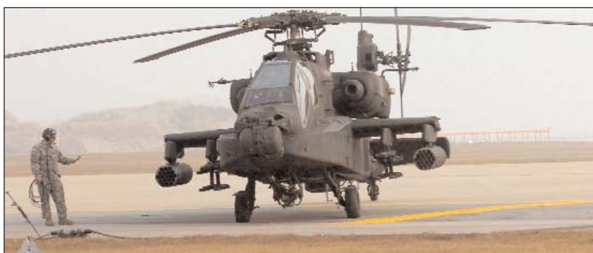
Cpl. Lee, Sang Duk

The replacement A-10 attack aircraft will provide greater responsiveness, longer range, larger precision munitions, greater options for ordnance employment, greater survivability and increased interdiction