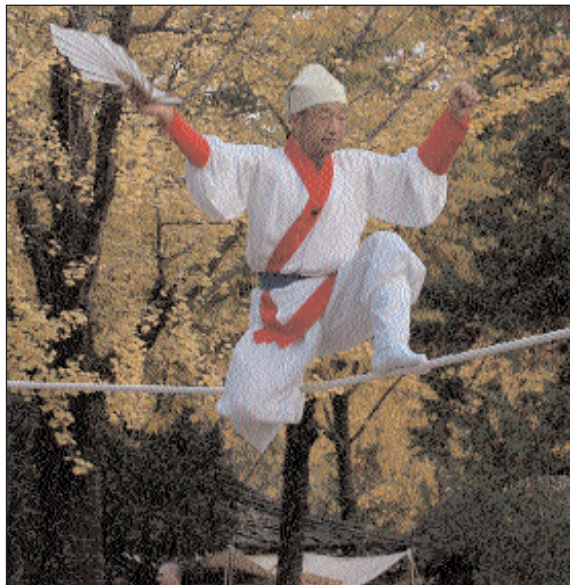
An entertainer performs on a tightrope using some impressive acrobatics to wow the crowd at the Korean Folk Village on the Gyeonggi Cultural and Industrial tour Oct. 30-31.