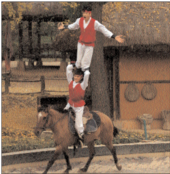
Actors perform various horse riding tricks at the Korean Folk Village on the Gyeonggi Cultural and Industrial tour Oct. 30-31.