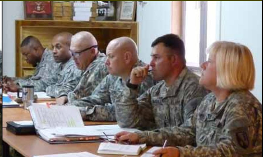
Senior NCOs from the 46th ECB (H) and the 225th Engineer Brigade evaluate Soldiers during the Promotion and Soldier of the Month Board, 1 April.