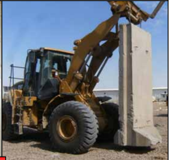
An A CO Soldier moves T-wall barriers.