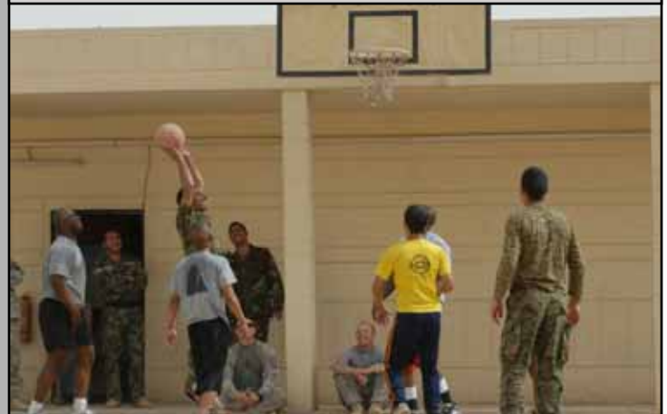
"Steel Spike" Soldiers play a game of Basketball with the 6th Iraqi Army engineers, 8 March.