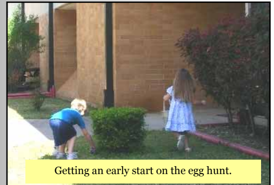
Getting an early start on the egg hunt.