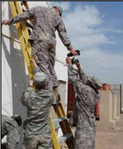
The S6 section grounds an antenna on HSC's Tactical Ops Center.