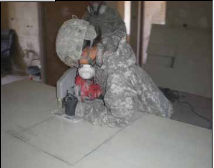
SPC Ortiz uses a saw to make cuts in wood.