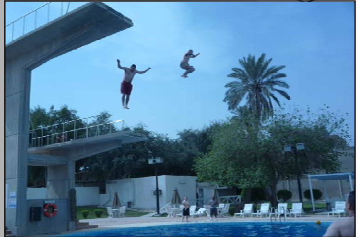
"Beast" Soldiers enjoy the pool at Freedom Rest in the International Zone.