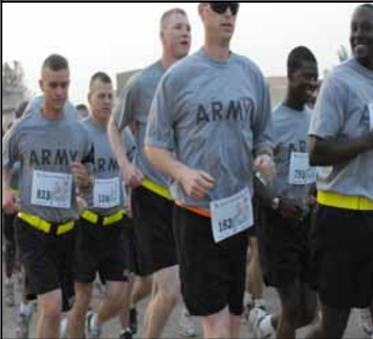
"Beast" Soldiers get a great start during the SFC Paul R. Smith Memorial Race, 5 April.