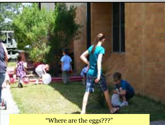
"Where are the eggs???"