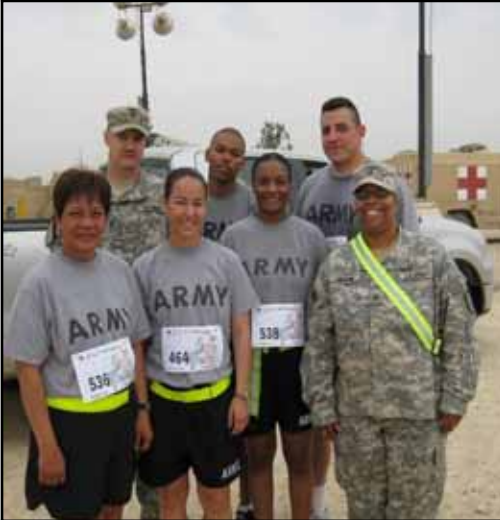
HSC runners and supporters take a photo before the Paul R. Smith Run, 5 April.