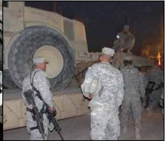
HSC EQ PLT Soldiers tie down a roller to a trailer before heading out on mission, 7 April.