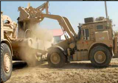
SSG Arispe & SGT Bartholomae ground guide engineer equipment. Insert: SPC Castillo operates an excavator to remove excess dirt on Camp Liberty.