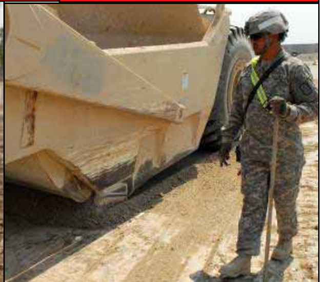
SGT Deluna ground guides a bulldozer while an Iraqi engineer practices the proper technique.