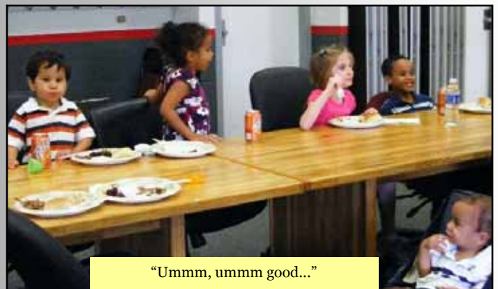
"Ummm, ummm good..."

To submit photos of your FRG event, contact your FRG Leaders or send to: janeene.yarber@mnd-b.army.mil (Please provide names & date of the event)