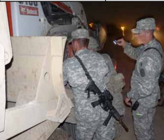
HSC EQ PLT Soldiers secure a bobcat on a trailer before heading out on mission, 7 April.