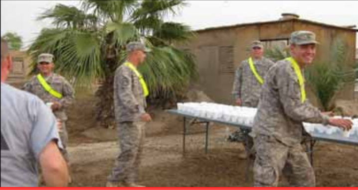
"Steel Spike" Soldiers hand out water to runners at one of the many water points during the 7.1 mile race, 5 April.