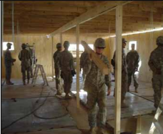
2 ND Platoon Builds a 32' X 72' Gym.