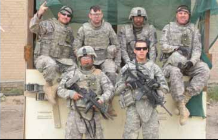
Support PLT takes a photo during a sniper screen mission.