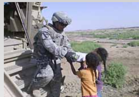
277th EN CO Soldiers make new friends at JSS Istiqlaal.