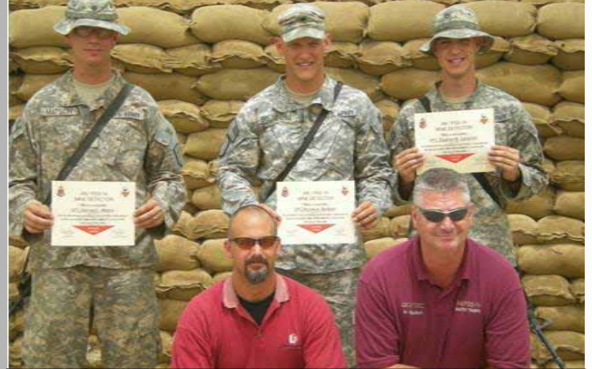
HSC Soldiers hold up their certificates after completing a Mine Detector Class.