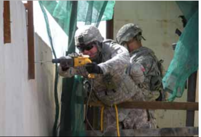
Support PLT Soldiers emplace sniper screen.