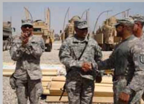
B CO "Beasts" celebrate a very special promotion at COP Carver.