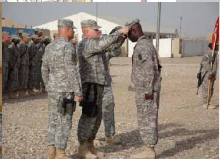
SFC Rhodes is promoted to MSG 22 May. He was then laterally promoted to 1SG.