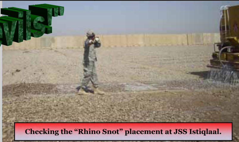
Checking the "Rhino Snot" placement at JSS Istiqlaal.