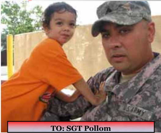
TO: SGT Pollom