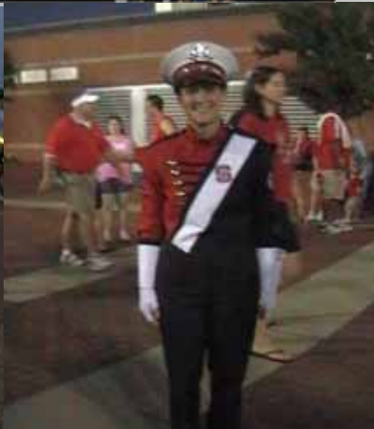
To: MSG Roman