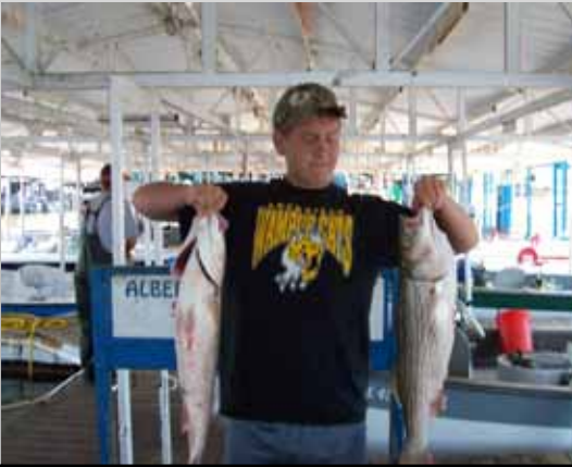
My son with a few of his "keepers."