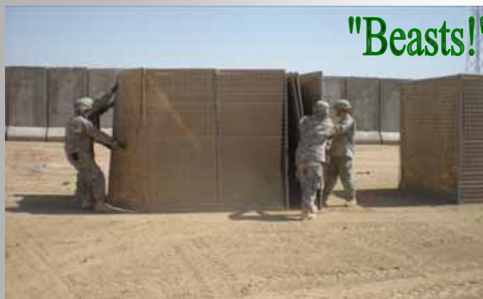
EM Soldiers setup HESCO barriers on a range. The Soldiers will next fill the barriers with sand.