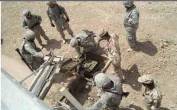
Equipment PLT shows Iraqi Army Engineers how to use the Concrete Module during joint training.