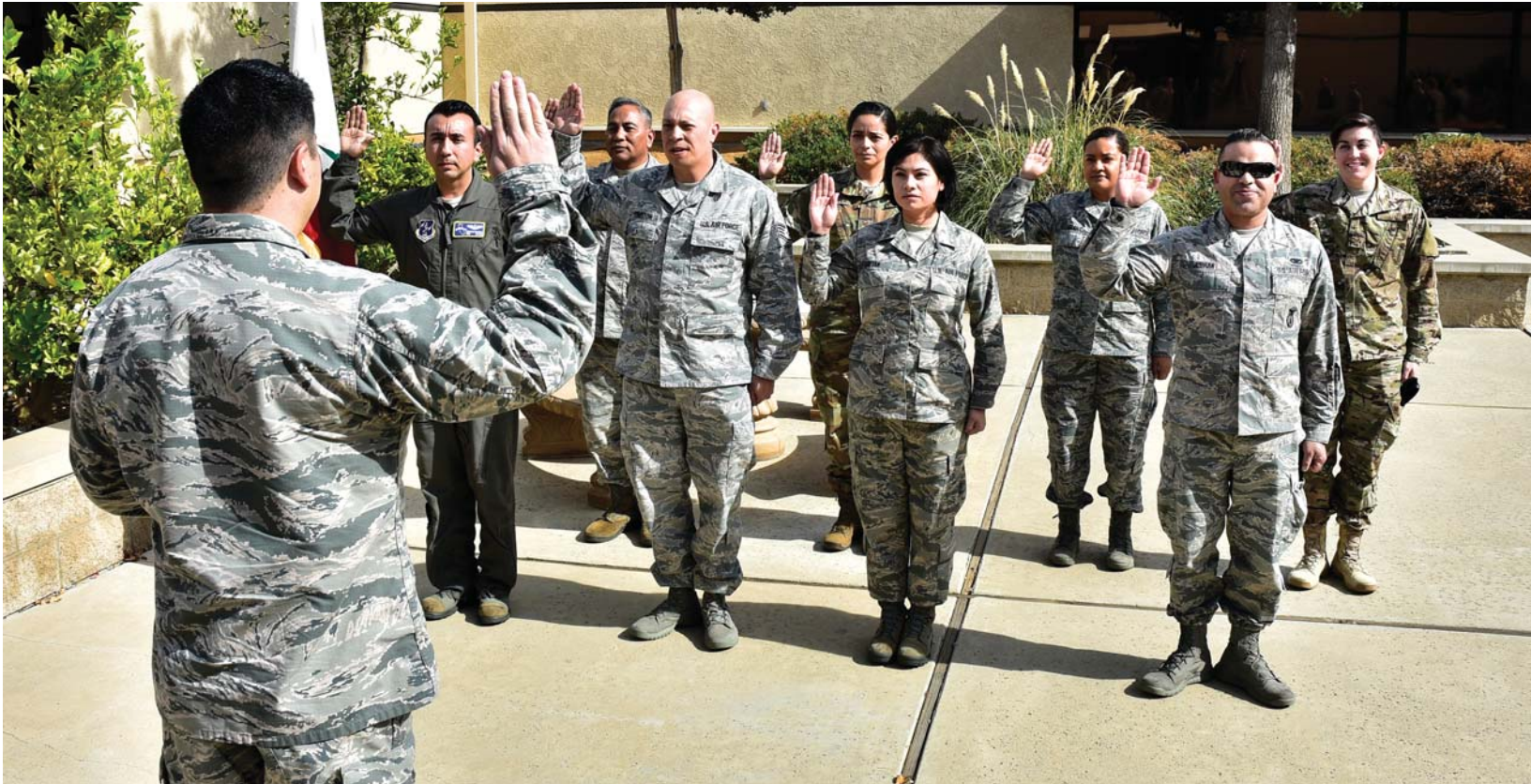
A mass re-enlistment was performed by the 163d Attack Wing Nov. 4, 2018, at March Air Reserve Base, California. Eight people re-enlisted that day and the mass re-enlistments are held monthly at the wing's headquarters building.