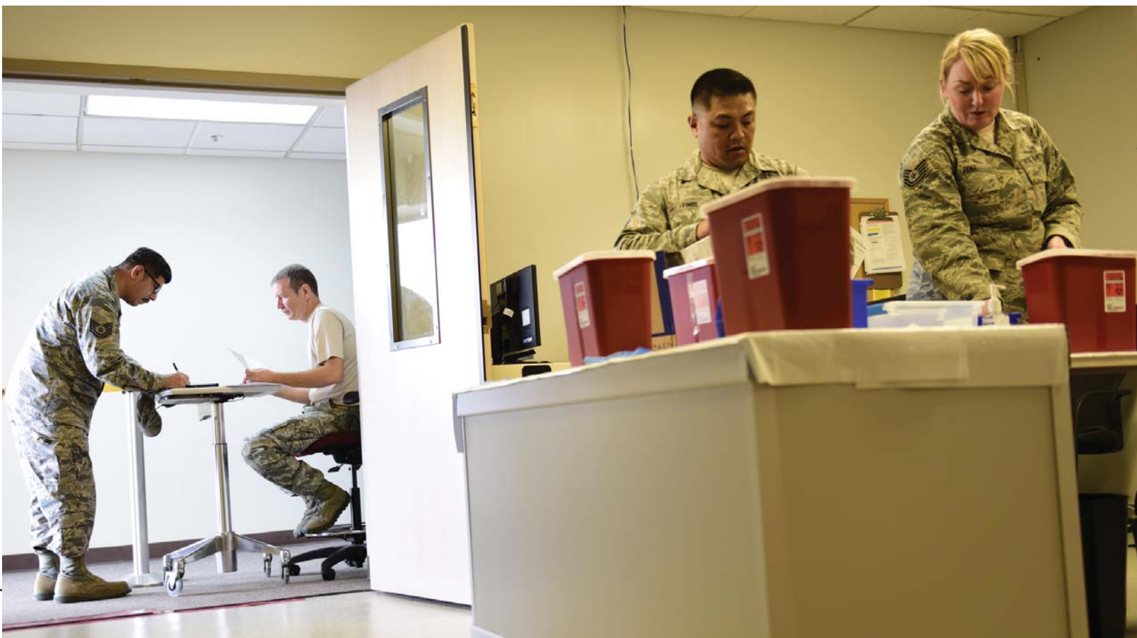
The 163d Attack Wing administered flu shots to all of its personnel Nov. 4, 2018, at March Air Reserve Base, California. The entire wing receives its flu shots during the fall annually.