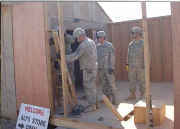
955 Soldiers help to expand Ali's Store located on Camp Liberty.