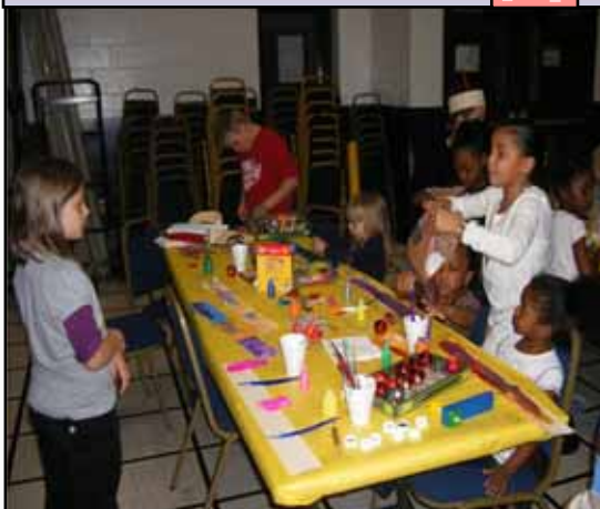
Bravo "Beast" kids make presents for their deployed parents.