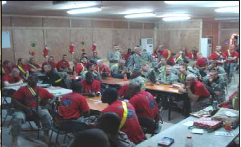
B CO enjoys a Christmas Party in the Rail Room on Camp Liberty.