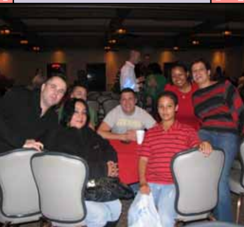
"Happy Holidays" from the Rear Detachment at Fort Polk!