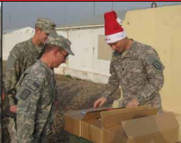
A 955 Soldier looks into the goodie boxes during the Christmas Eve MNT/DSU gift-giving by Spike 6.