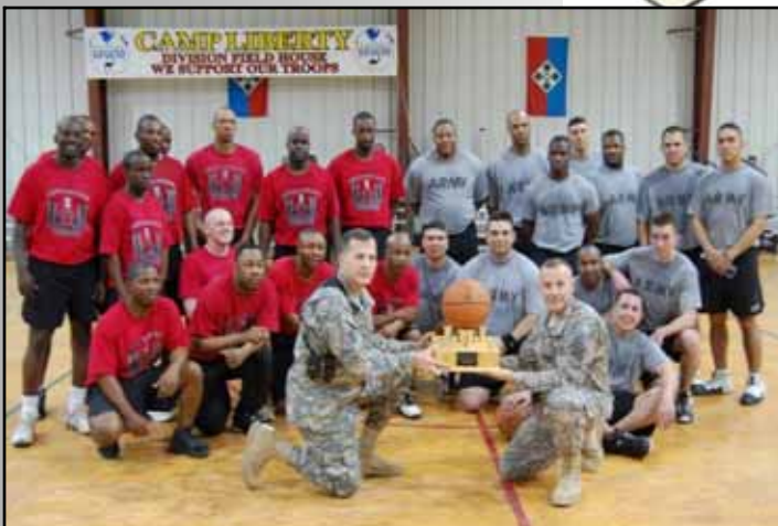
B Co, the 2008 "Basket-Brawl" champions pose w/ the 890th EN BN basketball team, Brig. Gen. Talley & CSM Zebrauskas, 25 Dec.