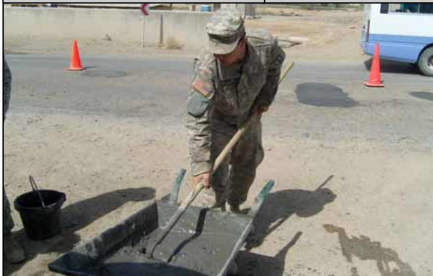
An Alpha Company Soldier prepares to make a road upgrade on the Victory Base Complex.