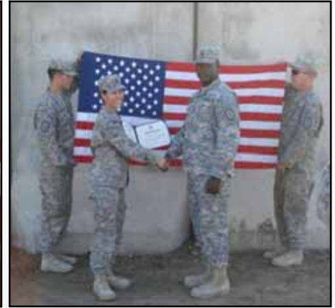
SPC Grandberry RE-UPS for 6 more years!