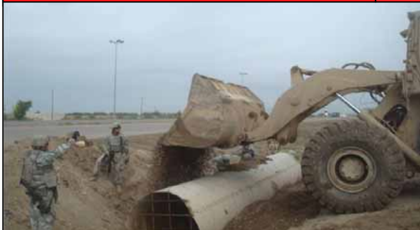
955 Soldiers emplace a culvert at the Al-Ban Apartments in Baghdad, in December.