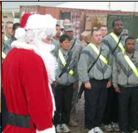
Amazingly enough, Santa Claus makes a visit to HSC Soldiers on Christmas Day!