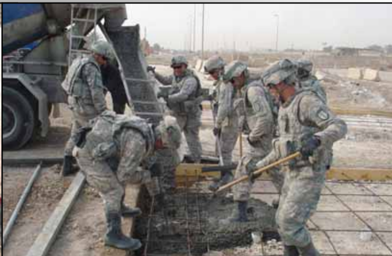
A CO Soldiers pour concrete at a project site at Thunder Road in Baghdad.