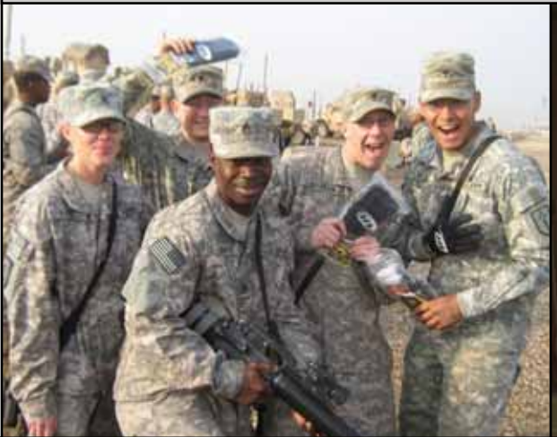
DSU & Maintenance Soldiers show their excitement after receiving Christmas Presents, 24 Dec.