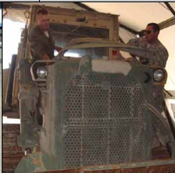
SPC Barber & SPC Antonio conduct maintenance on a bulldozer.