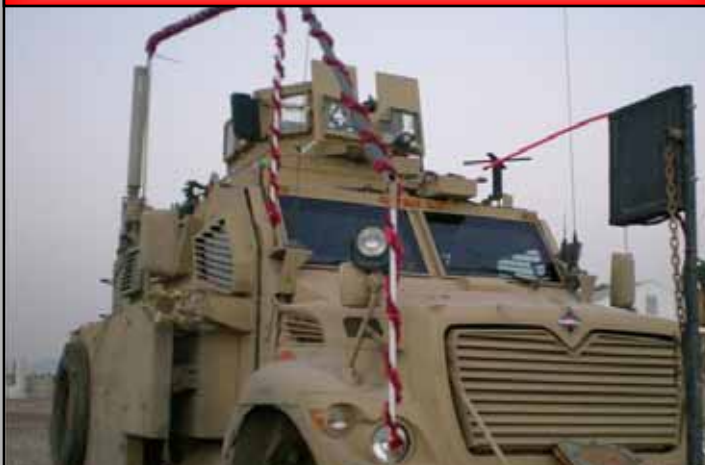
Santa Claus is able to visit HSC Soldiers thanks to this "Desert Sleigh."