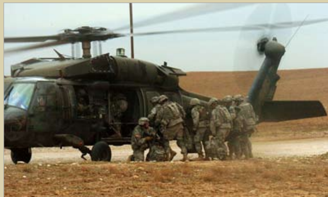
A soldier watches for enemy action as fellow soldiers board a U.S. Army UH-60 Black Hawk helicopter following a cordon and search operation in Tall Aswad, Iraq. The soldiers are from Delta Company, 2nd Battalion, 7th Cavalry Regiment.

In the past three weeks, two Army UH-60 Black Hawks and two AH-64 Apaches have been shot down, killing 16 soldiers, he said. — Full Story