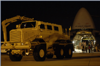
A Mine Resistant Ambush Protected vehicle is loaded onto a C-5 Galaxy aircraft Aug. 16 at Charleston Air Force Base, S.C. Air Mobility Command assists with the movement of MRAP vehicles to U.S. Central Command's area of responsibility as directed by the National Command Authority, the Joint Staff and U.S. Transportation Command.

Two Buffalo Mine Resistant Ambush Protected vehicles, known as "MRAPs," were loaded onto C-5 Galaxy aircraft Thursday night at Charleston Air Force Base, S.C., to be shipped to Iraq. This latest shipment is part of the Defense Department's push to get as many of the new vehicles to troops in combat as quickly as possible. – Full Story