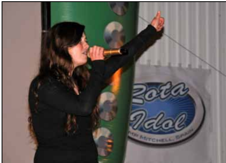
3rd place winner, BUCN White, performs