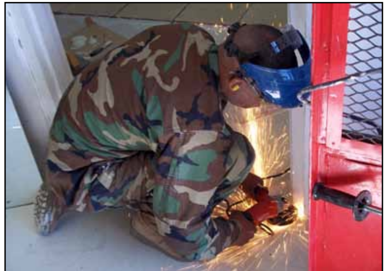
BUCN Roches on the job at Camp Mitchell

Under the new instruction it is stated that all service members of eligible to earn a pin must complete the requirements before their allotted time runs out. To prevent any adverse action against any Det Macedonia Seabees,