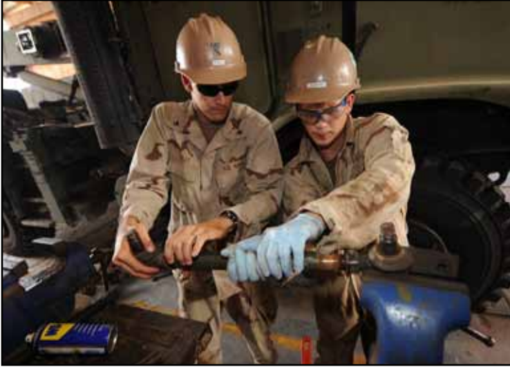
CMCN Storie and EO2 Polly on the job at Camp Lemonnier