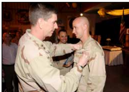
ITSN Compton pinned SCWS at Camp Lemonnier