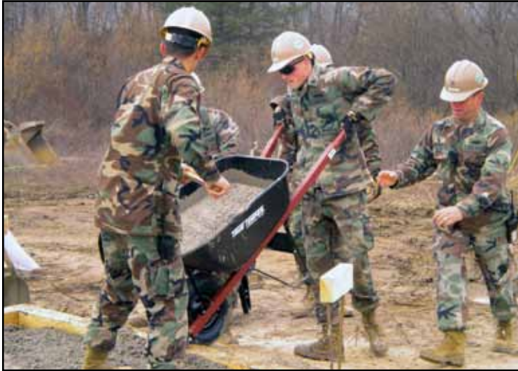
Det Croatia crewmembers on the job

Being attached to Main body for almost three months isn't what Detail members are used to, as past Details have usually gone straight to the site right away. Since the beginning of this deployment, it has seemed to take forever to push out. Then, all the sudden... bam, the week was nipping at our heels!