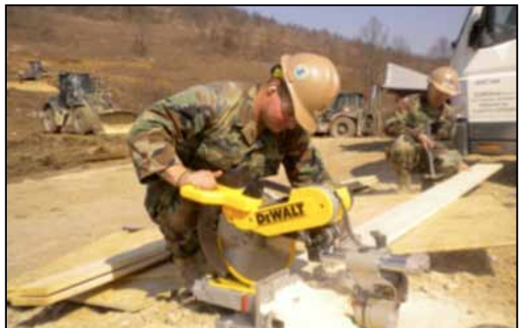
BU3 Desalvo and UT2 Delaramente on the job in Croatia

With the coming months ahead here in Croatia, we can only expect the positive work ethics of Detail Croatia to get stronger as they continue pushing through the mission.