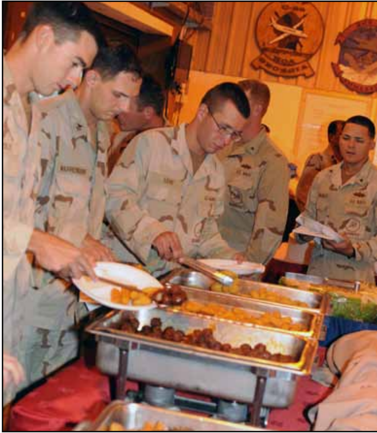
Seabees in line for the Seabee Ball meal at Camp Lemmonier

More than 200 Sailors, Naval Mobile Construction Battalion (NMCB) 74 Detail Horn of Africa (Det. HOA) Seabees and Combined Joint Task Force – Horn of Africa service members celebrated the U.S. Navy Seabees’ 69th birthday with a ball held March 19 at the 11 Degrees North Recreation Center.