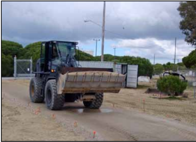
EOCN Graves on the job at NAVSTA Rota

Alfa Company takes pride in everything we do! Since assuming our duties in Rota, Spain, we have been studying for advancement exams, Seabee Combat Warfare Qualification tests and boards, standing weekly duty, maintaining our barracks to an unmatched level of perfection (Alfa standards), while keeping up with all our other daily tasks.