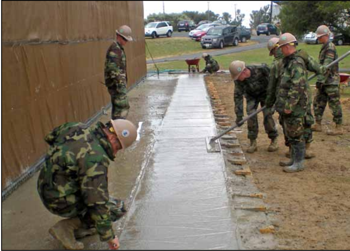
Det Romania Seabees on the job on NAVSTA Rota

The month of March has proven to be a very enthusiastic morale builder for Det Romania. From finishing projects efficiently to taking on new ones, the troops continue to hold a positive attitude and display successful results.