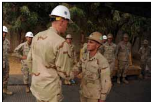
EO2 McAvoy awarded a CO's coin in Ethiopia