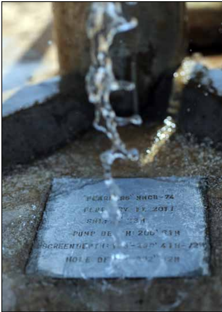
Water pours over the well's splash plate