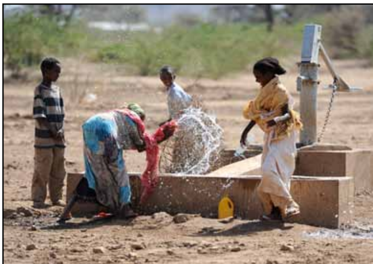
Ethiopian children play in the water