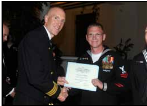
EO2 Ambers pinned SCWS in Jerez, Spain