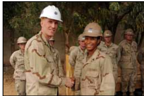
CE3 Biggs awarded a CO's coin in Ethiopia