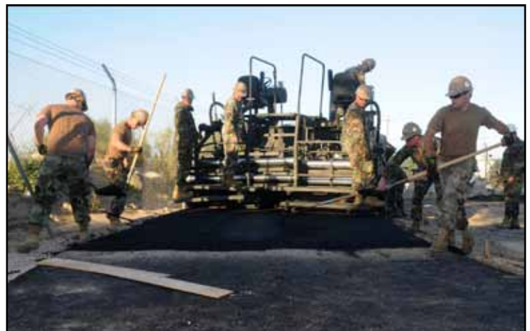
Alfa Paving Crew on the job at NAVSTA Rota

All in all, Naval Mobile Construction Battalion 74’s Alfa Company has fully engaged in this green deployment in many different aspects, and we will continue fulfilling the missions and tasks successfully until the day we head home, striving for the best at every moment.