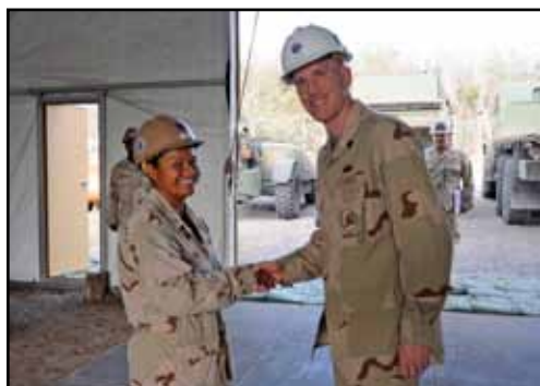
BU3 Rara presented a CO's coin in Manda Bay