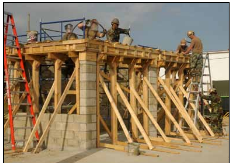
Bravo Company Seabees on the job at the Camp Bus Stop project

One of the easily over looked projects, but also one of the most needed project on Camp was the Walkway Project. Led by BU3 McCrary and her crew, they were able to replace two well needed sections of walkways leading to and from the barracks. Not only did they address a badly needed facelift but also a major safety concern.