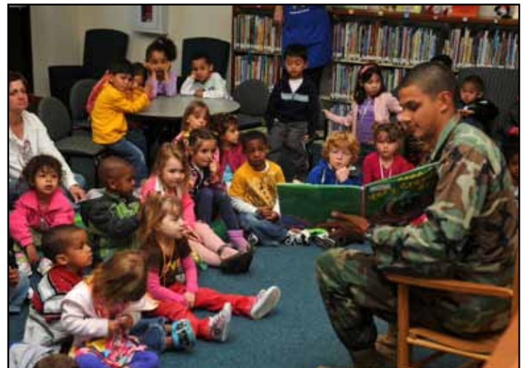
UTCN Delasalas reads to children at the library

"We like it, we think the kids enjoy it and the parents also enjoy it. That military people read to the kids, I think they enjoy that a lot. I think it's something good for them, and we're going to try to implement it as much as we can," said Fernandez.