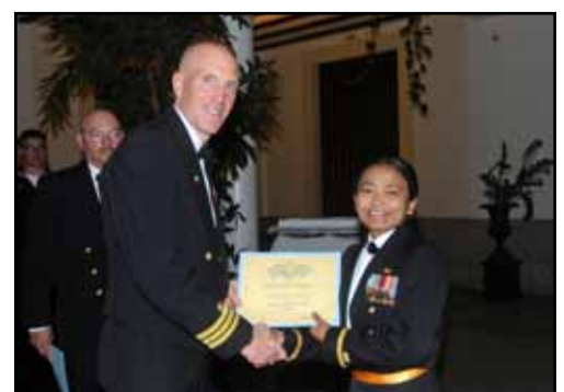
ENS Changcoco pinned SCWS in Jerez, Spain