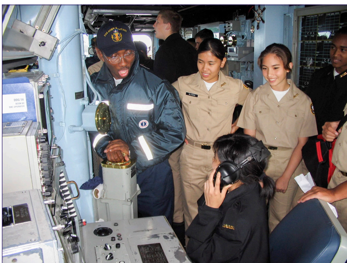
66th Black Ship Festival photo on USS John S. McCain.

Later in the evening, the atmosphere shifted from celebration to reflection during a memorial service at Gyokusenji Temple. Surrounded by the scent of ocean air and incense drifting through the temple grounds, visitors gathered to honor the longstanding relationship between the United States and Japan while performances from the U.S. 7th Fleet Band echoed through the hillside overlooking Shimoda Bay. As the sun set along the waterfront, residents and visitors crowded the shoreline