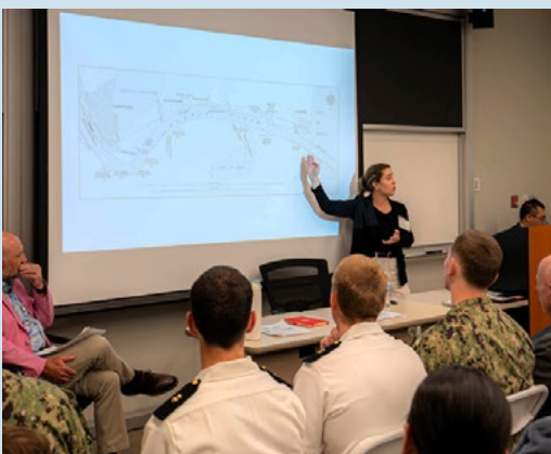
U.S. Naval Academy

In September, the United States Naval Academy hosted the McMullen Naval History Symposium, a conference that brings together historians to discuss naval and maritime history. The Academy selected 20 NHHC staff members to participate in panel discussions on their recent research, with topics ranging from naval technological advances to damage control procedures and specific engagements, such as the U.S. Navy's actions in Veracruz, Mexico, in 1914 and the Navy's role in the Pacific from 1898 to 1907. Representatives from around the world, including the United Kingdom, Spain, Canada, the Netherlands, and Chile, attended the McMullen conference, providing NHHC staff with the unique opportunity to interact with global scholars and present on the Navy's rich history.