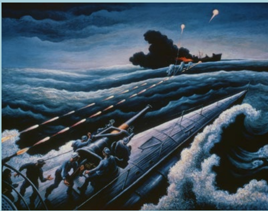
NHHC Art Collection

The NHHC art collection contains more than 20,000 paintings, prints, drawings, and engravings of naval ships, personnel, and operations. To ensure these pieces of art are shared with the public, NHHC provides loans to museums across the country. From November 7 to July 31, NHHC is loaning the Thomas Hart Benton collection to the MacArthur Museum of Arkansas Military History. Benton studied at the Art Institute of Chicago and joined the Navy during World War I, serving in Norfolk, Virginia. In World War II, he supported the Navy by painting art that portrayed the war effort. One such painting, Score Another for the Subs , depicts USS Dorado (SS-248) firing on a derelict ship during target practice in the summer of 1943. For more information on the collection, please visit NHHC’s website.