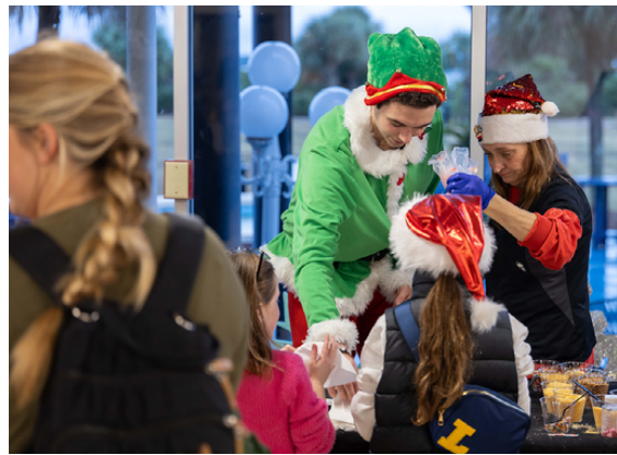
The Naval Air Station (NAS) Pensacola Morale, Welfare and Recreation (MWR) hosted their annual Tree Lighting and Trees for Troops tree giveaway Dec. 6 at the Mustin Beach Club.