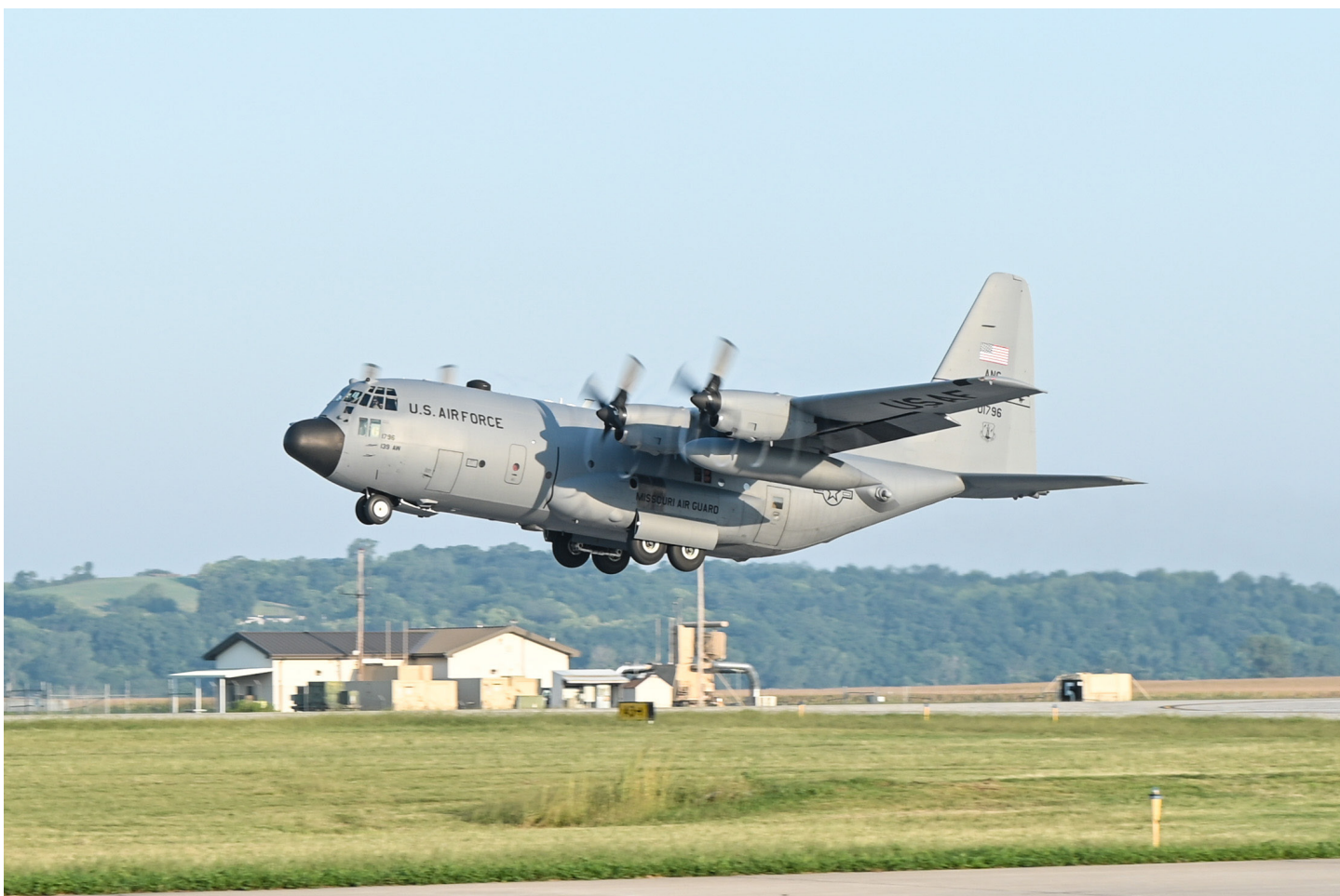
A C-130 Hercules aircraft assigned to the 139th Airlift Wing takes off at Rosecrans Aug. 25, 2024. Airmen and aircraft from the wing deployed to U.S. Africa Command's area of responsibility.