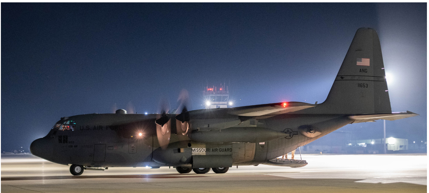
A C-130H Hercules waits to be refueled on Feb. 13, 2024. Aircrews conducted a 41-hour sortie in which the aircraft engines ran continuously for 45 hours and the aircraft was refueled three times.

The 139th Public Affairs team will continue building on this success, embracing innovation, and expanding our reach. We remain committed to showcasing the wing's mission and impact with excellence and engagement.