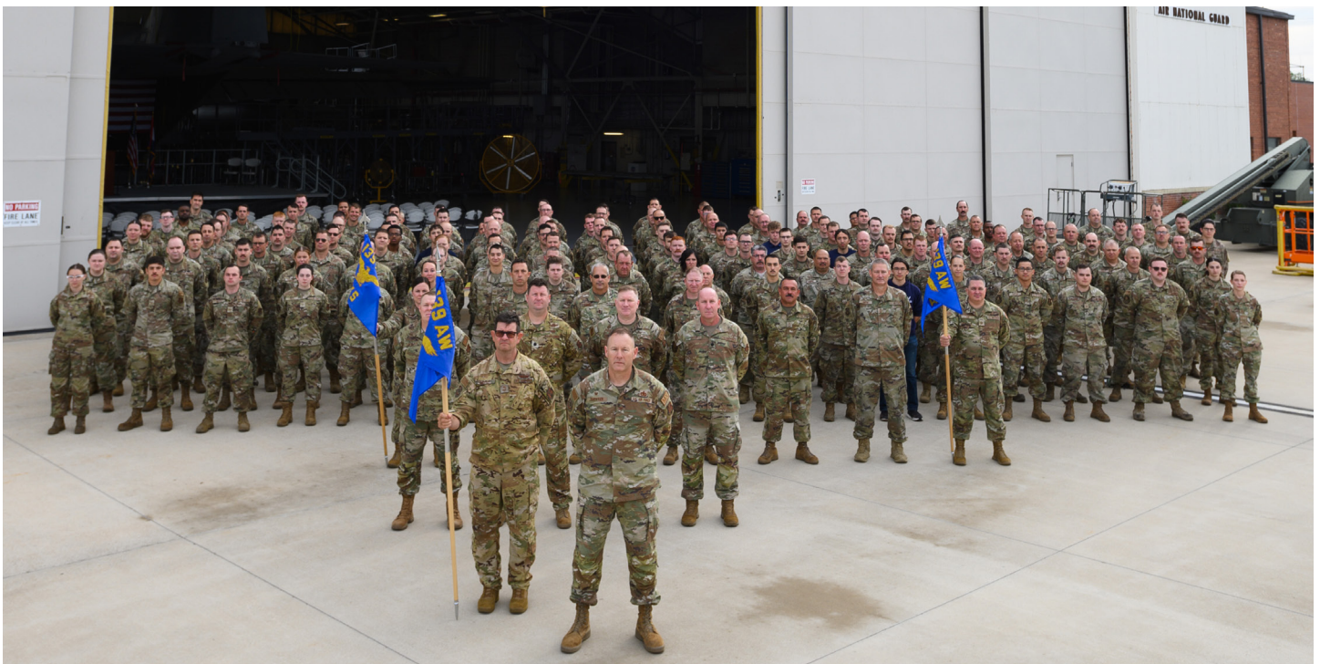
The 139th MXG poses for a photo in front of the Newlon Hangar at Rosecrans on June 9, 2024.

139th Maintainers also faced strenuous challenges in their day-to-day operations. In March, the St. Joseph area was struck with serious hail damage resulting in seven aircraft being rendered non mission capable. To expedite the maintenance process, two depot maintenance engineers arrived on scene within three days to expedite the maintenance process allowing three 139th Maintainers to swiftly map all the dents on each of the aircraft resulting in nearly 6,000 total dents. Across the entire fleet, 12 elevator trim tabs were damaged as well as two elevators- one of