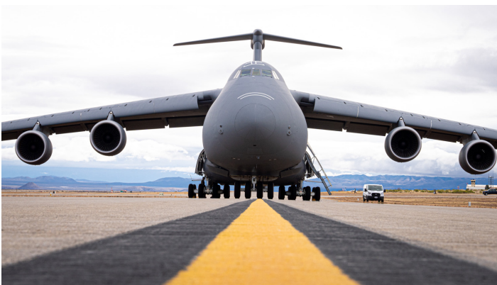
A U.S. Air Force C-5M Super Galaxy assigned to the 22nd Airlift Squadron, sets on the flight line at Fort Huachuca, Arizona, January 23, 2024.

The AATTC is again answering the call and working to train the MAF fleet by developing and facilitating the historic Mobility Datalink Users Course. This course will instruct all Mobility Datalink Users and Support Personnel on how to connect and employ Datalink in accordance with AMC directives. The initial business model is heavily based on MTT's and later will transition into fly-in's to be held at AATTC's primary location in St. Joseph, Mo. Eventually simulator-based training will be the standard, as procurement efforts are proving fruitful, and state-of-the-art hardware will soon be available to our instructors. We also train munitions Airmen at AATTC. We have revived the Weapons Task Qualification Managers Course (WTQM) as a regional MTT course created by our munitions subject matter experts to ensure that Mobility Munitions professionals become experts in flare and chaff loading and usage.