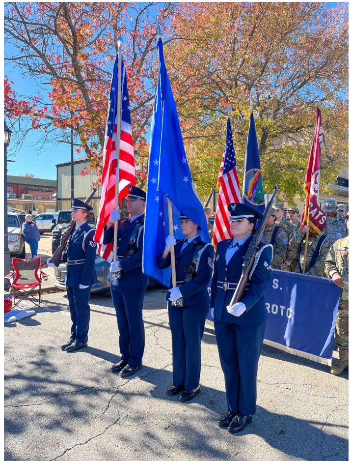
Airmen from the 139th Honor Guard walk in the Leavenworth County Veterans Day Parade on November 11, 2024, in Leavenworth, Kansas.