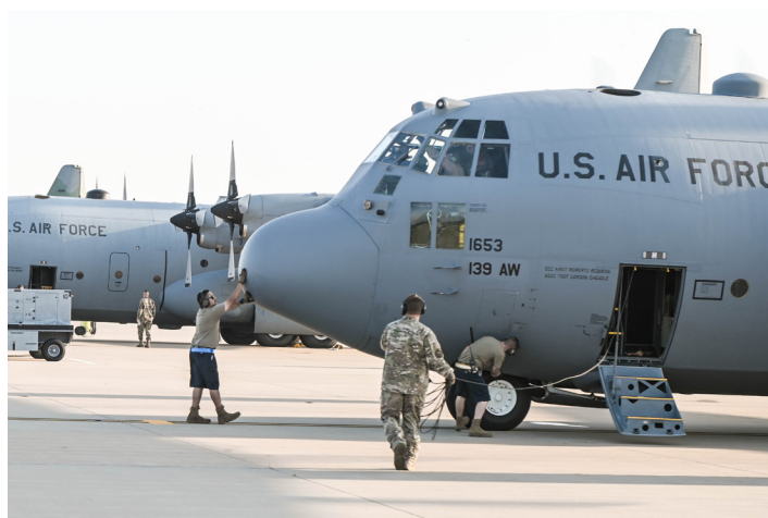
A C-130 Hercules aircraft prepares to take off at Rosecrans Aug. 25, 2024. Airmen and aircraft from the wing deployed to U.S. Africa Command's area of responsibility.