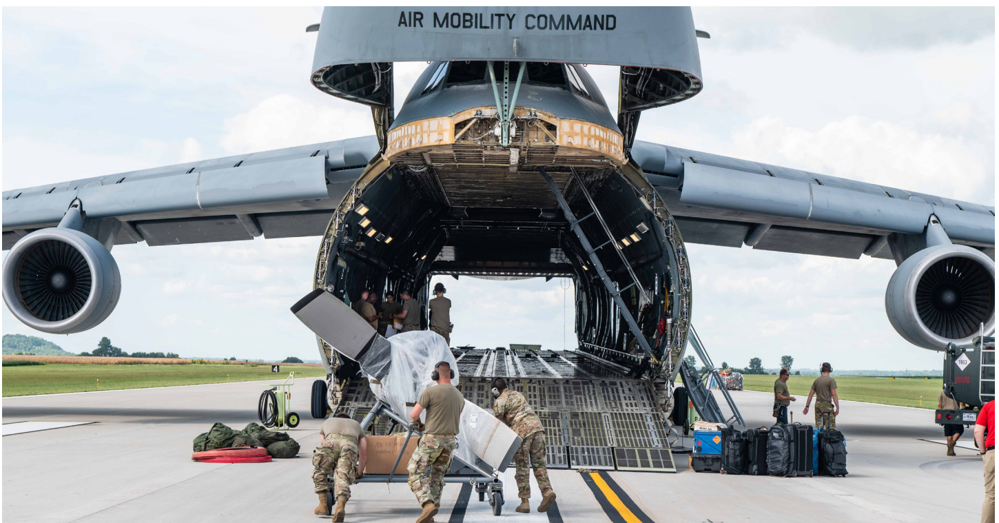
Airmen assigned to the 139th Logistics Readiness Squadron load a C-130 aircraft propeller onto a C-5M Super Galaxy cargo aircraft at Rosecrans Aug. 30, 2024. The C-5 aircraft was used to transport Airmen and equipment from the 139th Airlift Wing for an overseas deployment.

The Petroleum, Oils, and Lubricants (POL) section showcased exceptional resourcefulness and commitment in FY24. Despite a 33% reduction in full-time personnel, the team secured over $333K in facility repairs and maintenance at no cost to the 139th through strategic partnerships. They provided unwavering support, contributing an additional 252 hours to ensure operational readiness across the 139th, AATTC, and WIC. This included crucial support for AEF (STRAT AIR) and AATTC/180th OG exercises. The POL team also played a vital role in the Sound of Speed Airshow, executing 48 refuels and dispensing over 39,000 gallons of Jet A fuel, demonstrating their ability to handle large-scale logistical demands exceeding $157,000. Through efficient resource allocation, steadfast dedication, and proactive