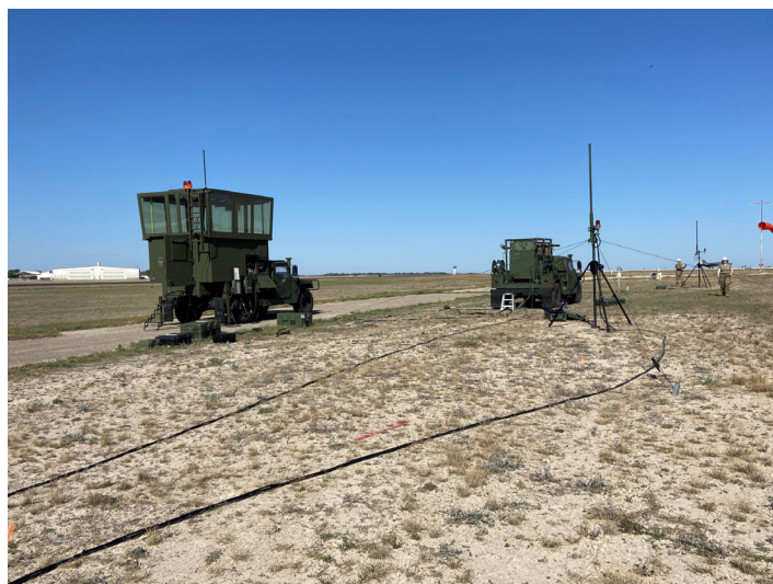
The 241st took their mobile tower to Laughlin Air Force Base, Texas, on two separate occasions.

In March, the unit was inspected by both Air Mobility Command and National Guard Bureau encompassing the Unit Effectiveness Inspection and Airfield Operations Compliance Verification where the men and women obtained an "EFFECTIVE" rating from both inspecting agencies. The men and women traveled to various exercises CONUS and overseas locations supporting PACOM, EUCOM and NORTHCOM requirements with air traffic control, logistics and administrative services. Due to reconstruction of two runway supervisory units at Laughlin Air Force Base, the unit deployed the MSN-7 mobile tower on two different occasions via C-130. These efforts afforded the 47th Flying Training Wing to continue its Undergraduate Pilot Training mission and enabled the $900K construction project, 4,600 sorties and the graduation of 60 pilots. Lastly, supporting Air Force Flight Standards Agency, we are sustaining the OT&E of THALES light deployable instrument landing system with the unit's localizer, site survey and maintenance capabilities.