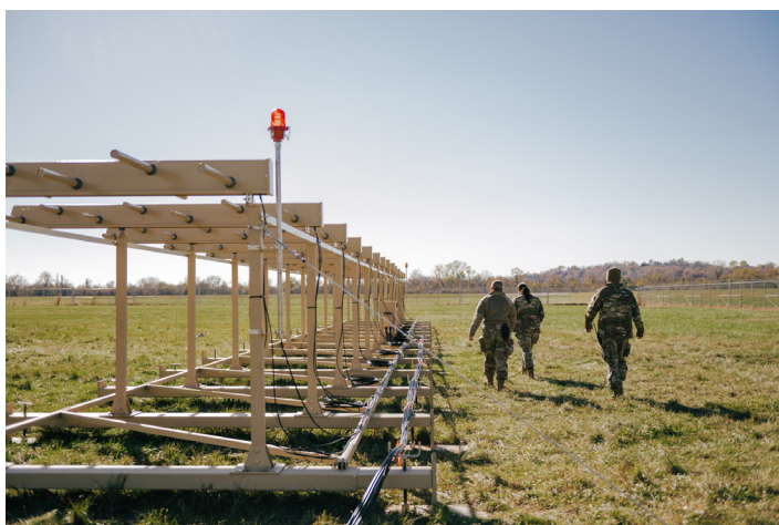
The 241st set up and maintain the newly-constructed TRN-50 Deployable Instrument Landing System (D-ILS) at Rosecrans Nov. 7, 2024.

The 241 ATCS tackled numerous challenges in 2024. From safeguarding Missouri citizens operating in the National Aerospace System, multiple MAJCOM inspections, equipment replacement, enabling the operational testing and evaluation (OT&E) and modernization of a new deployable air traffic control approach landing systems (DATCALs) equipment, and multiple exercises, the unit's tenacity to persevere is always on display.