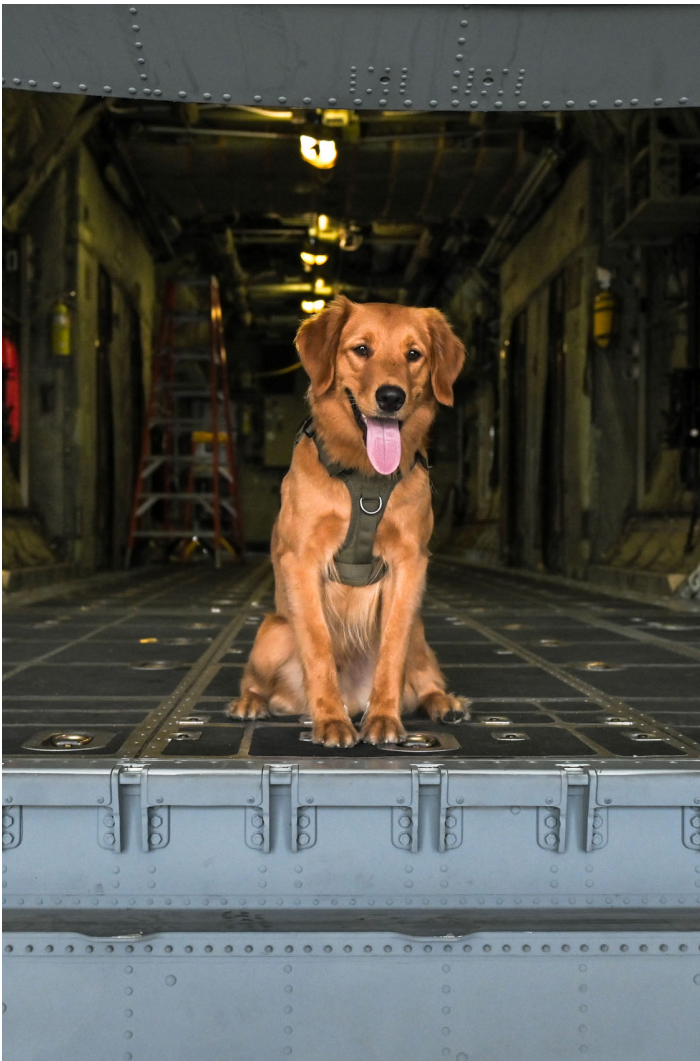
Koda, the 139th Airlift Wing's support dog, sits in the back of a C-130 Hercules aircraft at Rosecrans on Aug 20, 2024. Koda has boosted Airmen morale and served with the 139th for a year.

The Resiliency Team strategic goals for FY24 were to focus on mission readiness through the four pillars of Comprehensive Airman Fitness: aid in the reduction of emotional battles, promote NGB policies related to resiliency, promote self-empowering personal morals & values, and build resilient Airman by asking the question regularly, "How can I help?" The team continued to work hard at addressing these goals through our monthly Resiliency Center Newsletter "Piece of the Puzzle", through online virtual workshops and discussion groups. We shared articles that focus on the four pillars of CAF, including events