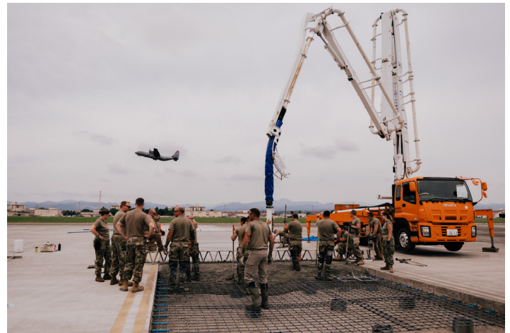
CE Airmen lay concrete at Yokota Air Base, Japan on June 10, 2024. The project extended the ramp to accommodate 10 C-130J Hercules aircraft.

Throughout the DFT, our Emergency Management (EM) section professionally showcased our capabilities, not only with tenant 374th CES/CEX and duration staff from Minnesota's 133rd CES/CEX personnel but also with the Japan Ground Self Defense Force – Nuclear, Biological, and Chemical First Division. The EM team achieved a significant training milestone, completing 84 PTP tasks, delivered CBRN Defense Training, and conducted a thorough CBRN Defense Plan Review. The 139th Fire Emergency Services (FES) completed a range of training exercises, including structural live fire drills, high-rise rope rescue operations, active shooter hostile environment response (ASHER), advanced vehicle extrication, and confined space rescue techniques. The team also had the opportunity to integrate with the tenant 374th CES/FES, further