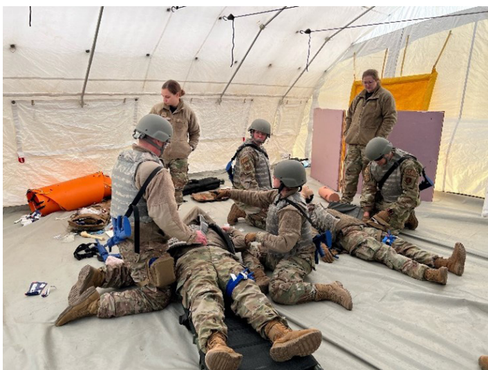
Airmen conduct Tactical Combat Casualty Care.

The 139th MDG Det 1 accomplished their fourth TCCC Tier 3 course over the November super RSD with 22 members from the Missouri, Kansas, and Nebraska ANG. This was the first time the detachment has hosted outside units for the course. The goal of TCCC Tier 3 is to prepare Medics for trauma life support in prehospital combat medicine environment, designed to reduce preventable deaths while maintaining operation success.