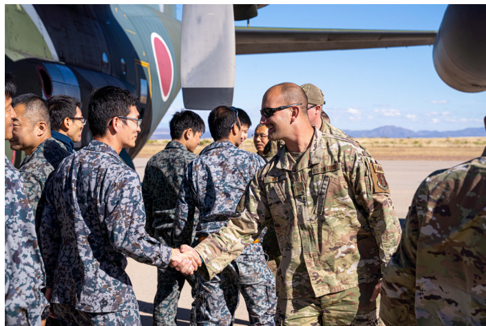
Aircrew from the Japan Air Self-Defense Force attend the Advanced Tactics Aircrew Course in Fort Huachuca, Arizona, Nov. 10, 2022.

In conclusion, the AATTC had begun a significant strategic shift in the year of 2022. With the release of the National Security Strategy and National Defense Strategy 2022, the AATTC is making guidance in those strategic documents to maintain tactical relevance. Our training division is shifting all of our courses emphasizing on components of ACE, Multi Capable Airmen (MCA), INDOPACOM Scenarios,