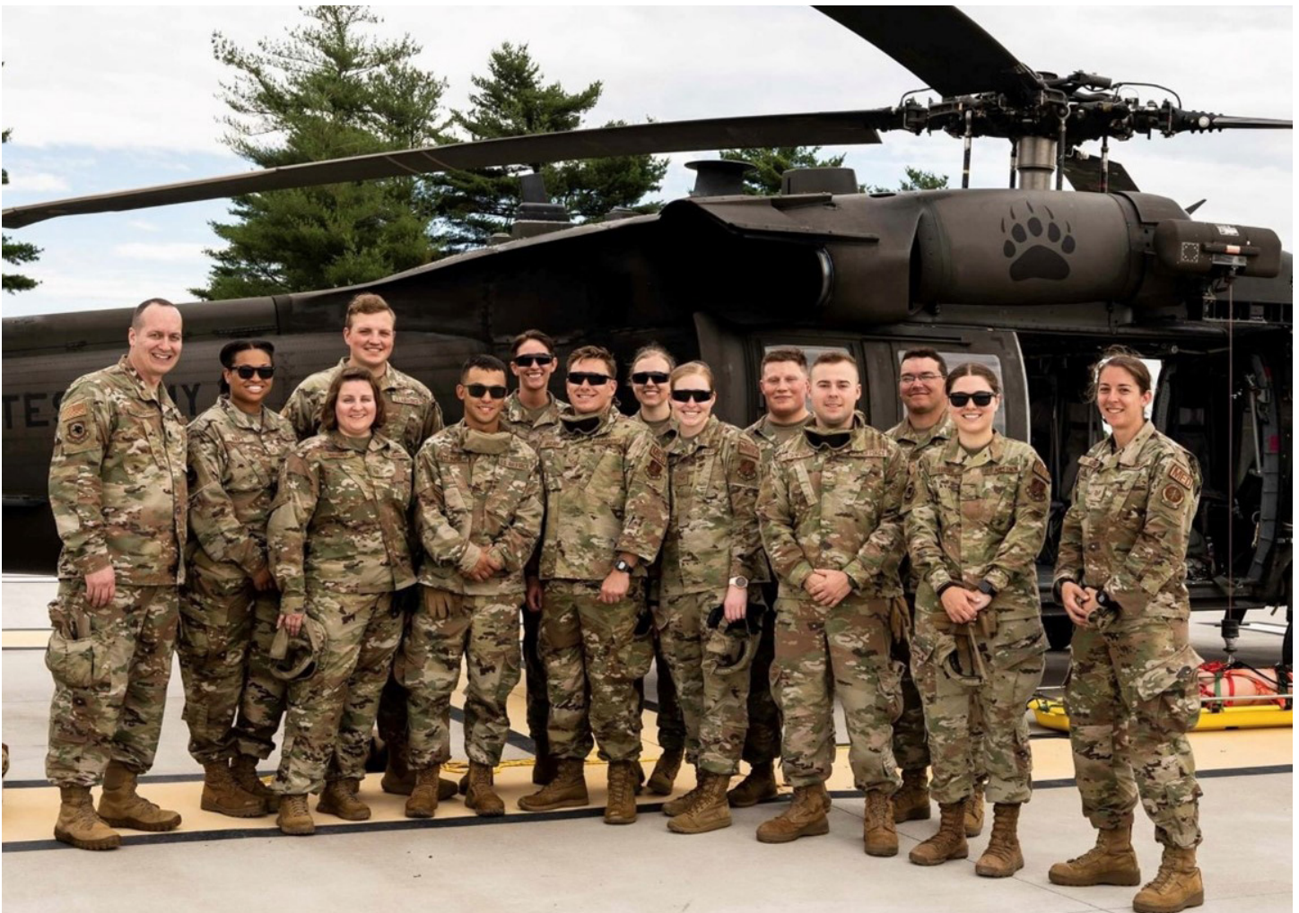
Airmen from the 139th Medical Group Detachment 1 pose for a photo in front of a UH-60 Black Hawk. The Airmen taught Soliders from the MO NG how to prepare patients for airlift.