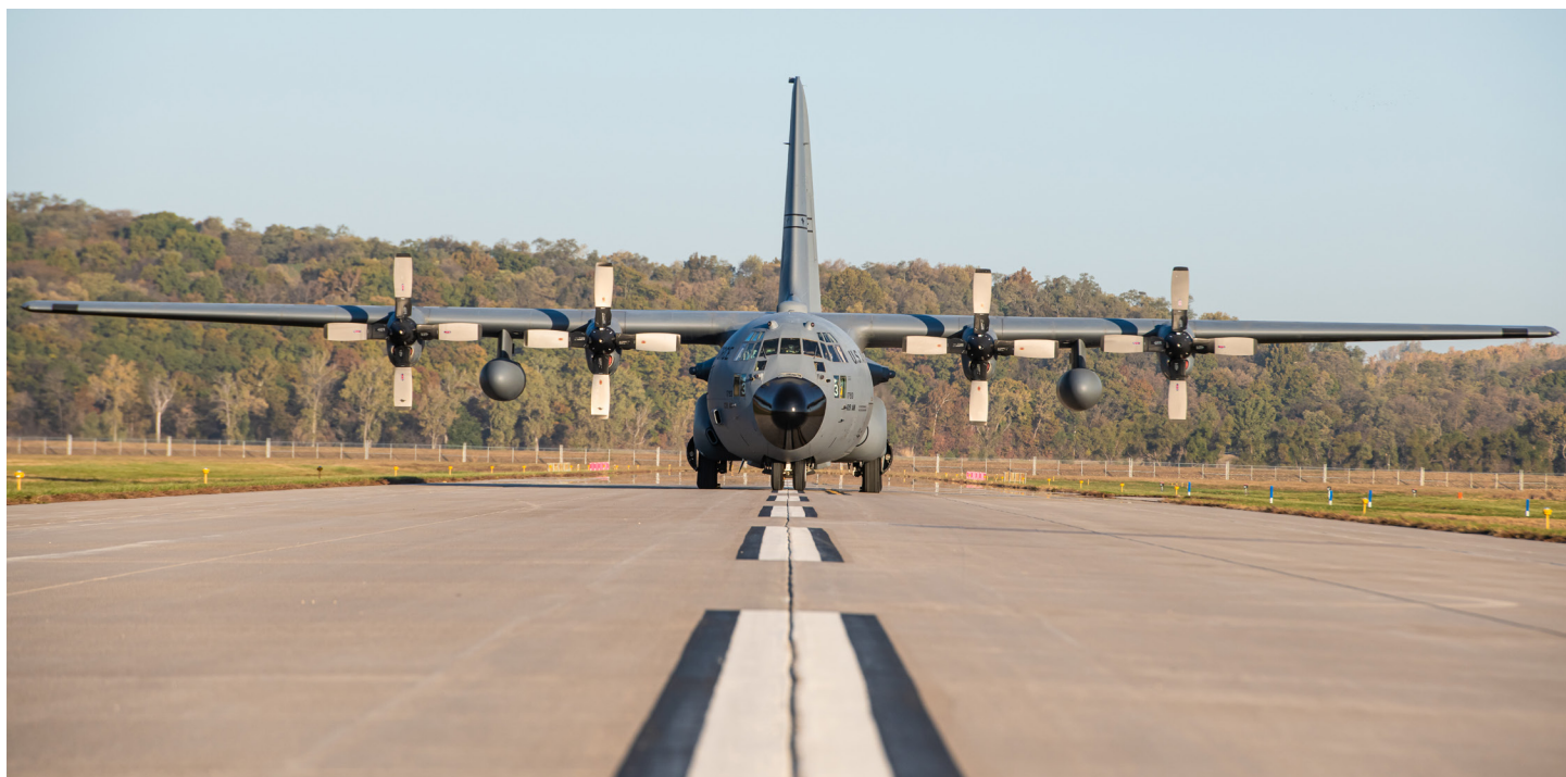
A C-130H Hercules aircraft assigned to the 139th Airlift Wing, Missouri Air National Guard, sits on a runway at Rosecrans Air National Guard Base, St. Joseph, Missouri, Oct. 20, 2022.