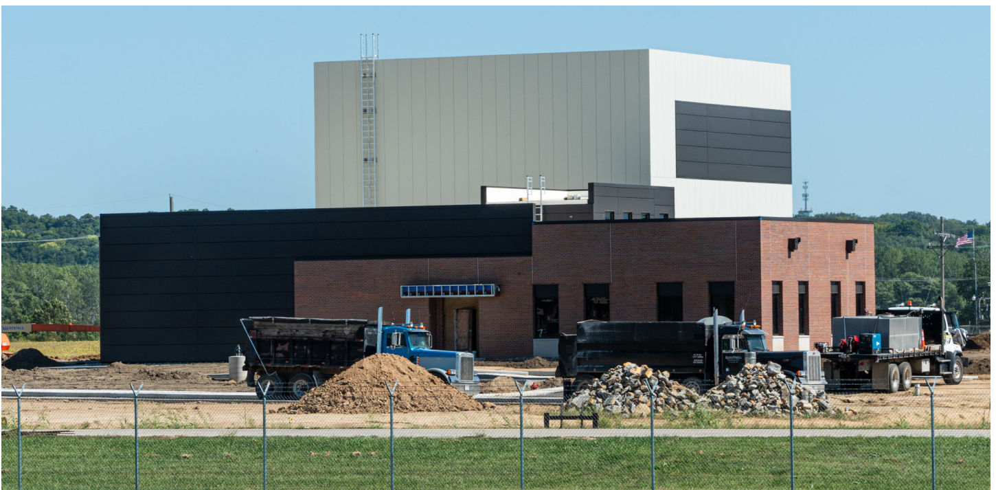
Construction of a C-130 aircraft simulator facility continues at Rosecrans Air National Guard Base, St. Joseph, Missouri, Sept. 20, 2022. Once complete, the facility will house a C-130H aircraft simulator.

* Education benefits are based on enlisted personnel pursuing undergraduate education. The total four year process for a bachelor's degree was then broke down annually and based on 60% of the total enlisted personnel utilizing their benefits.