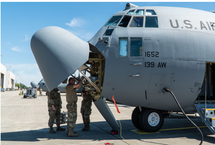
Airmen assigned to the 139th Maintenance Group work under the radome of a C-130 Hercules aircraft at Ramstein Air Base.

The 139th Munitions Flight proudly represented the Wing this year as it answered the call on short notice to provide two aircraft with full mobility standard configuration loads in support of the Iron Herc deployment. They oversaw 5,478 transactions using Theater Integrated Combat Munitions system, stockpiled $1.7 million in assets for transfer and organized chaff and flare training for the 180th Operations Squadron to demonstrate munitions capabilities for the AMC commander. The Munitions section also collaborated with multiple other sections to provide a critical time change item to a depot aircraft to prevent the aircraft from being grounded. The 139th is thankful for strong support from the St. Joseph Area. The unit hosted two career fairs for local high school students, showcasing potential job opportunities and benefits of joining the unit, providing static displays and demonstrations of the unit's capabilities, including an event hosted by the wing at the downtown Civic Center. These visitors, as well as visitors from the local technical school were guided by wing members to different areas of the base to enhance the wing's community support and to assist in recruiting and retention. The unit furnished an aircraft for orientation flights for high schoolers and JROTC units, also providing four days of orientation flights for the Civil Air Patrol in Columbia, MO.