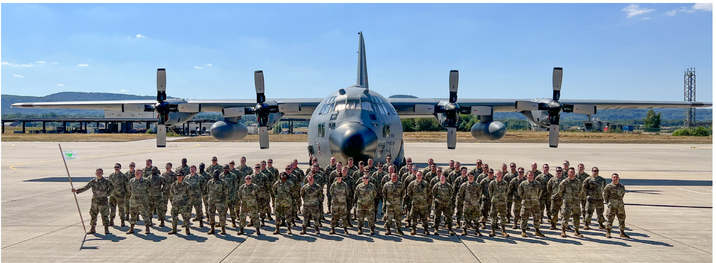
The 139th Maintenance Group deployed to Ramstein Air Base for Task Force Iron Herk.

In January, the 139th generated an aircraft to transport the 241st Air Traffic Control unit to Honolulu, Hawaii for their Annual Training. Additional maintainers were tasked with forming a Maintenance Response Team on short notice to perform emergency repairs and returning that aircraft to fully mission capable.