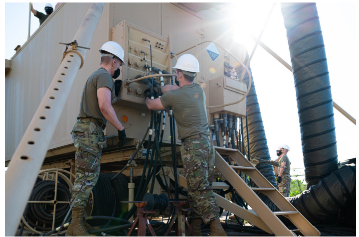
241st Airmen work on a MPN-14K Mobile Ground Approach System in Kapolei, Hawaii.

In July, building 100 site suffered electrical surges damaging computers, phones, and the mobile radar due to a thunderstorm passing through the area. Maintenance personnel worked vigorously replacing indicators, ASR transmitters and receivers, and the communications system bringing the equipment back