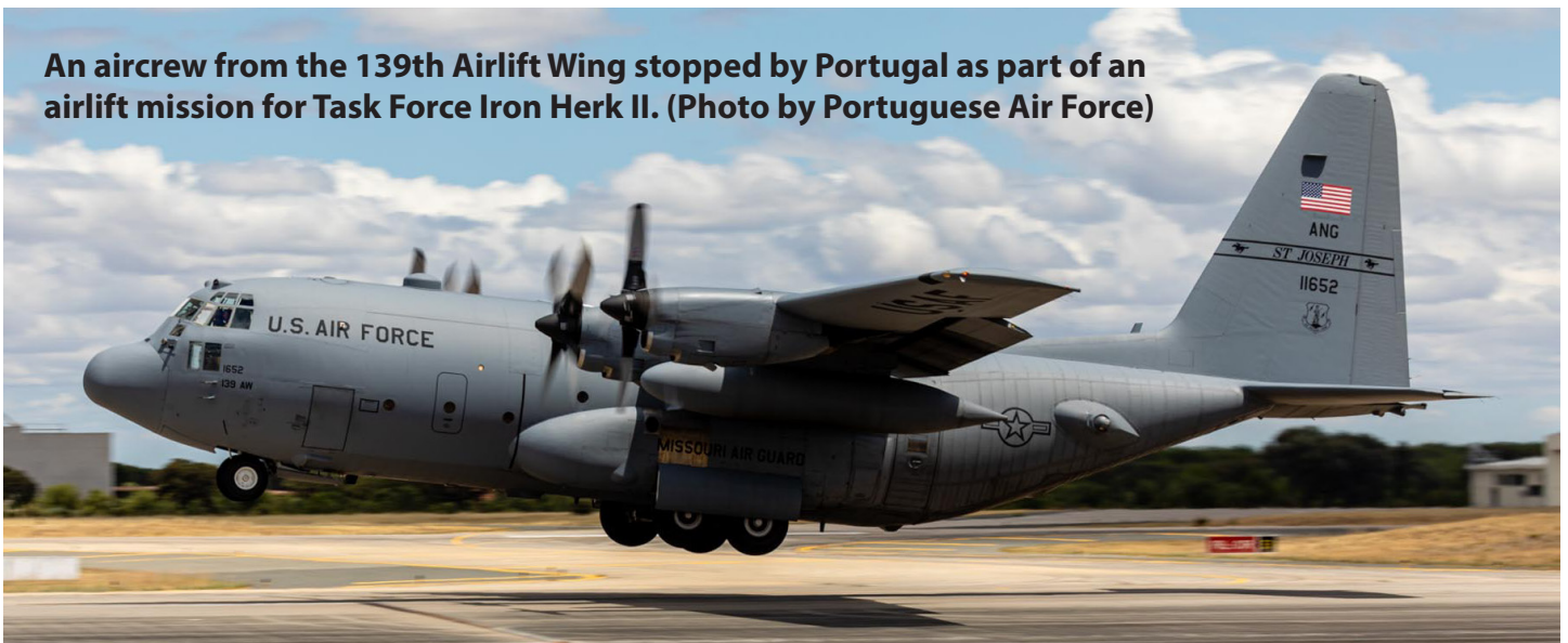
An aircrew from the 139th Airlift Wing stopped by Portugal as part of an airlift mission for Task Force Iron Herk II.