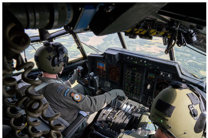
Members of the Royal New Zealand Air Force’s No. 40 Squadron, conduct a sortie over St. Joseph, Missouri, while attending the Advanced Tactics Aircrew Course at the Advanced Airlift Tactics Training Center, Sept. 21, 2022.