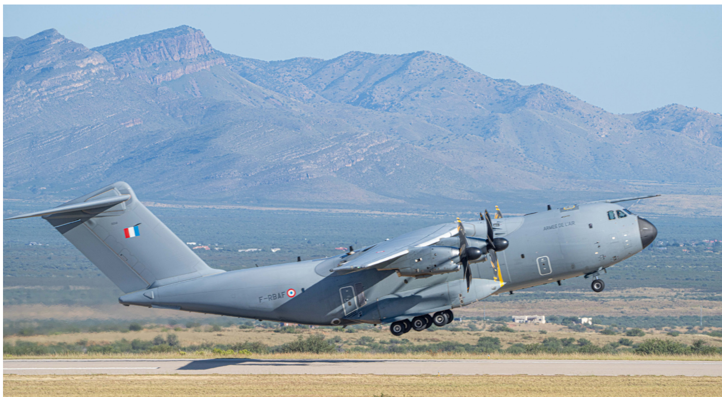
A French Air Force A400M Atlas aircraft takes-off at Fort Huachuca, Arizona, while attending the Advanced Tactics Aircrew Course at the Advanced Airlift Tactics Training Center, Sept. 27, 2022.

and potential Peer-to-Peer conflict with China. The Development Division and AMC Det 5 are working hard on technologies to aid in training MAF Aircrew to successfully operate in the first island chain of INDOPACOM. The C-130H WIC is also posturing its syllabus to all things ACE. The Mission of the AATTC is to “Increase the warfighting effectiveness and survivability of Mobility Forces.” In 2022, the AATTC epitomized that mission.