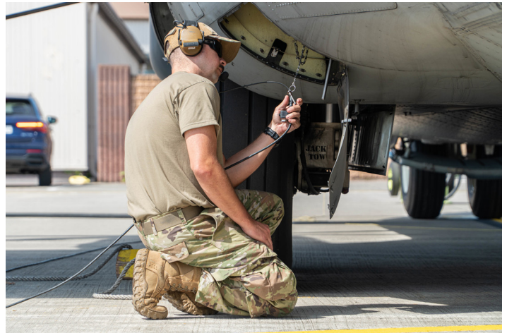
A 139th Airman performs a preflight check on a C-130 Hercules aircraft at Ramstein Air Base, Germany, June 28, 2022. The 139th Airlift Wing was the lead unit for Task Force Iron Herk II.

Despite having a large number of personnel and multiple Full Mission Capable aircraft deployed to