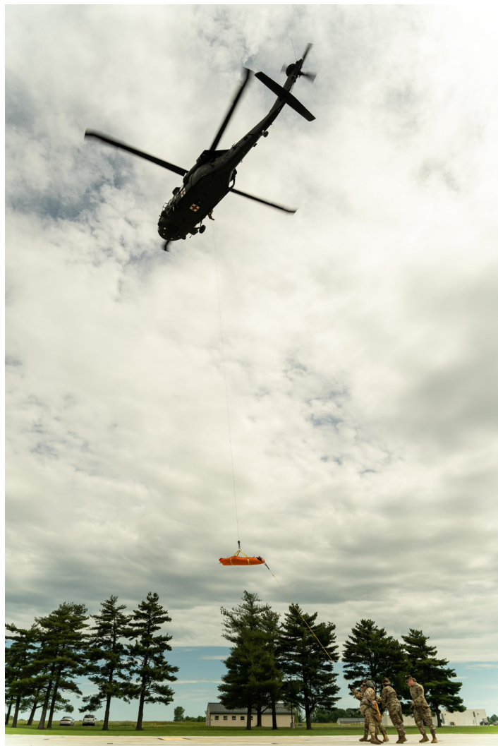
The 139th Medical Group Detachment 1 and the 735th Search and Extraction Recon Team participated in MedEvac training in Nevada, Missouri.

Two 4N0's from the 139th Medical Group Detachment 1 took part in Security Forces annual training as the range medics. During security forces weapons qualification at Fort Riley, Kansas, these medics were responsible for implementing an emergency transport