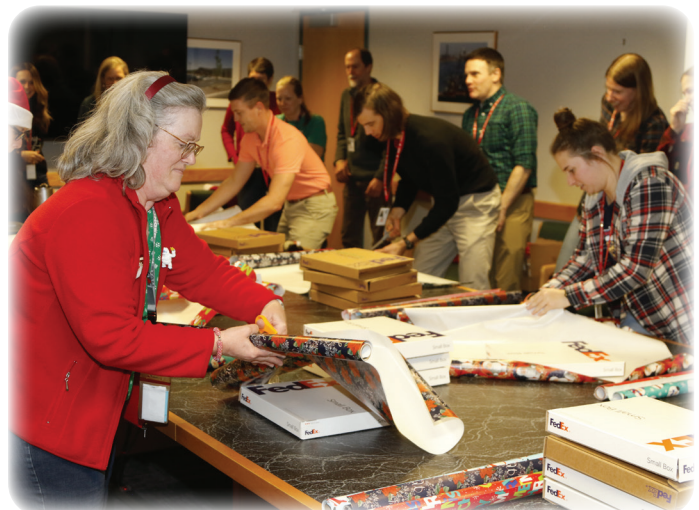
Wrapping relay contest.