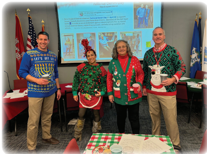
Festive sweater contestants wait for judgement.