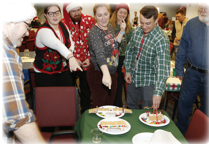
Judges select the winner of the gingerbread bridge contest.