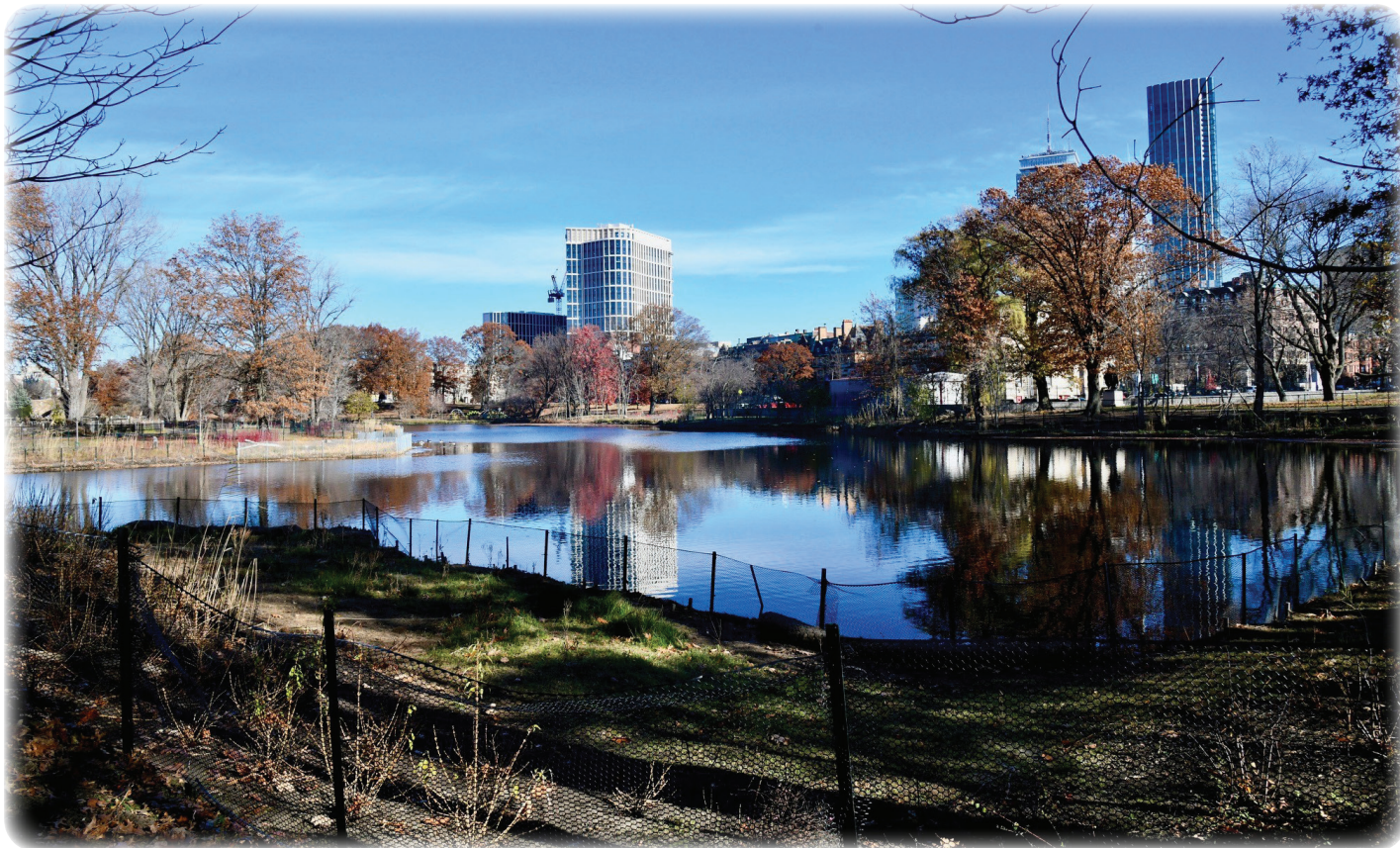
Phase II of the Muddy River Flood Risk Management Project is complete.

The District team and their partners held a ribbon cutting for the Phase I completion in April 2017.