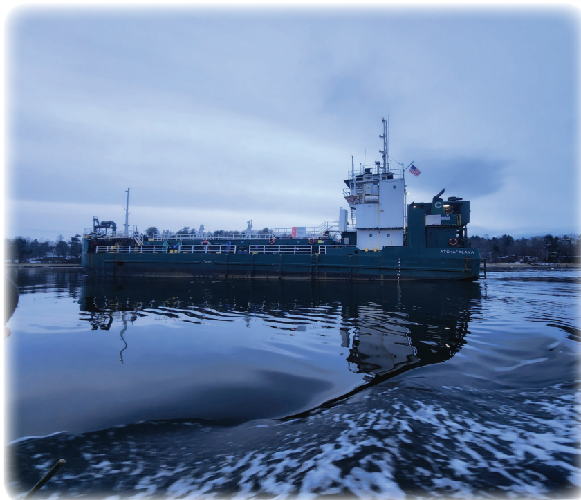
Cashman's dredge heads out to Portsmouth Harbor to work.

The work of this $1,475,530 project within the FNP included advanced maintenance dredging of two shoaled areas within the Newington Reach to achieve the specified required depths and the in-river placement of dredged material at the designated in-river dredged material placement site within the Piscataqua River.