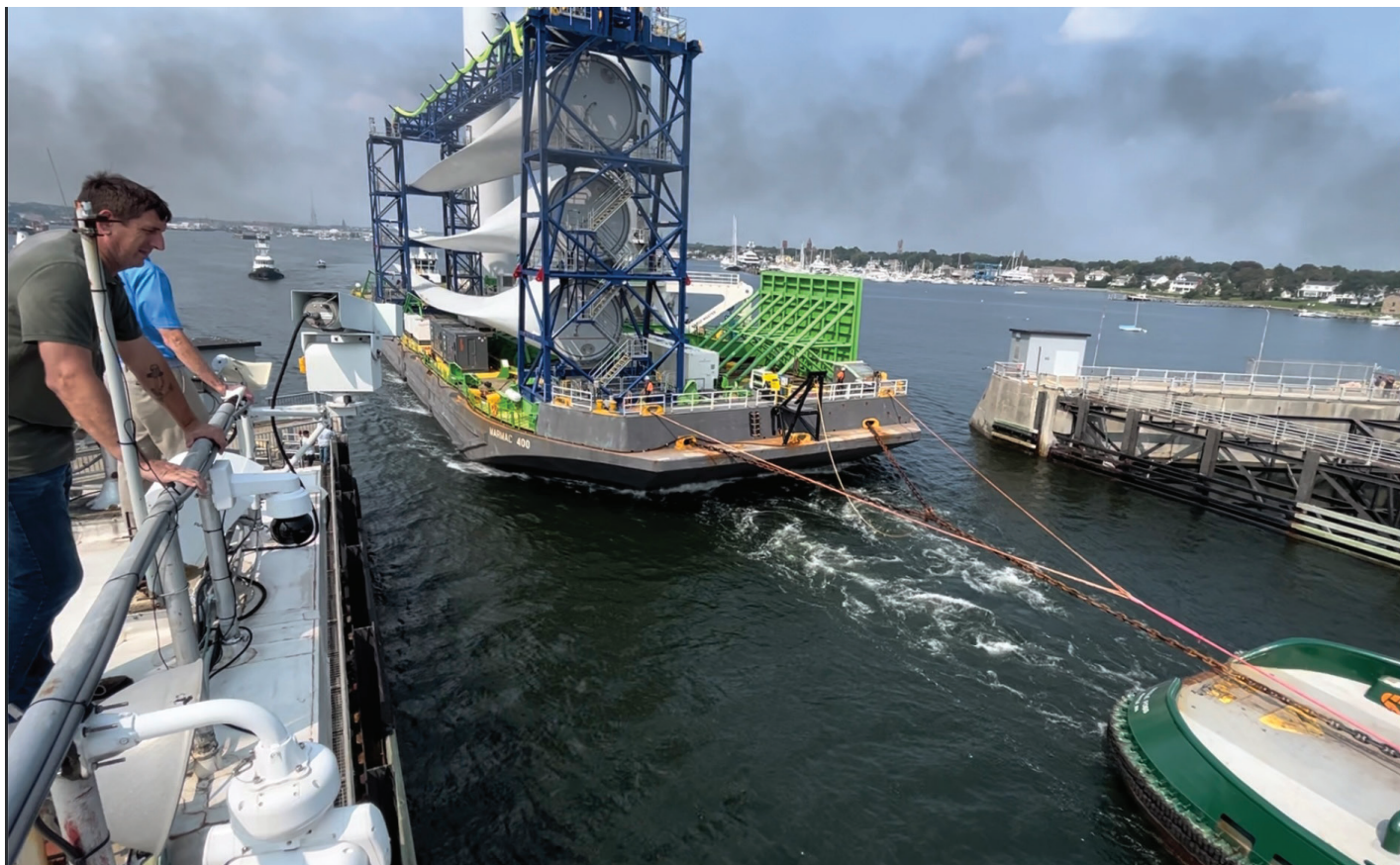
Vineyard Wind turbine parts make their way through the New Bedford Hurricane Barrier.