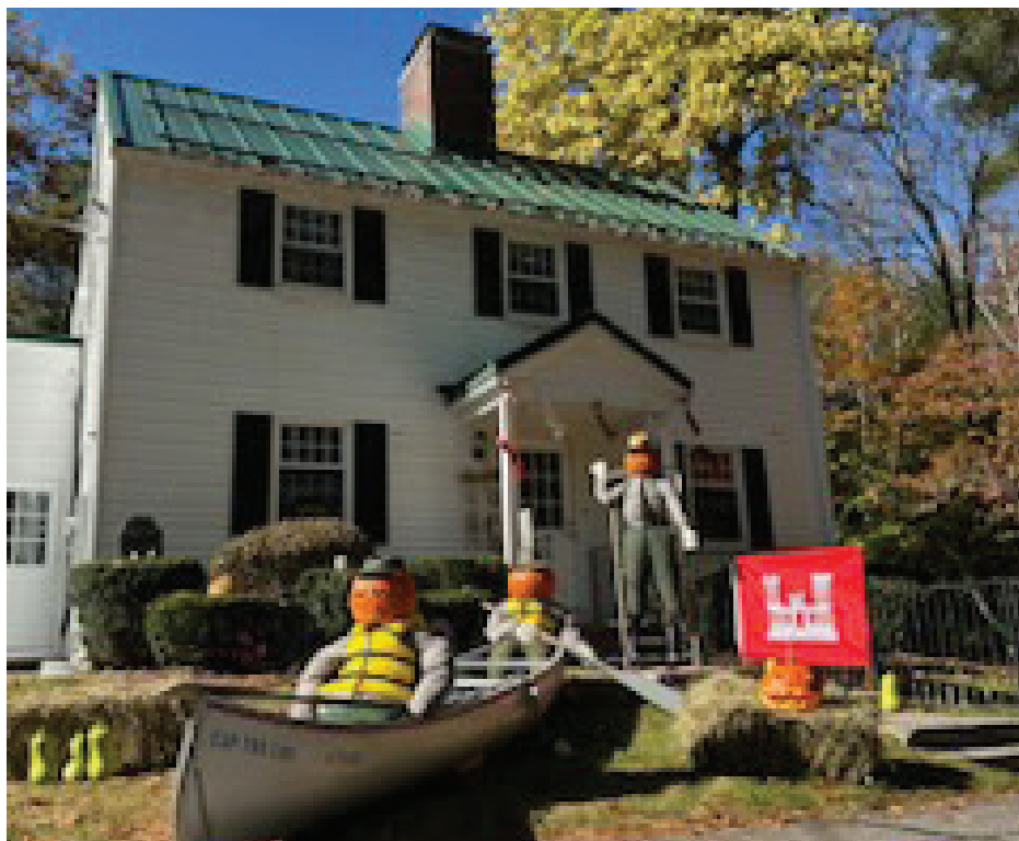
Honorable Mention - Tully Lake