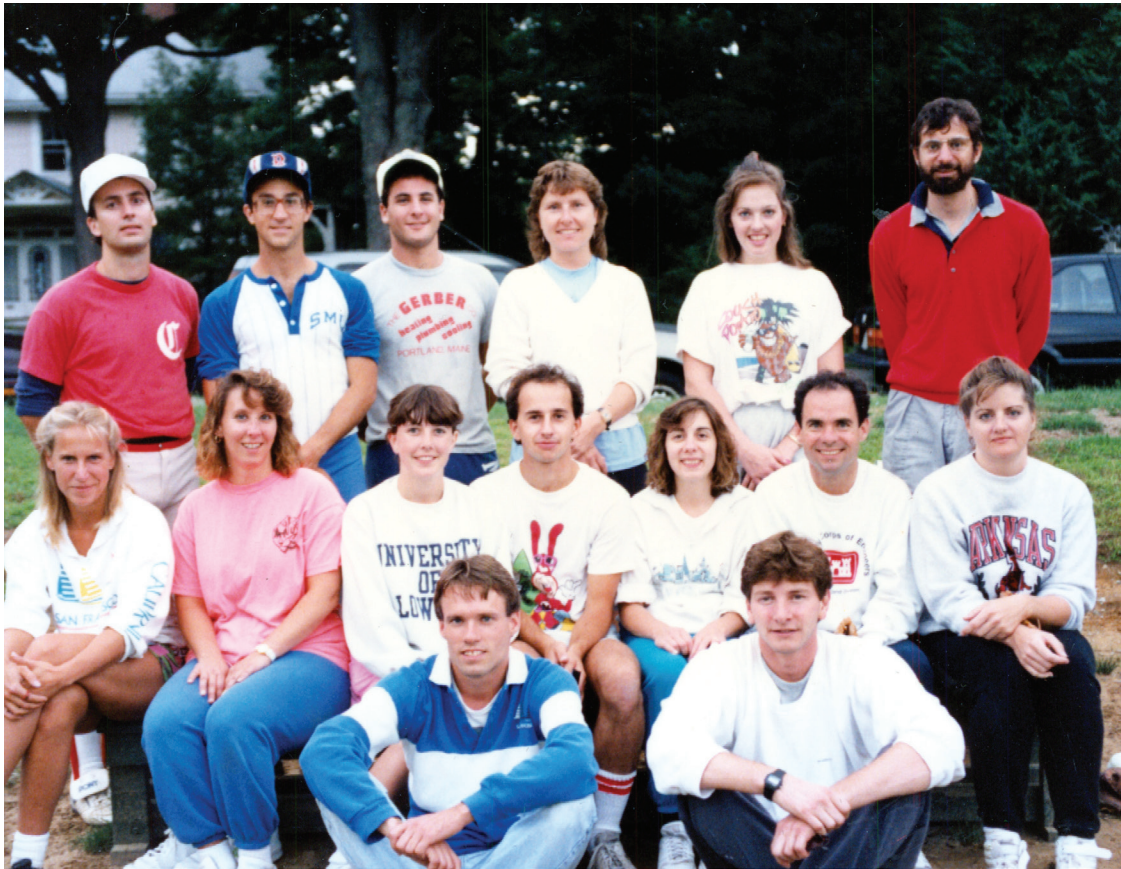
The New England District softball team circa 1990.