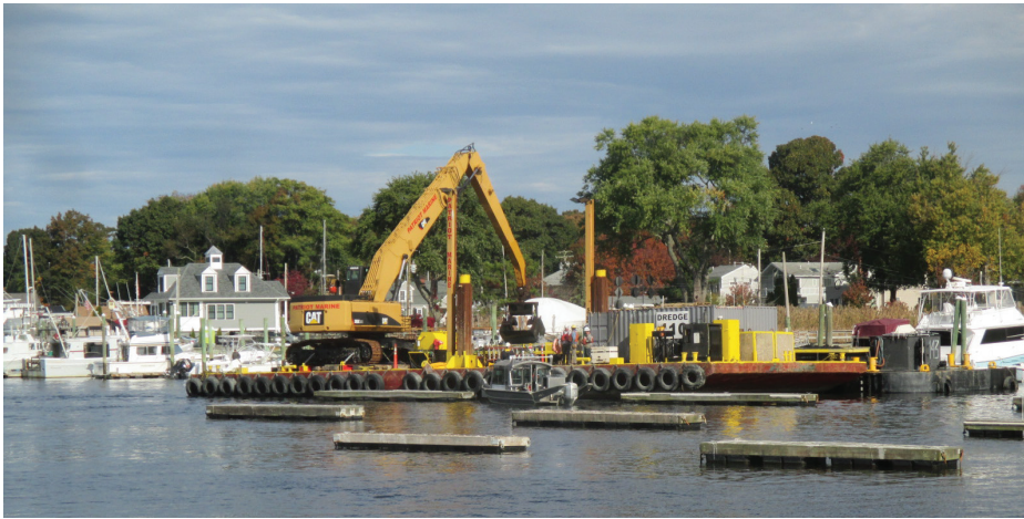
Milford Harbor Dredging and Naugatuck River Basin's new portable rest rooms.