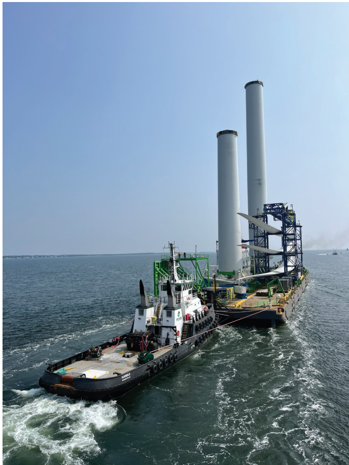
A tug pushed Vineyard Wind turbine parts to their final destination.