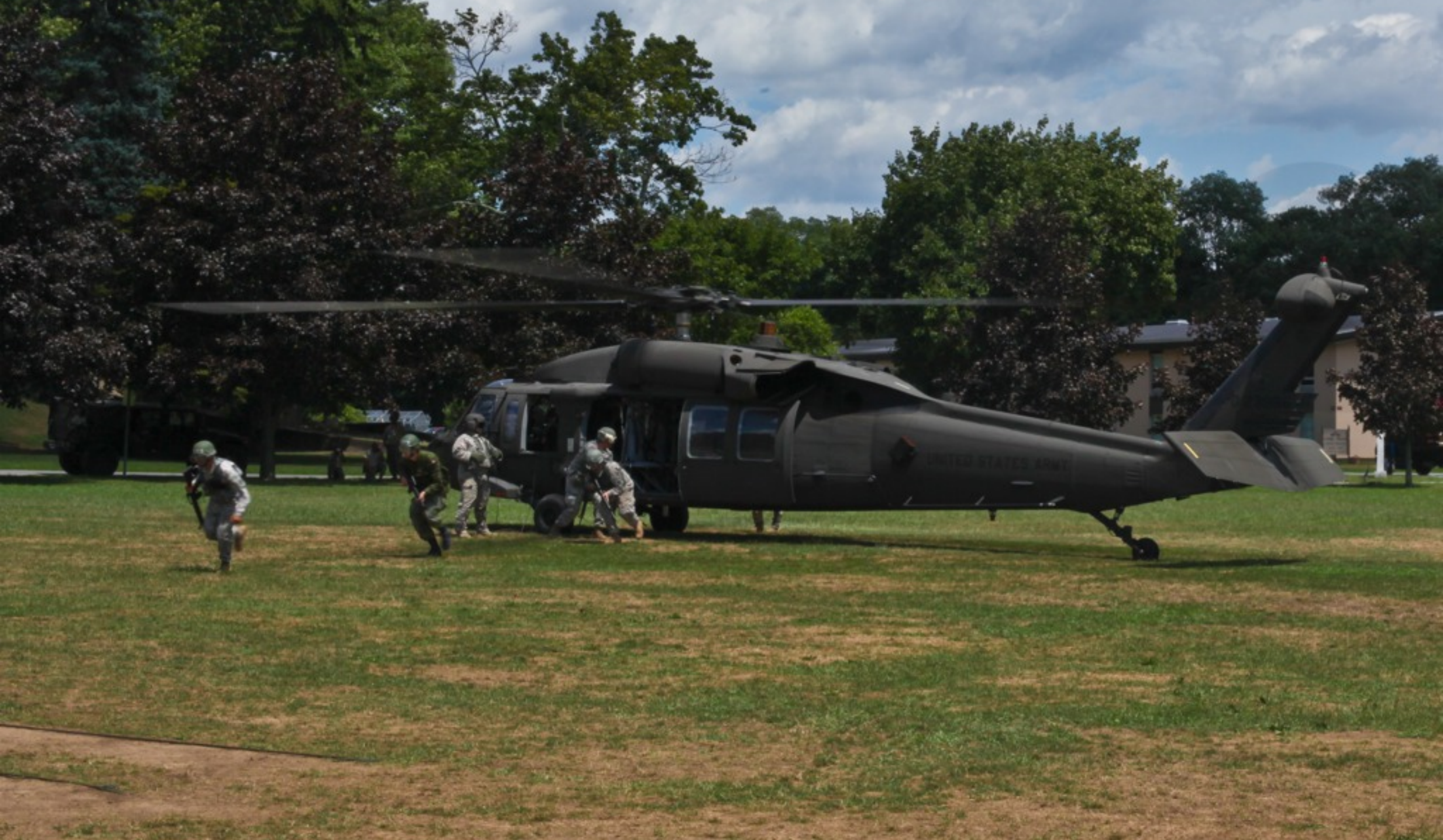
Air Assault students dismount from a UH-60 Blackhawk during training at Camp Smith, N.Y. on July 22, 2010.