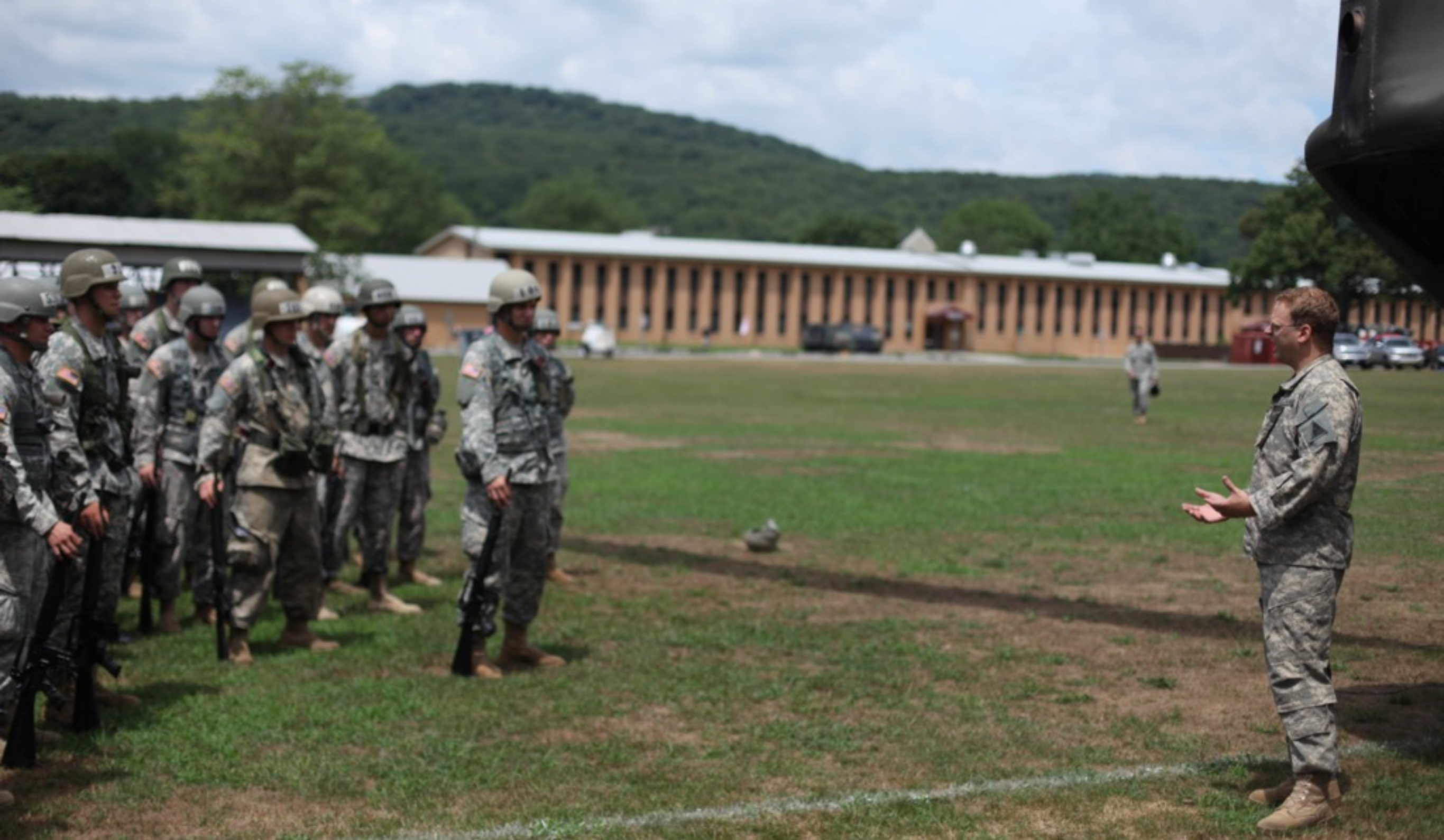
Air Assault students receive an introductory block of instruction on the CH-47 Chinook at Camp Smith, N.Y. on July 22, 2010.