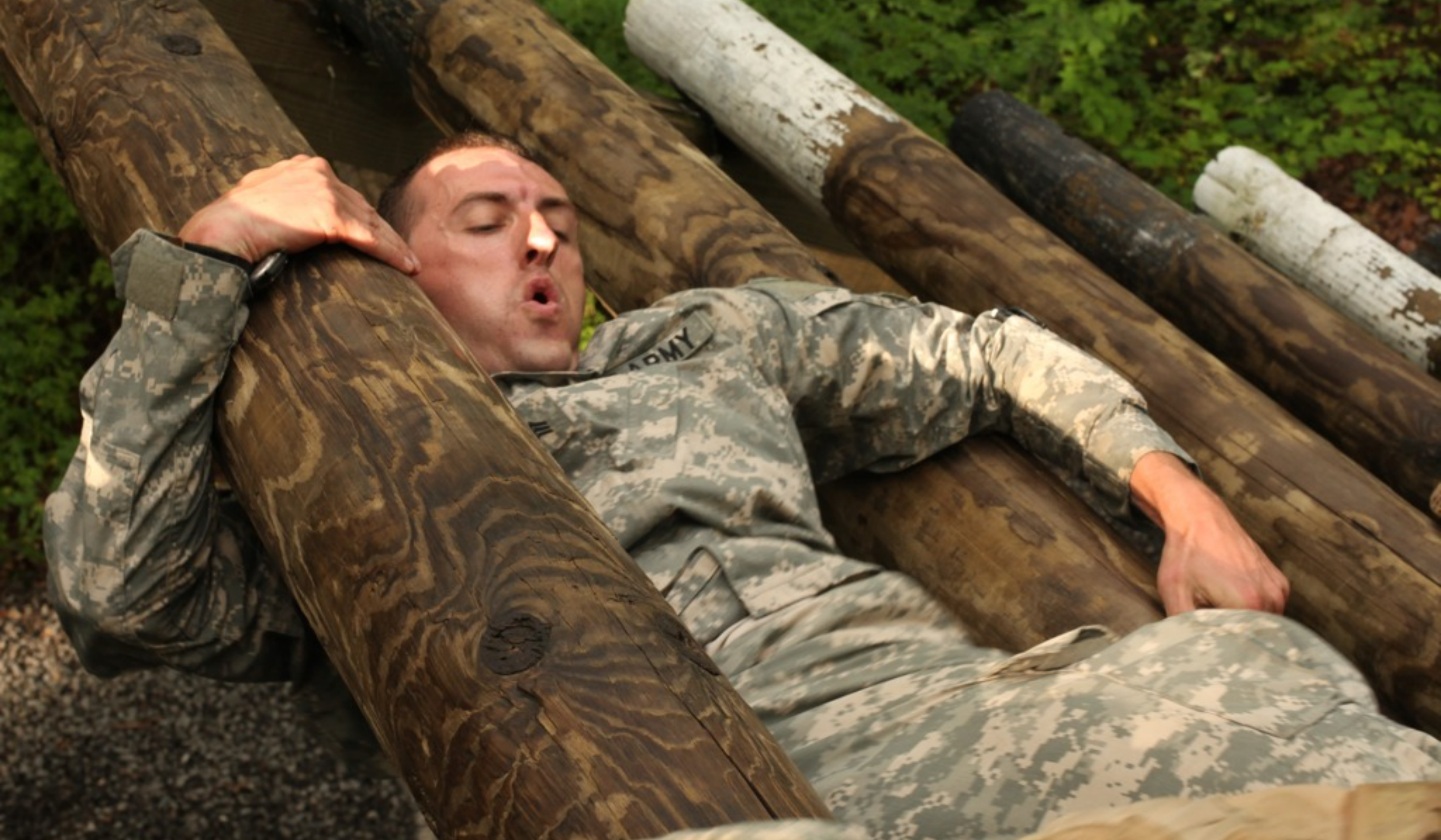
A U.S. Army Soldier negotiates the second obstacle, the Weaver, during Air Assault School at Camp Buckner, N.Y. on July 20, 2010.