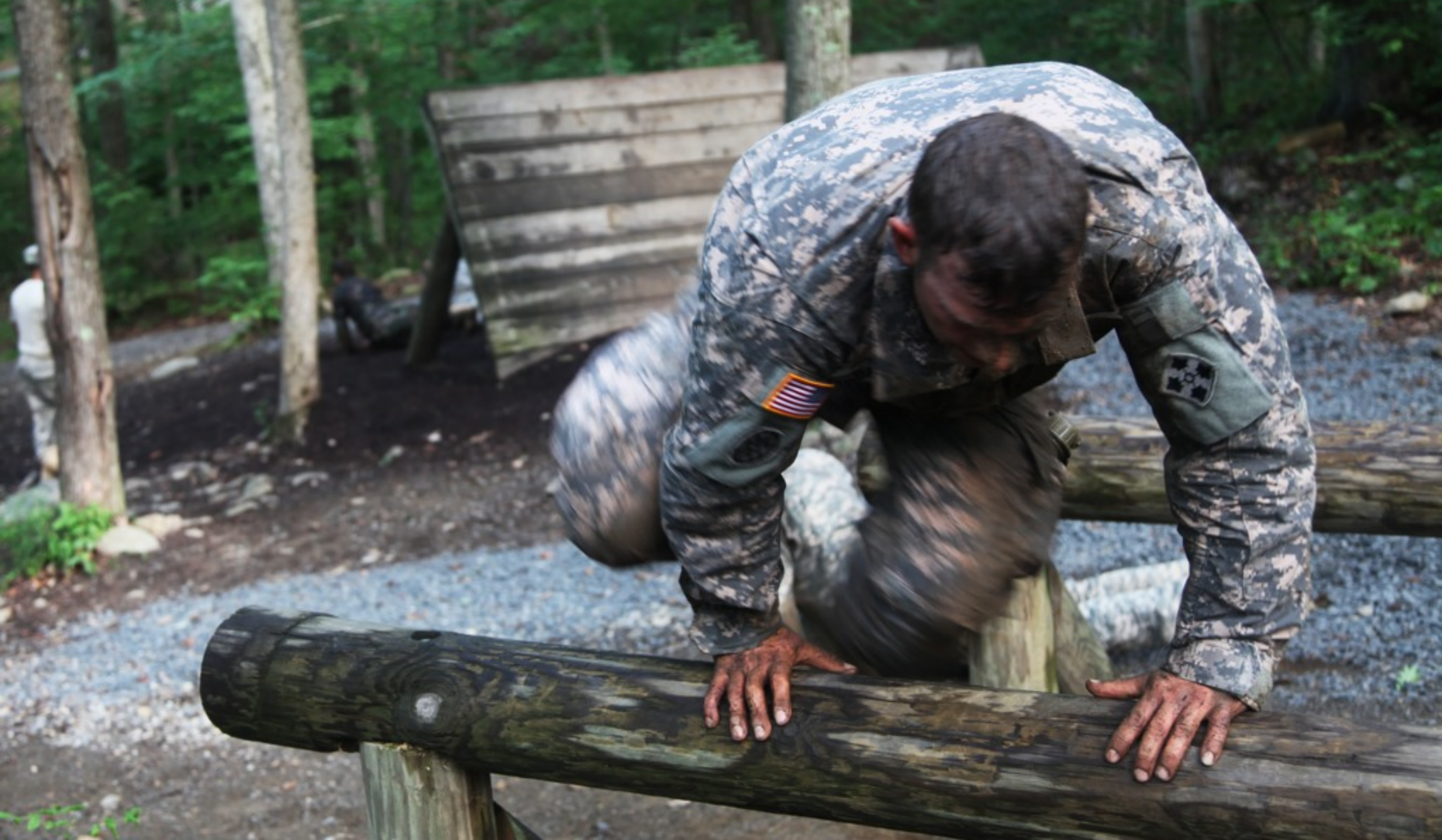
A U.S. Soldier negotiates the “Six Vault” obstacle on Zero Day of Air Assault School at Camp Buckner, N.Y. on July 20, 2010.