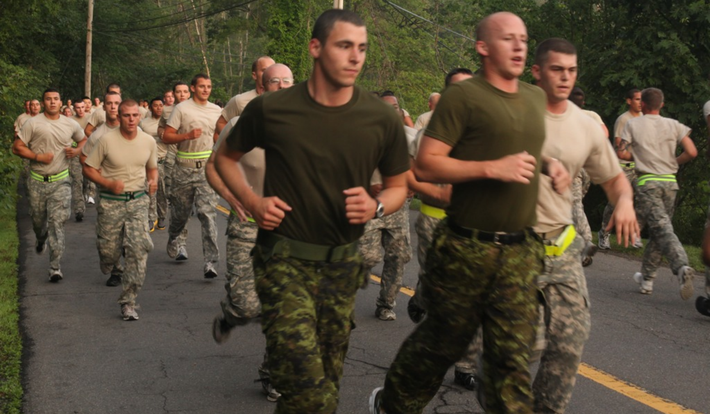
Air Assault students conduct the 2-mile run on Zero Day at Camp Buckner, N.Y. on July 20, 2010. Students from the U.S. Army and Air Force as well as Servicemembers from Allied Nations participated in Air Assault training.