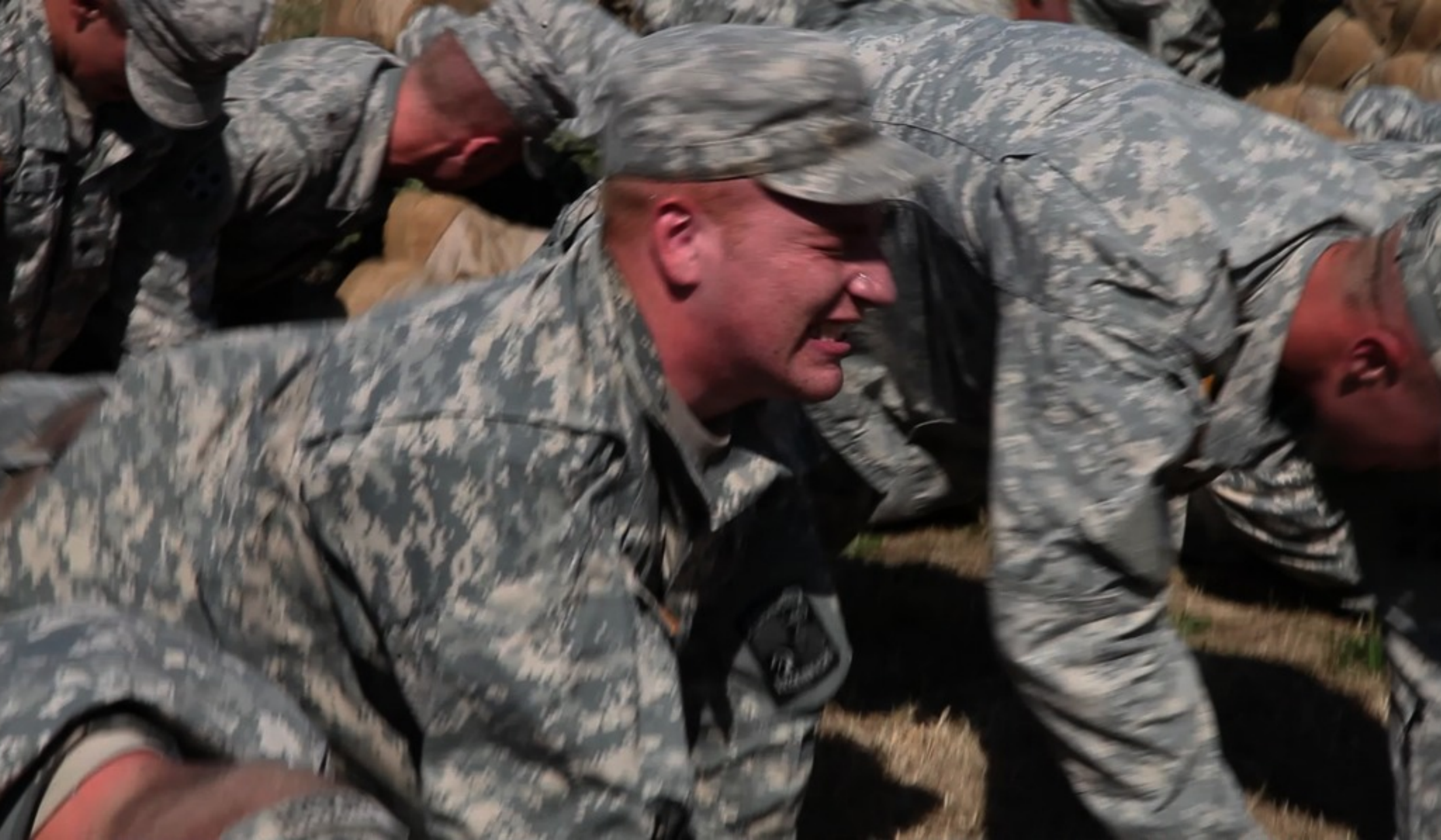
U.S. Army Soldiers perform Air Assault Push-Ups during Zero Day at Camp Smith, N.Y. on July 20, 2010.