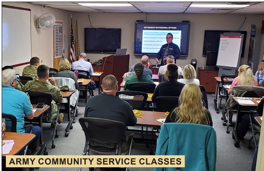
ARMY COMMUNITY SERVICE CLASSES

More detailed information about all programs offered by Army Community Service is available at mccoy.armymwr.com/us/programs/army-community-service .