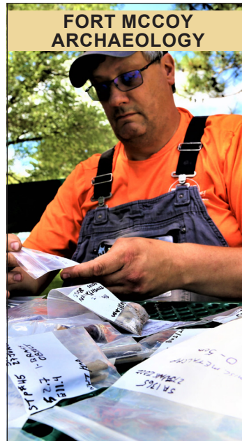
FORT MCCOY ARCHAEOLOGY

Education Center (B-50).....608-388-7311 Energy Office (B-2168).....608-388-6521 EOD (B-2954).....608-388-4848 Equal Opportunity (Military) (B-2111)..... .....608-388-6335 Equal Employment Opportunity (Civilian) (B-2187)