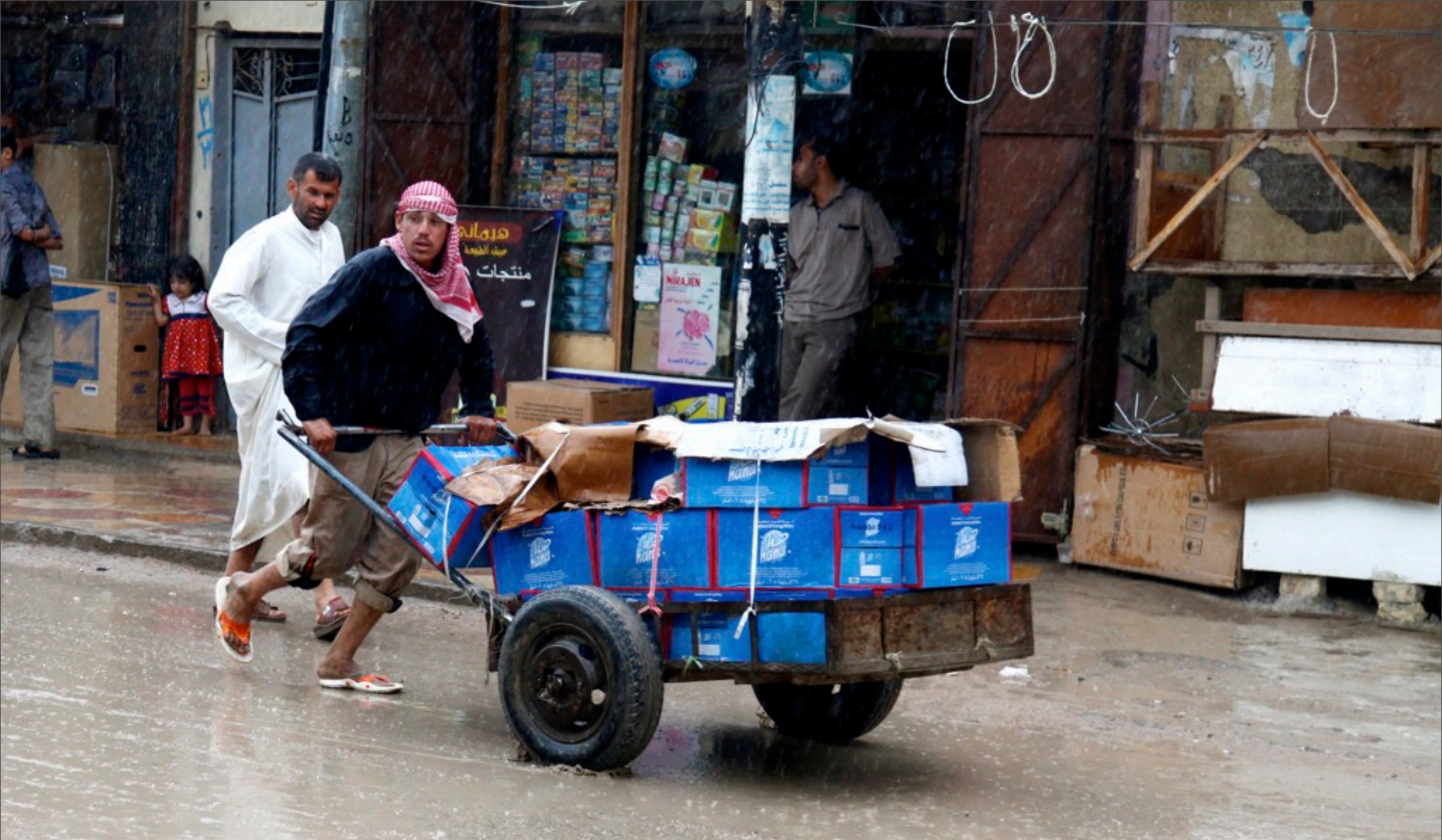
An Iraqi man runs through the rain down a muddy street in a neighborhood in Al Qurna, Iraq, May 2, 2010.