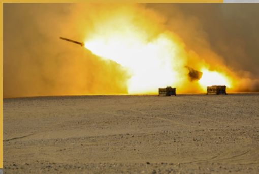
TF RAZORBACK CONDUCTS LIVE-FIRE TRAINING