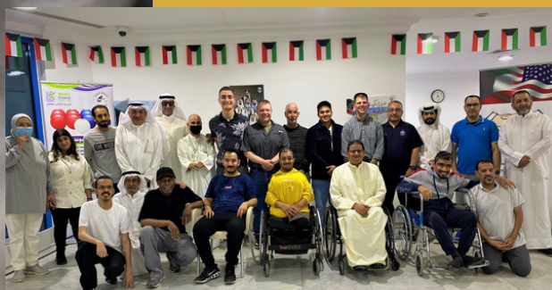
TF SPARTAN MEETS WITH WARBA DISABLED SPORTS CLUB