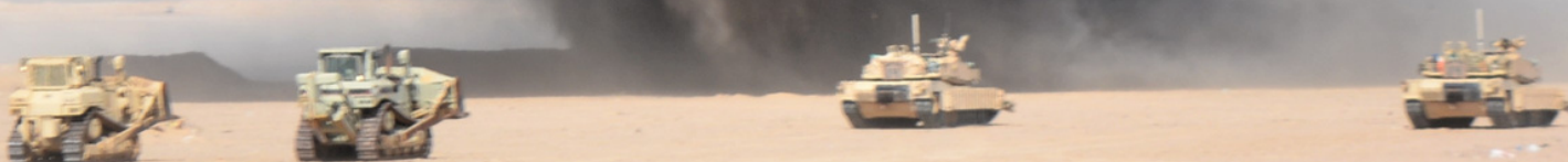
BACKGROUND PHOTO: TF SPARTAN UNITS PARTICIPATE IN OPERATION FLAMING DRAGON