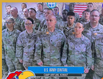
U.S. ARMY CENTRAL CAMP ARIFJAN, KUWAIT