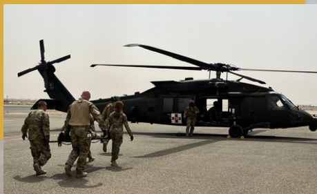
TF SPARTAN CONDUCTS MEDEVAC TRAINING