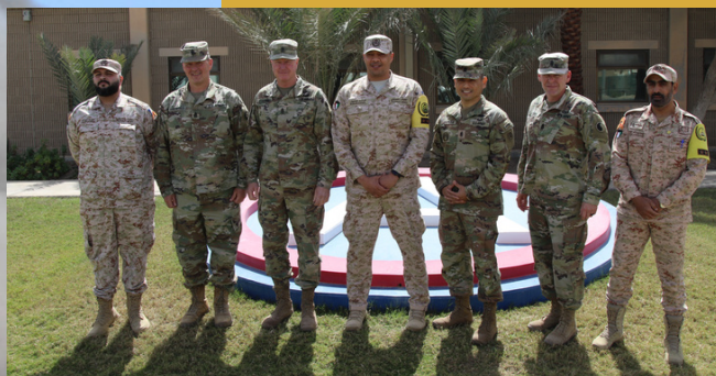
ARCENT CSM MEETS WITH 29TH/35TH ID CSM'S AND MEMBERS OF THE KLF