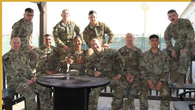
35TH INFANTRY DIVISION JAG SECTION