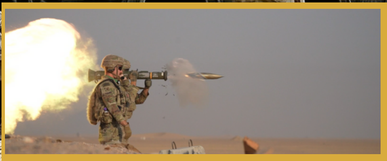
TASK FORCE GRIZ CONDUCTS LIVE-FIRE TRAINING WITH AN AT4