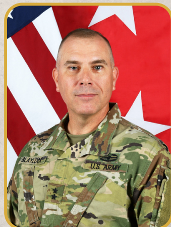
MG WILLIAM BLAYLOCK COMMANDING GENERAL

In addition, keep your mission focus and continue to work hard. I continue to be amazed and proud of everyone's hard work. However, our job is not done. We must remain vigilant and continue to look out for each other and your battle buddies as well.