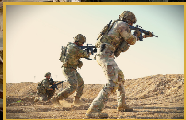
TF XYSTON CONDUCT LIVE-FIRE DISMOUNT MOVEMENTS WITH THE JORDANIAN ARMED FORCES