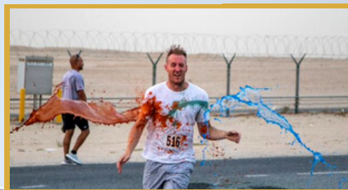
SOLDIERS PARTICIPATE IN A MWR COLOR RUN 5K ON CAMP ARIFJAN