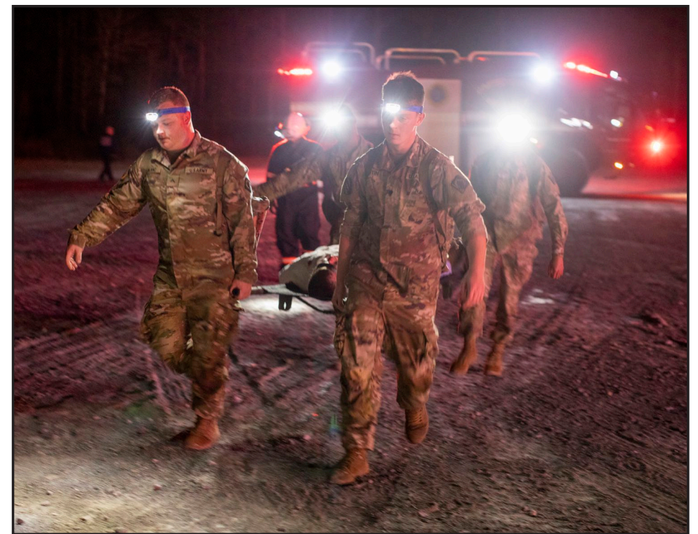
U.S. Army medics with the 1108th Aviation Group, 66th Troop Command, Mississippi National Guard and firefighters from Gulfport Combat Readiness Training Center work together during a simulated crashed aircraft response exercise at the Gulfport CRTC, Gulfport, Mississippi, Jan. 31, 2022. During the exercise, an aircraft designated for fire training was intentionally ignited and rescue personnel rehearsed responding to and extinguishing the fire, providing emergency medical treatment and evacuation.

Operation Avery has set the gold standard for the 1108th and lessons-learned this year will be incorporated into future annual training events.