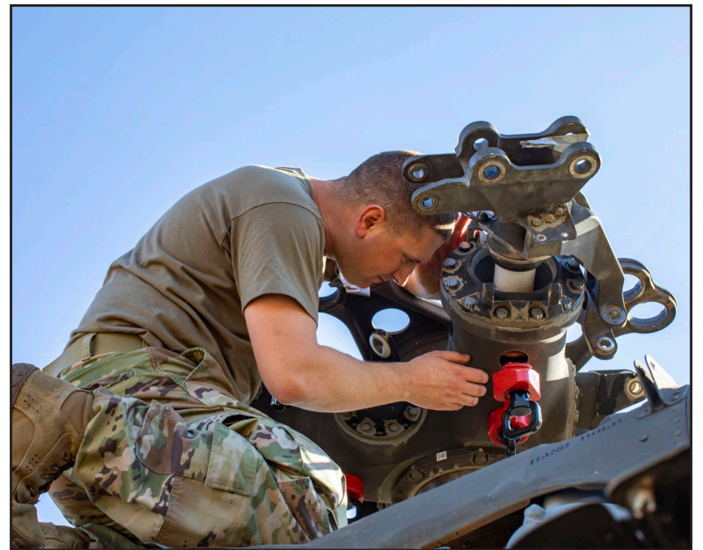
A U.S. Soldier with Company A, 1108th Aviation Group, 66th Troop Command, Mississippi National Guard, performs maintenance checks on a UH-60 Blackhawk helicopter as part of a battle damage assessment and repair at Camp Shelby Joint Force Training Center, Mississippi, Jan. 27, 2022. The Soldiers are at Camp Shelby as part of their Annual Training.