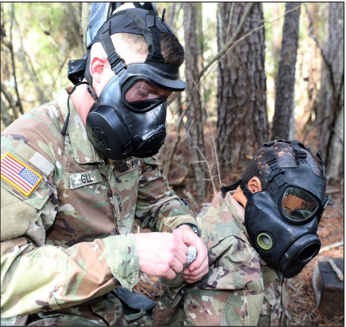
A Mississippi National Guard Soldier dons a gas mask during the Mississippi National Guard Best Warrior Competition 2022 at Camp Shelby Joint Forces Training Center, Mississippi, March 21, 2022. The BWC included the Army Combat Fitness Test, a challenging obstacle course, individual medical tasks, various warrior tasks, a written exam, a ruck march and a night land navigation course.