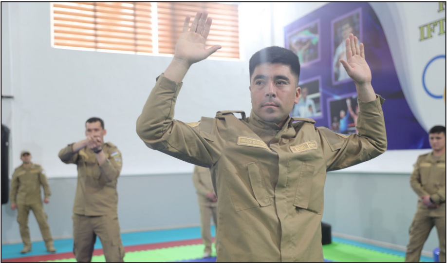
Soldiers with the National Guard of the Republic of Uzbekistan practice arresting procedures at the Protection Branch of Bektemir District, Tashkent, Uzbekistan, March 29, 2022. Service members of the Mississippi National Guard conducted a Military Police Subject Matter Expert Exchange, an exercise where military branches exchange information about how their job functions.