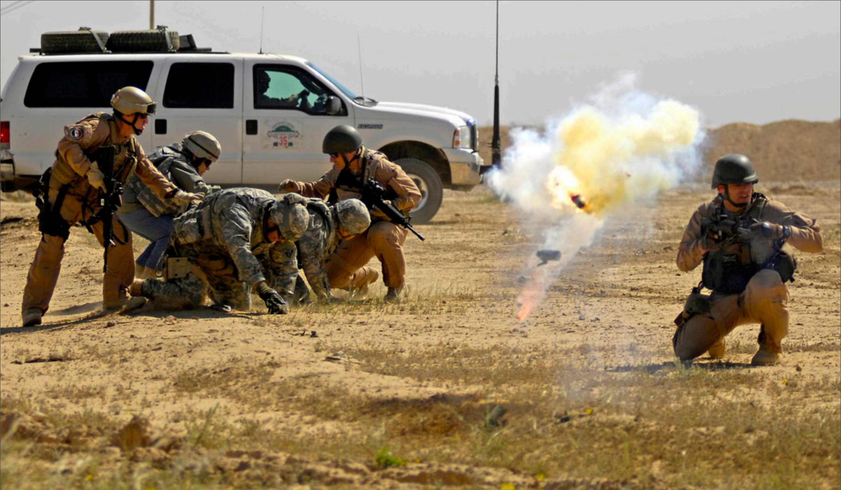
Security escort specialist of Aegis Security Corp. react and shield their U.S. Army Corp of Engineers clients during Counter Improvised Explosives Device (C-IED) training provided by Navy Sailors of Task Force Troy and EOD Mobile Unit 12, at the C-IED Range on Contingency Operating Base Speicher, Tikrit, Iraq.. March 21, 2010