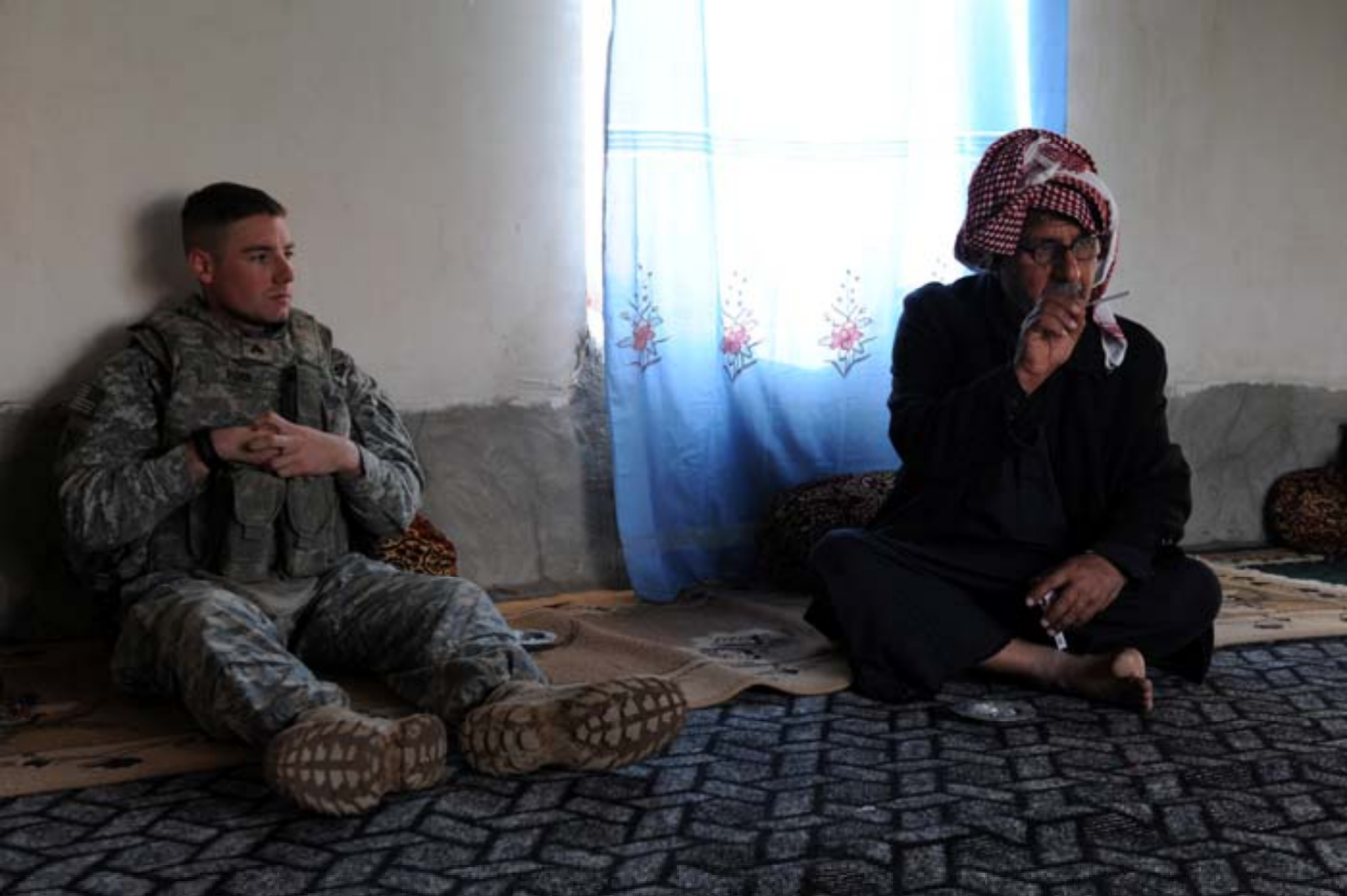
"I love you, and I mean it from my heart," a villager tells Soldiers from Headquarters and Headquarters Company, Scout Platoon, 1st Battalion, 30th Infantry, 2nd Brigade Combat Team, 3rd Infantry Division (1-30 IR), during a conversation the local citizen, who is also the father of the village mukhtar, had about the needs of his village in the province of Kirkuk, Iraq, Feb. 2, 2010. 100202-N-5330L-045