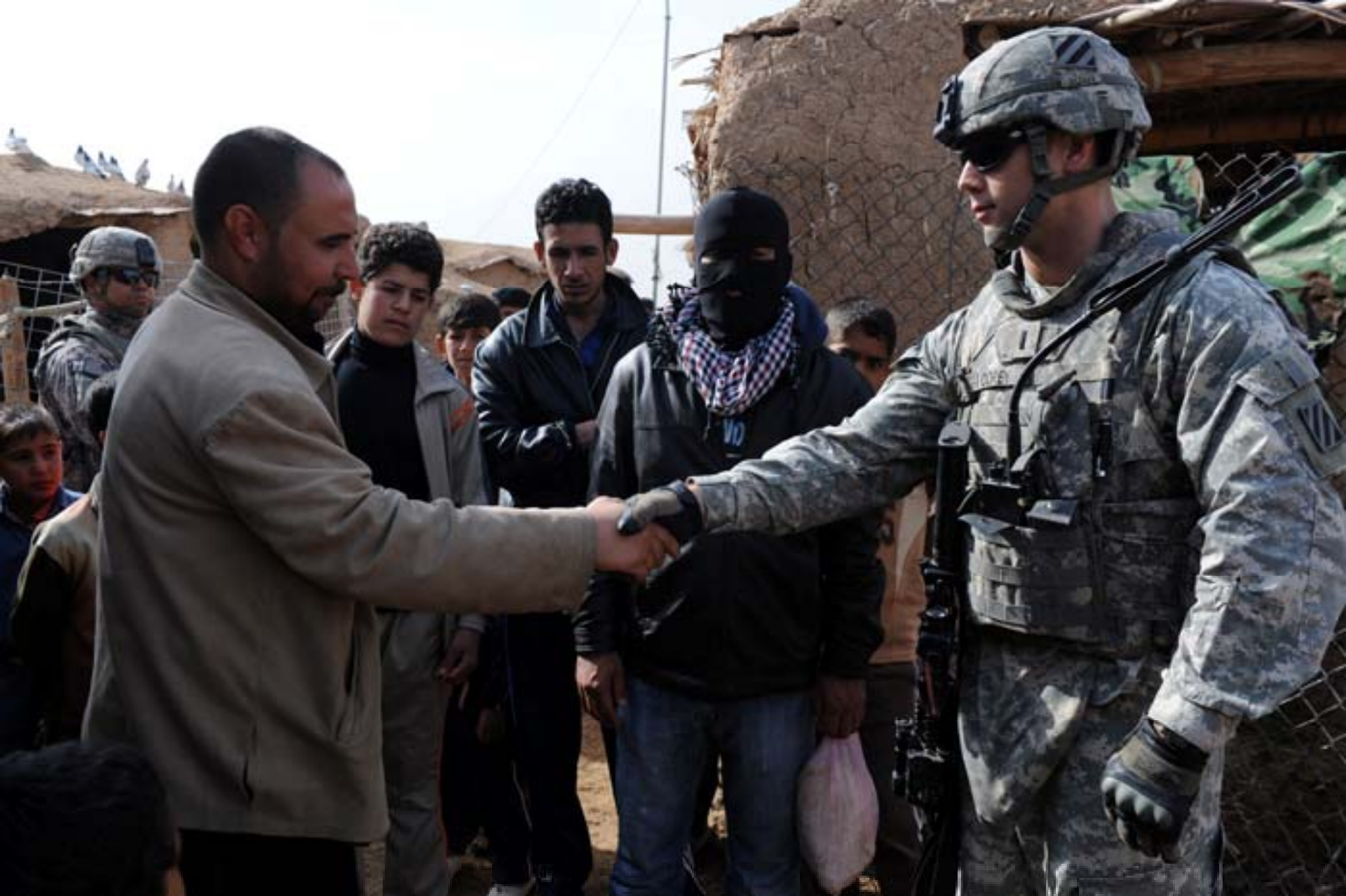
A local citizen shakes hands with a U.S. Soldier from Headquarters and Headquarters Company, Scout Platoon, 1st Battalion, 30th Infantry, 2nd Brigade Combat Team, 3rd Infantry Division (1-30 IR), during a patrol in the province of Kirkuk, Iraq, Feb. 2, 2010. The Soldier offered the citizen his condolences for a recent loss in the family the local recently suffered. 100202-N-5330L-058