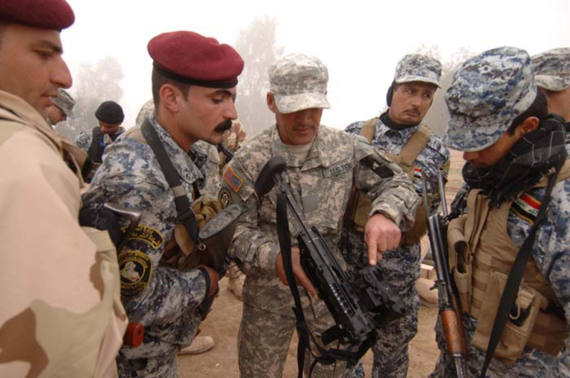
An interpreter explains the workings of an M-120 Grenade Launcher, during weapons familiarization training, on Forward Operating Base Marez, near Mosul, Iraq, Feb. 3, 2010.