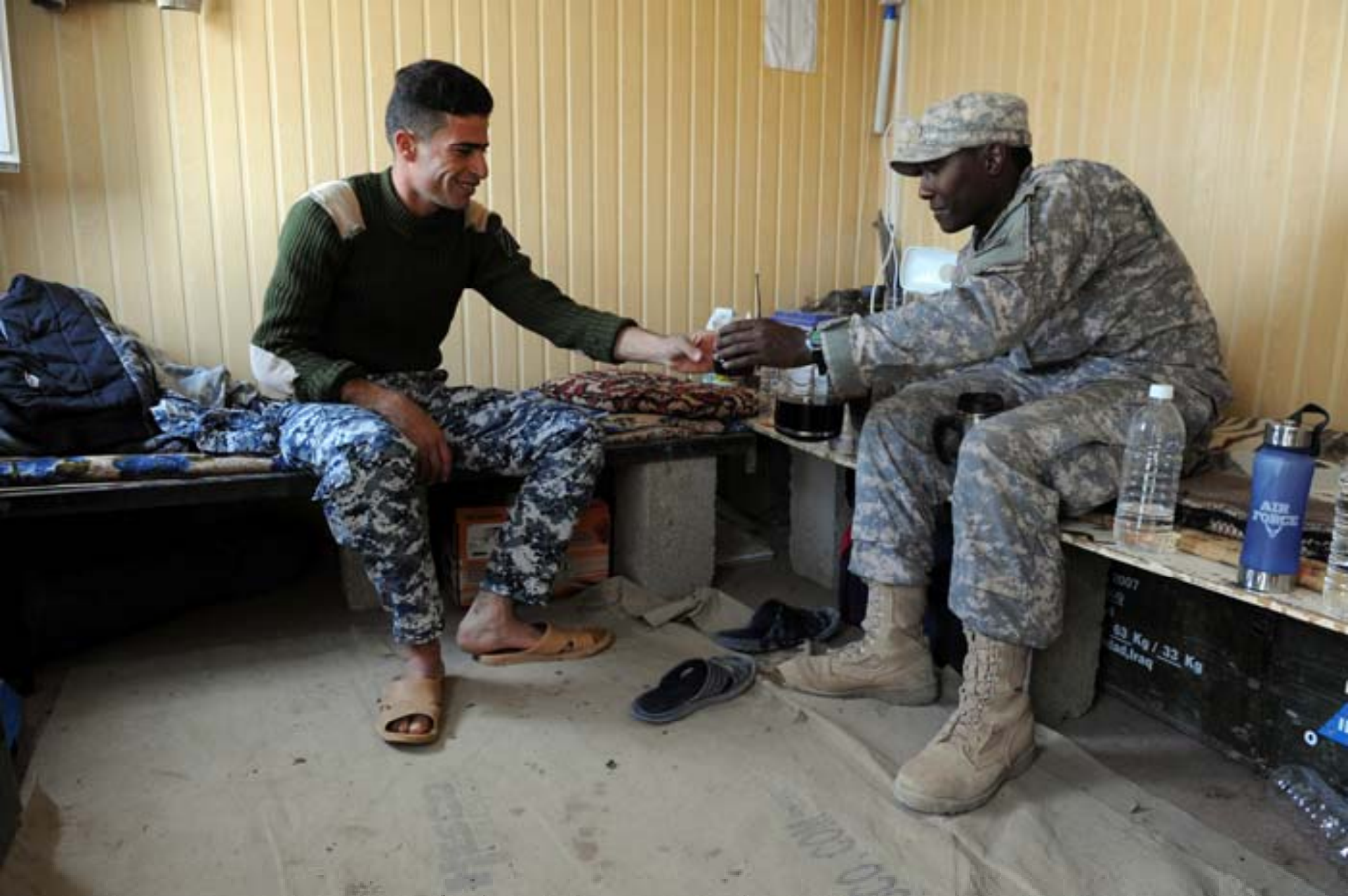
A U.S. Soldier with Headquarters and Headquarters Company, Scout Platoon, 1st Battalion, 30th Infantry, 2nd Brigade Combat Team, 3rd Infantry Division (1-30 IR), shares a coffee break with a member of Iraq's Emergency Services Unit at a Traffic Control Point (TCP) in Kirkuk, Iraq, Feb. 2, 2010. Soldiers from 1-30 IR maintain security within the TCP while Iraqi personnel conducts day-to-day operations. 100202-N-5330L-116