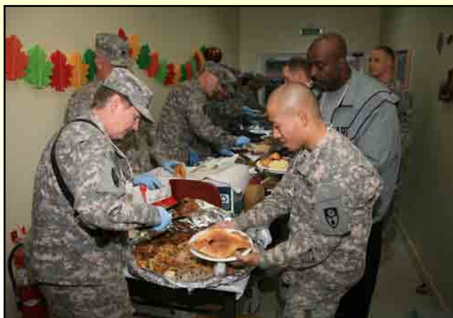
See THANKSGIVING , Page 12