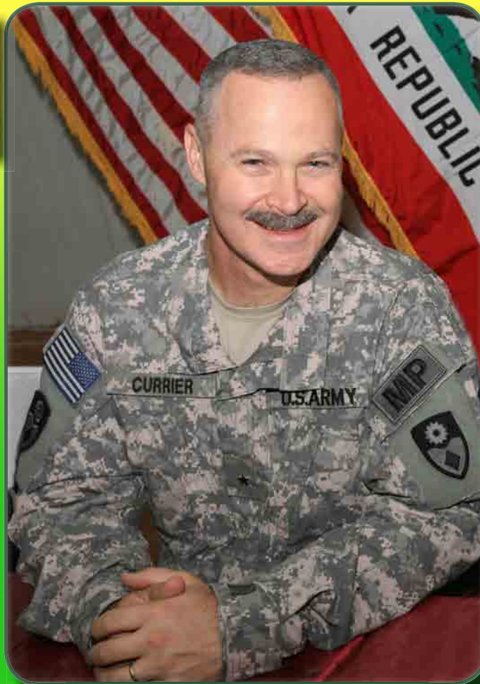
Brig. Gen. Donald Currier

We've spent the last 30 days moving in, learning our mission, and re-evaluating our individual assignments so we can better accomplish our Iraqi Police-training mission throughout the country. Your Soldiers have done a superb job. Granted, there has been some personality friction as people get to know each other, but not as much as one might expect, considering the circumstances. Although our Soldiers are working longer hours than they might have expected, there are ample opportunities for unit morale events, such as movie nights, softball tournaments and karaoke.