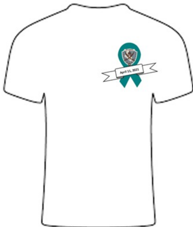
Front Side of Shirt