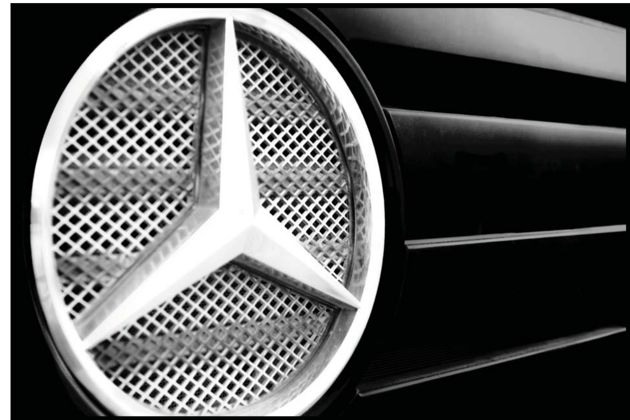
A MERCEDES BENZ EMBLEM ON THE GRILL OF A TRUCK.