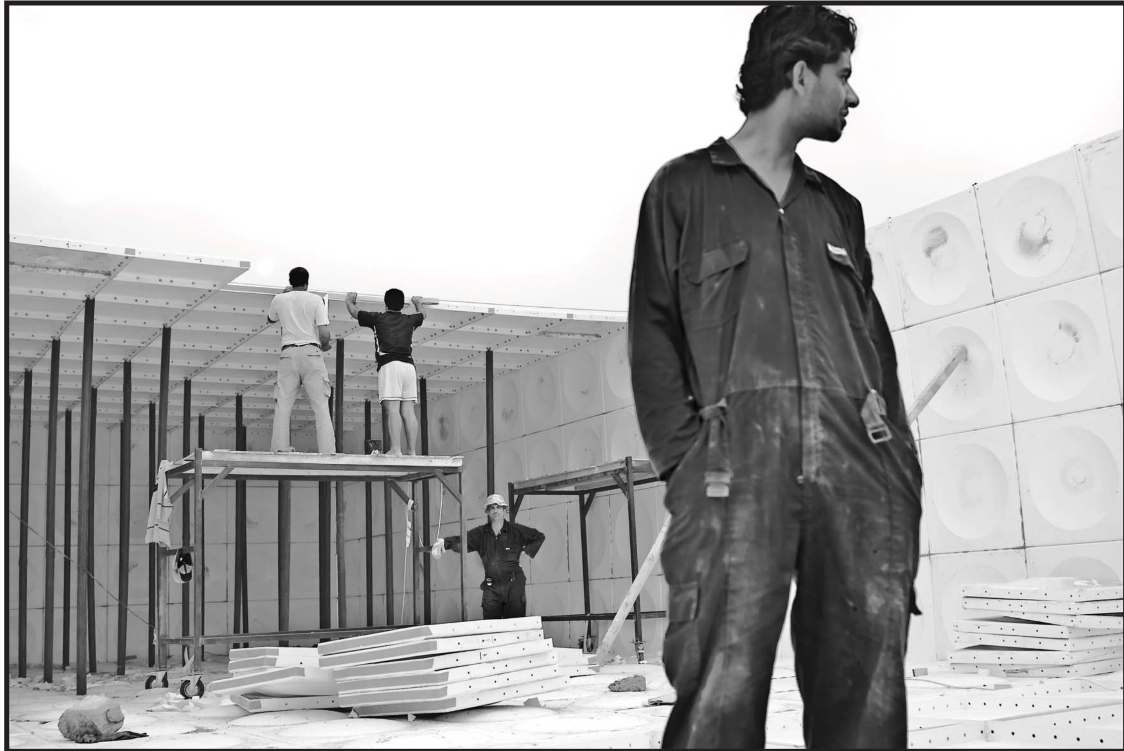
AN IRAQI WORKER, ASSEMBLING A NEW WATER TANK AT A TREATMENT FACILITY UNDERGOING MAJOR RENOVATIONS UNDER A STATE DEPARTMENT PROJECT, TAKES A MOMENT TO SURVEY THE DAYS PROGRESS