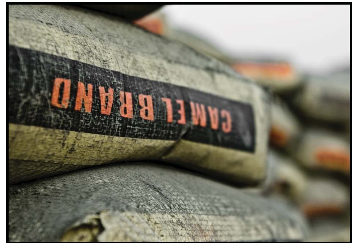
BAGS OF 'CAMEL BRAND' CEMENT STACKED NEAR A CONSTRUCTION SITE ON COB BASRA