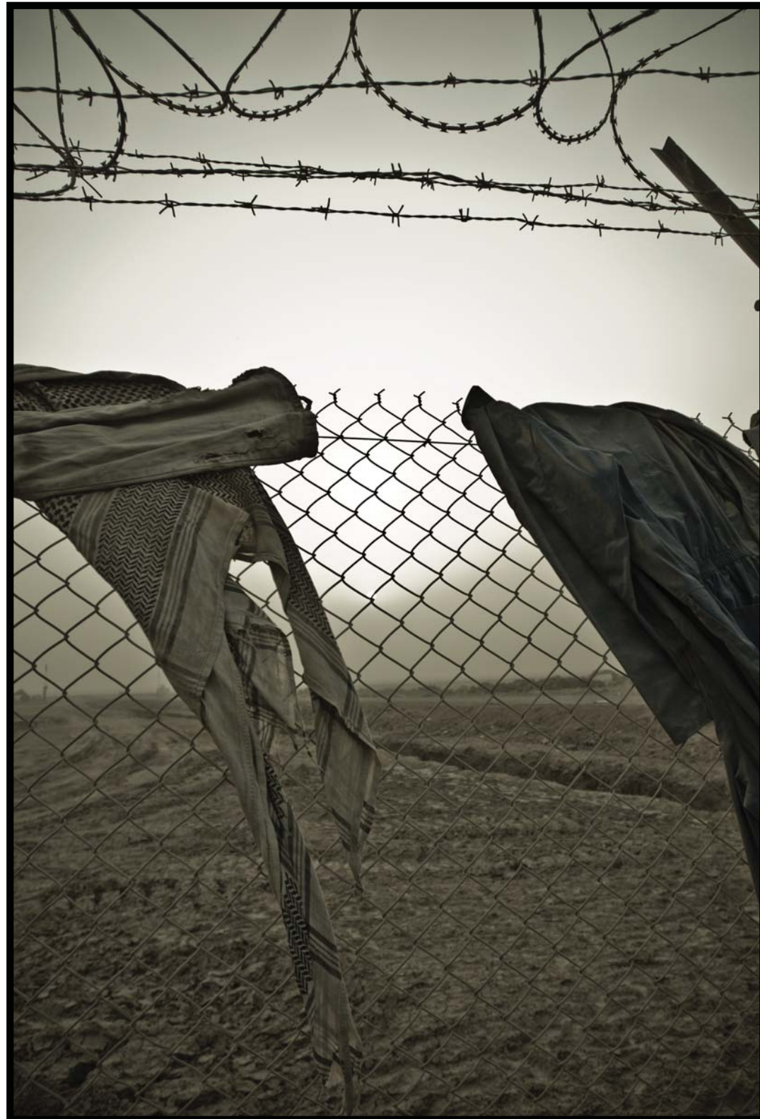
LAUNDRY FROM IRAQI WORKERS, WHO BUILD THE CONCRETE BARRIERS PRESENT ON EVERY COALITION BASE TO PROTECT FROM INDIRECT FIRE, HANGS ON A FENCE TO DRY.