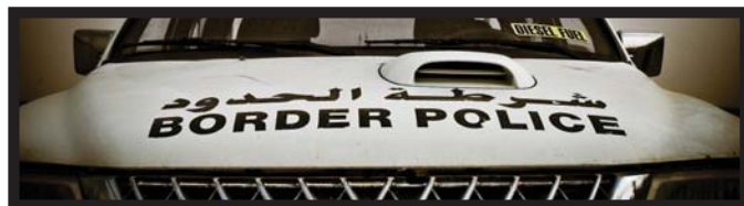
THE SOLE SOURCE OF TRANSPORTATION FOR THE IRAQ BORDER POLICE STATIONED AT A SMALL OUTPOST NEAR THE IRAQ AND IRAN BORDER.