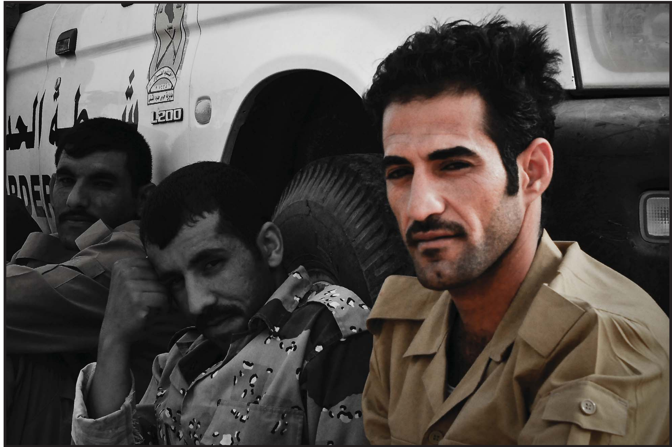
IRAQI BORDER POLICE REST AGAINST THE SIDE OF A TRUCK DURING A BREAK FROM A LONG DAY OF WORK.