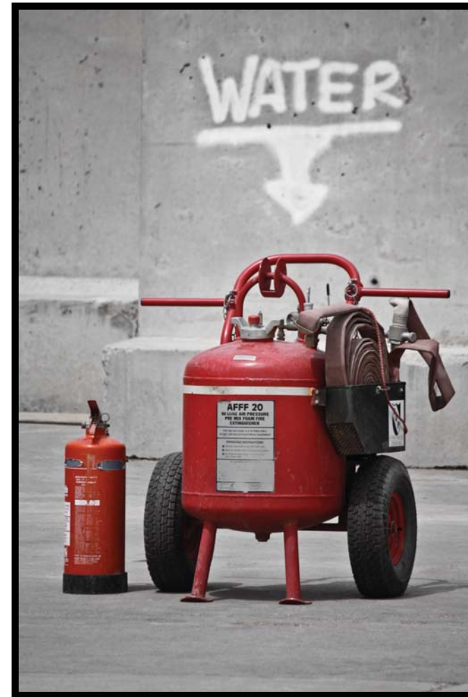
(LEFT) A EUROPEAN MADE FIRE EXTINGUISHER LEFT BY BRITISH AIRMEN IN FRONT OF A EMPTY WATER POINT AT THE BASRA FORWARD ARMING AND REFUELING POINT. (BELOW) M240D MACHINE GUN SHELLS KICKED OUT OF A UH-60 BLACK HAWK HELICOPTER AFTER A WEAPONS FUNCTION TEST. THE M240D IS AN AIRCRAFT CONFIGURED VERSION OF THE M240B USED BY THE U.S. ARMY AND MARINE CORPS. BOTH WEAPONS FIRE 7.62MM ROUNDS.