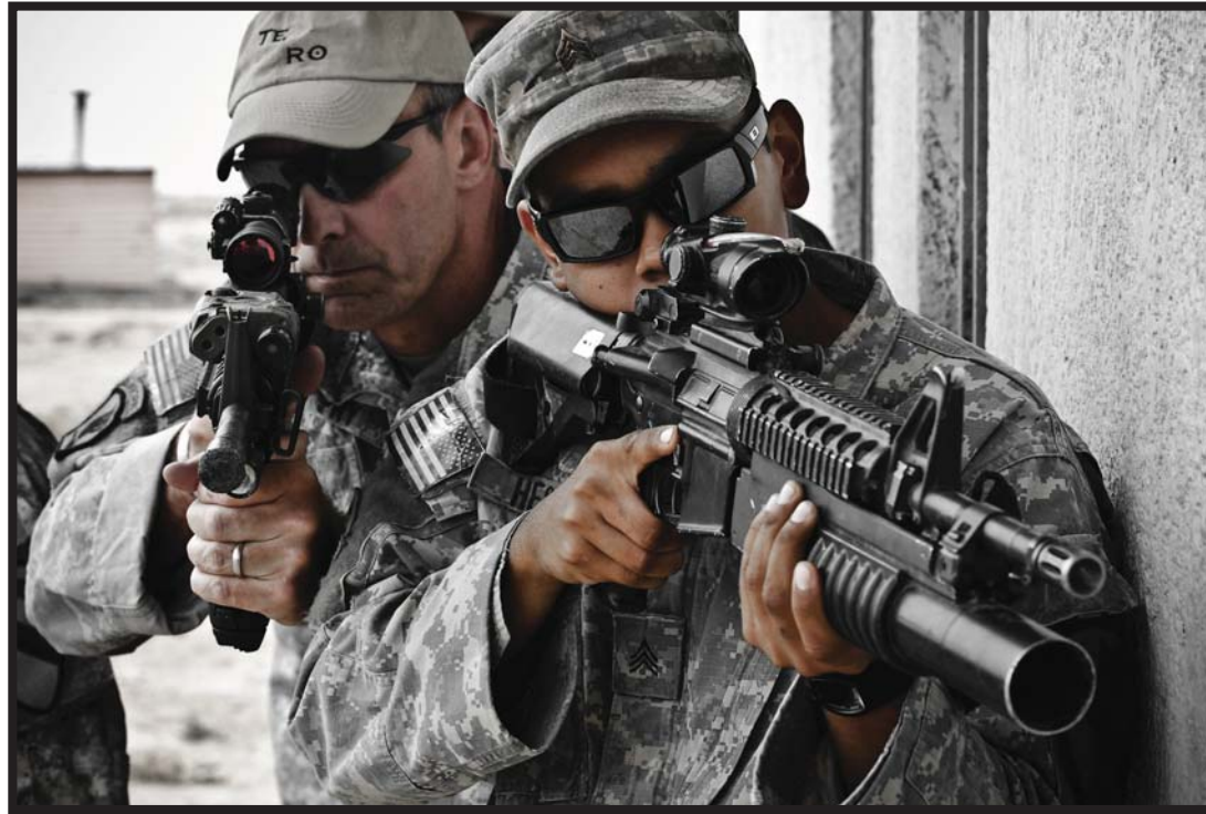
(RIGHT) AMERICAN SOLDIERS DEMONSTRATE THE PROPER WAY TO STACK ON A WALL FOR ROOM CLEARING TO THEIR IRAQI COUNTERPARTS. (BELOW) AN AK-47, THE WEAPON OF THE IRAQI BORDER POLICE, RESTS IN THE BACK OF A TRUCK DURING A BREAK FROM TRAINING. THE AK-47 IS A RUSSIAN DEVELOPED WEAPON FROM THE 1940S AND FIRES A 7.62MM ROUND.