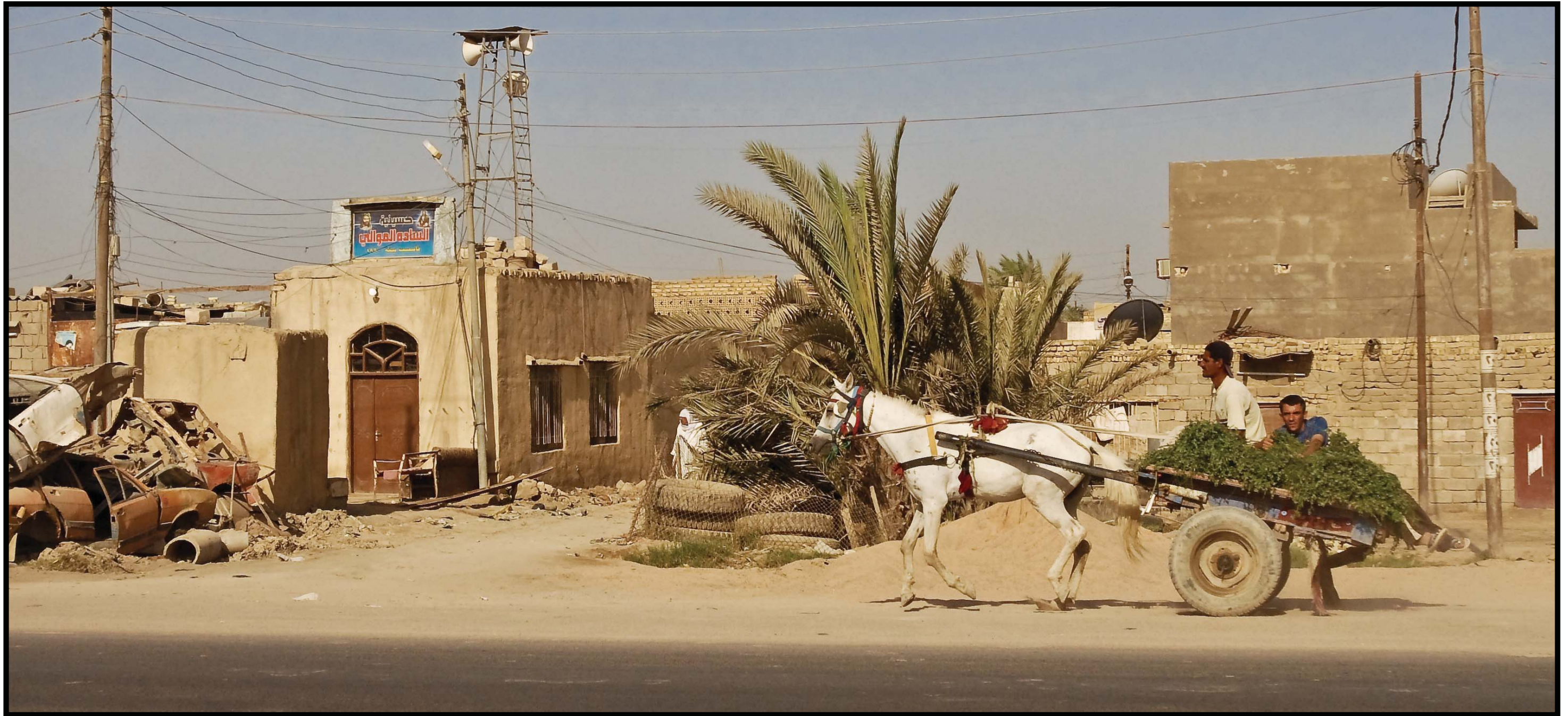
A HORSE DRAWN CARRIAGE ADDS A BUSTLE OF COMMERCE TO THE LITTERED STREETS OF AL QUERNA. IN MULTI-NATIONAL DIVISION SOUTH, AGRICULTURE IS IMPERATIVE TO THE ECONOMIC GROWTH OF IRAQ, WITH A WORK FORCE THAT IS APPROXIMATELY 70 PERCENT FEMALE.