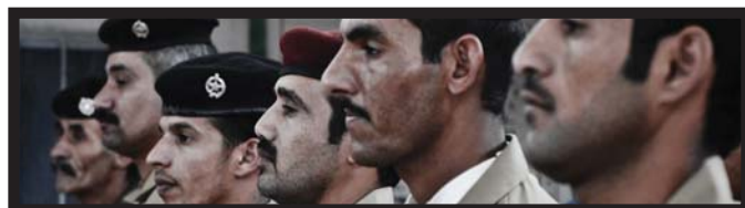
IRAQI BORDER POLICE LISTEN TO THE INSTRUCTION FOR THE DAYS TRAINING. AMERICAN SOLDIERS TRAINED THE POLICE EVERYDAY OF THE WEEK, EXCEPT FRIDAY, TO RECOGNIZE THE MUSLIM HOLY DAY AND GOMAAH PRAYER.