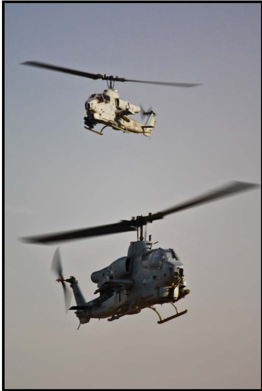
TWO MARINE CORPS AH-1W SUPER COBRAS ON THEIR FINAL APPROACH TO WASHINGTON PAD IN BAGDAD, IRAQ. THE BELL AH-1W SUPER COBRA IS A TWIN-ENGINE ATTACK HELICOPTER BASED ON THE US ARMY'S AH-1 COBRA. THE AH-1W IS CONSIDERED THE BACKBONE OF THE U.S. MARINE CORPS ATTACH HELICOPTER FLEET.