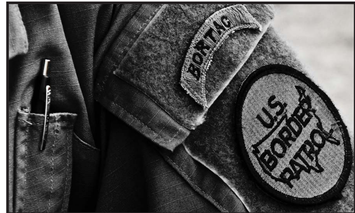
(ABOVE) THE IRAQI BORDER POLICE COPY WHAT THEIR AMERICAN COUNTERPARTS HAVE TAUGHT THEM BY STACKING ON A WALL TO CLEAR A ROOM. (LEFT) UNITED STATES BORDER PATROL PERSONNEL PARTICIPATE IN TRAINING THE IRAQI BORDER POLICE STATIONED NEAR THE IRAQ AND IRAN BORDER, BUT SAID THE BORDERS OF THE TWO COUNTRIES ARE ENTIRELY DIFFERENT THE TERMS OF WHAT THEY ARE GUARDING FROM.