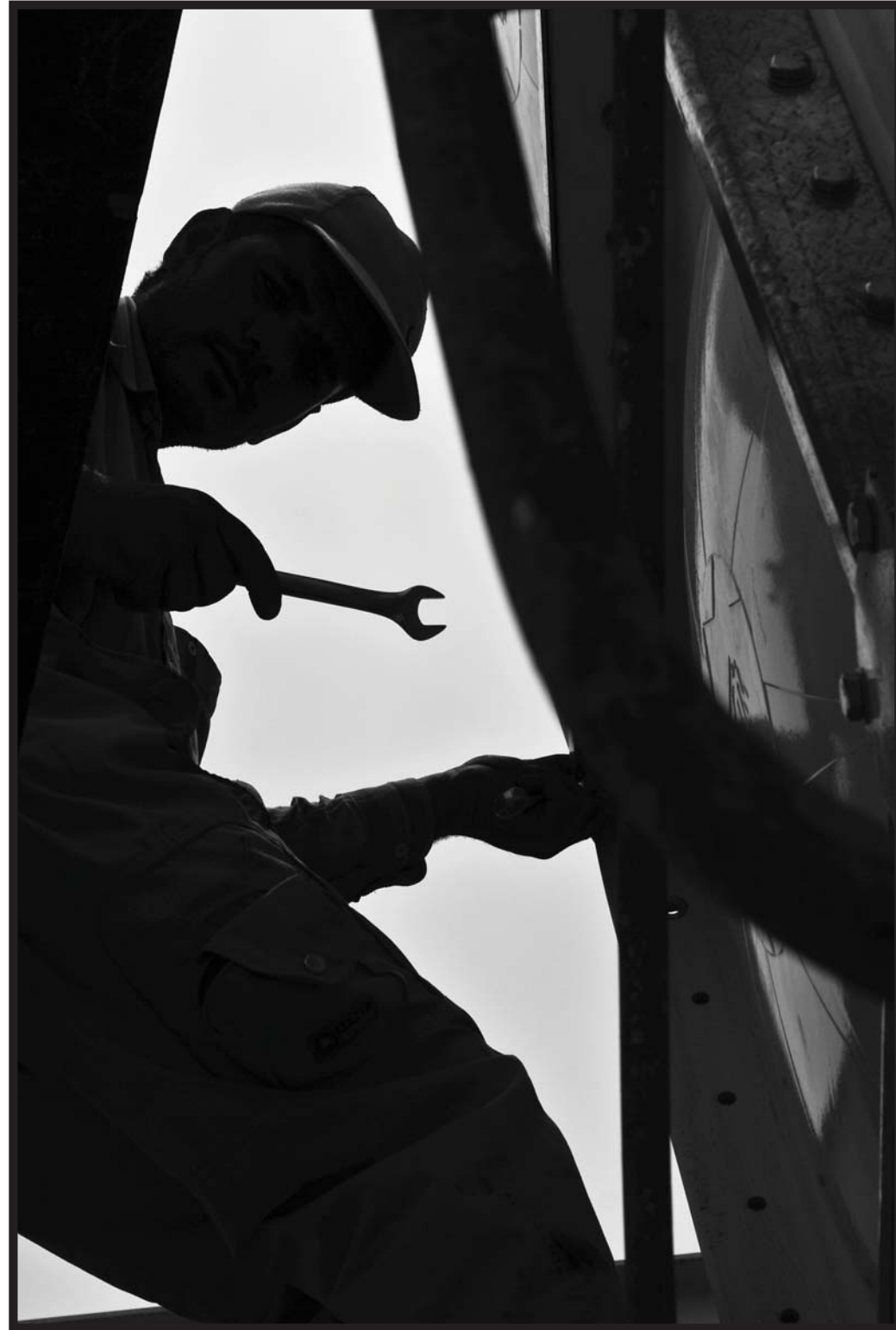
AN IRAQI WORKER ASSEMBLES A WATER TANK DURING RENOVATIONS OF A WATER TREATMENT FACILITY JUST OUTSIDE OF BASRA, IRAQ.