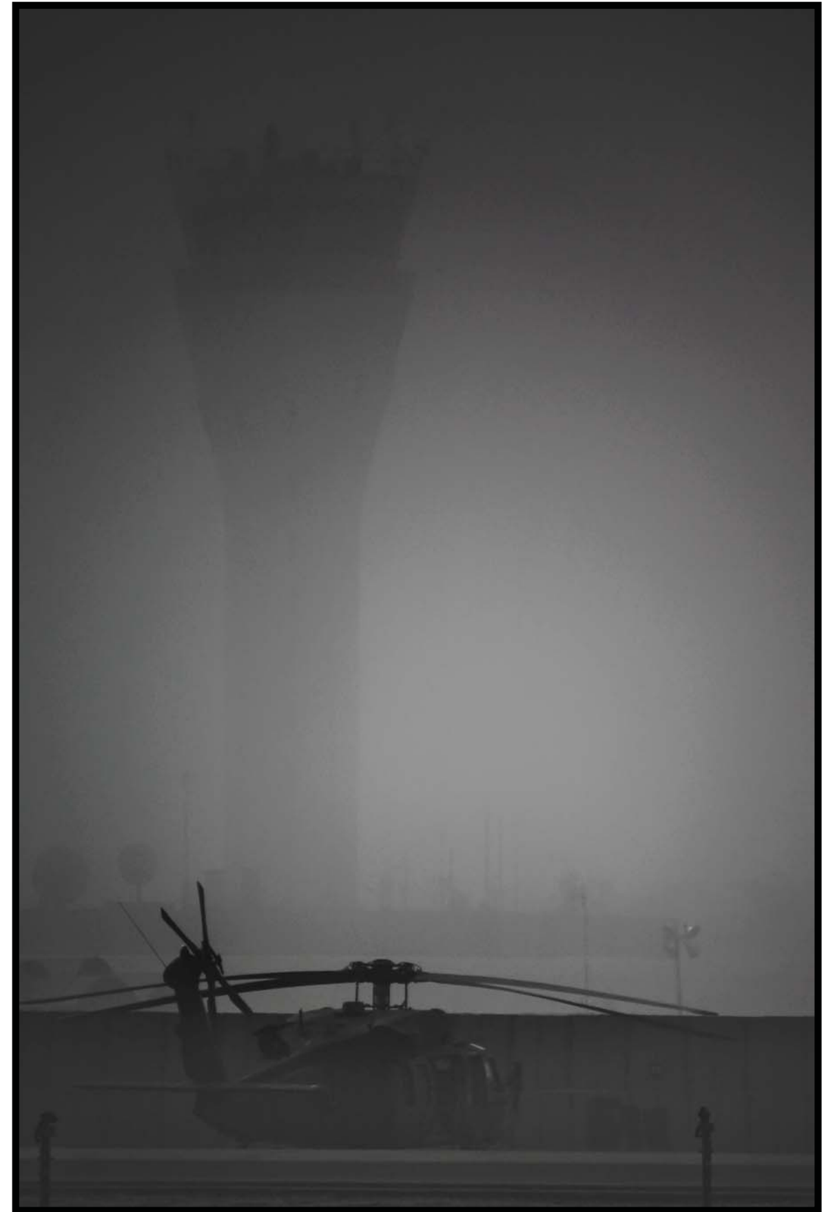
WITH VISIBILITY BELOW HALF A MILE THE BASRA AIRPORT CONTROL TOWER AND A BLACK HAWK HELICOPTER WAIT DURING A DUST STORM AT 5 A.M.