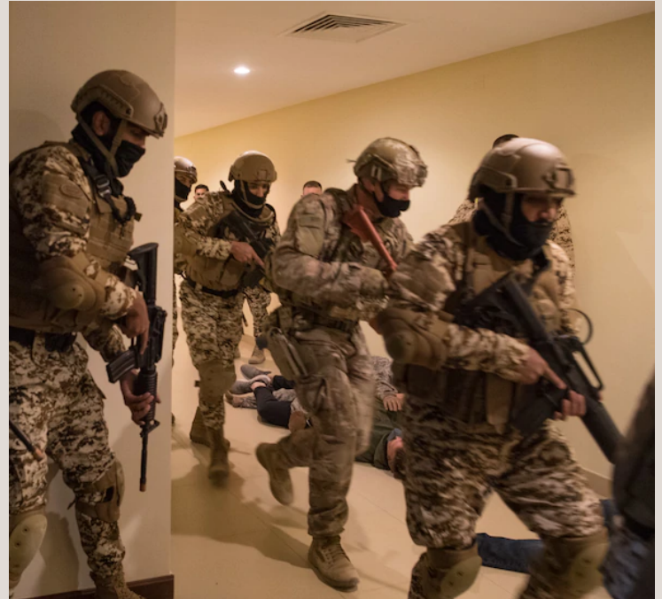
Bahrain Defense Force and U.S. Naval Forces Central Command personnel simulate clearing a building during a joint anti-terrorism exercise in the U.S. 5th Fleet Area of Operations, Jan. 13. The bilateral exercise focused on enhancing mutual security and anti-terrorism capabilities by testing responses to simulated scenarios.