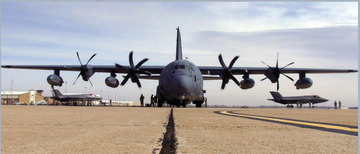
An MC-130J Commando II from the 9th Special Operations Squadron refuel two F-35A Lightning IIs from the 388th Fighter Wing at Cannon Air Force Base, N.M., during a forward air refueling point training exercise Feb. 27.