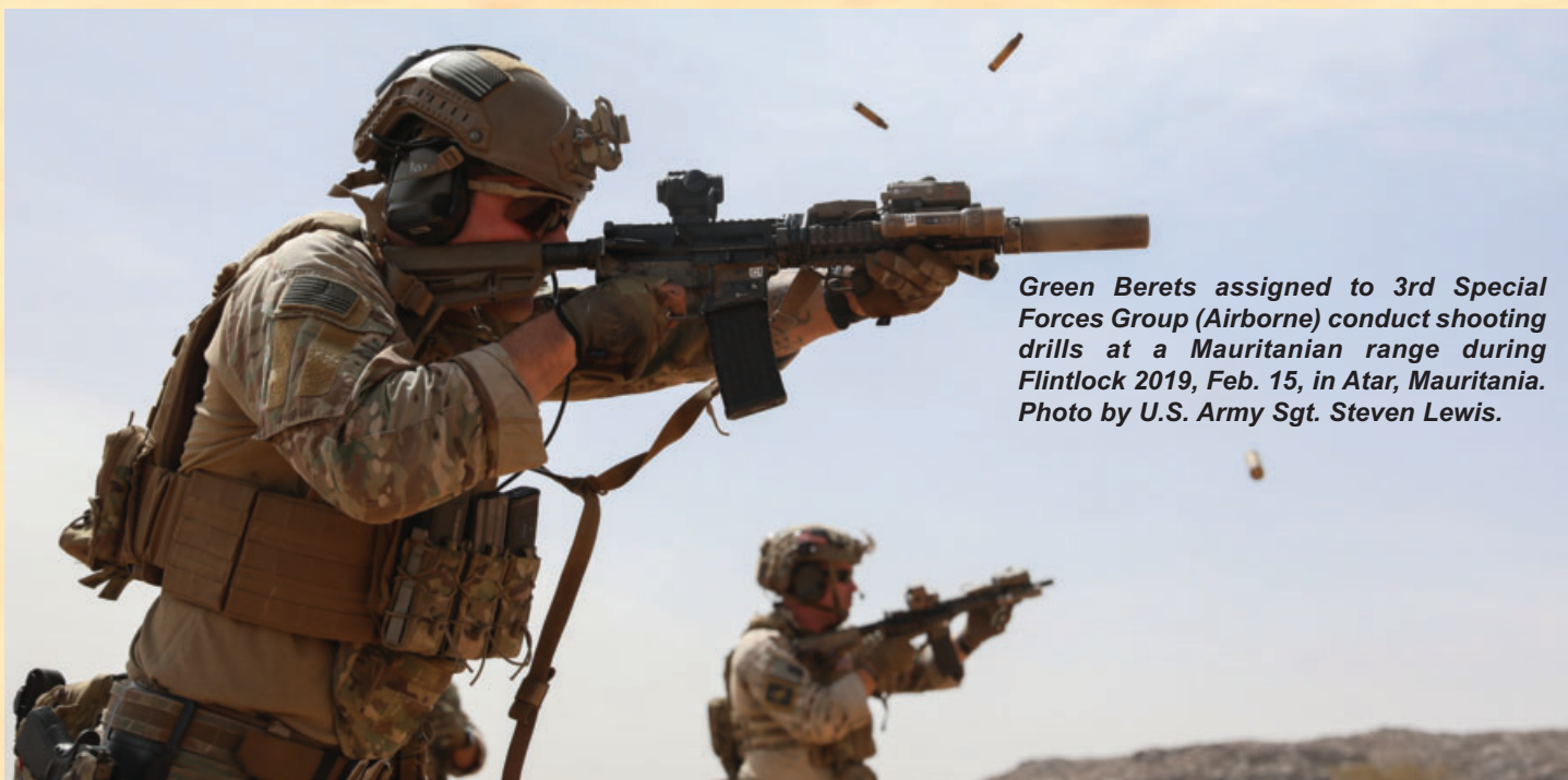
Green Berets assigned to 3rd Special Forces Group (Airborne) conduct shooting drills at a Mauritanian range during Flintlock 2019, Feb. 15, in Atar, Mauritania.