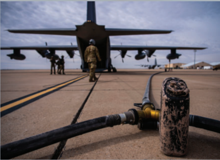
A refueling hose split in two directions out of the back of a MC-130J Commando II during the start of forward area refueling point training for F-35A Lightning II aircraft at Cannon Air Force Base, N.M., Feb. 2.

development. Adaptive basing is a key component to providing air power in highly contested modern warfare. To succeed, Airmen from different platforms and different specialties must train to work together effectively, planners said.