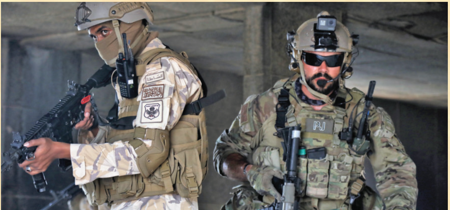
A Qatar Joint Special Forces soldier and a U.S. Air Force Pararescueman attached to 10th Special Forces Group (Airborne) move during an Invincible Sentry 2019 training scenario near Zekreet, Qatar, March 24. U.S. Central Command used IS19 to evaluate the capabilities of its subordinate units to mitigate crises within the region.