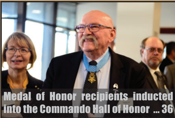
Medal of Honor recipients inducted into the Commando Hall of Honor ... 36