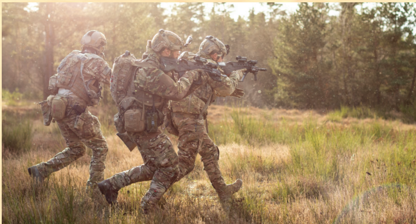
Ukrainian special operations forces and U.S. Army Special Forces Soldiers assigned to 10th Special Forces Group (Airborne) move across an objective during exercise Combined Resolve XI at the Joint Multinational Readiness Center in Hohenfels, Germany, Dec. 10, 2018.

“This exercise demonstrated to all the participating elements that we need more SOF and conventional forces integration if we want to be successful in future conflicts,” added the American captain.