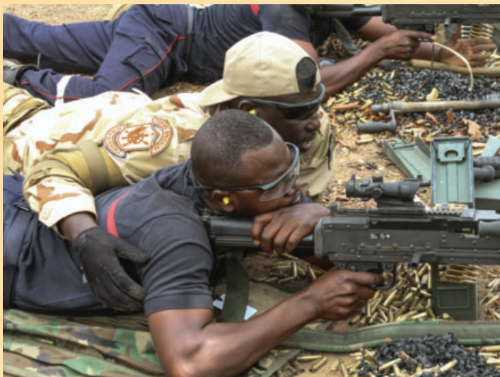
A Senegalese special forces soldier teaches a Burkinabe fire fighter how to fire an M240 machine gun as part of interoperability training with U.S. Special Forces Soldiers during Exercise Flintlock 2019, near Po, Burkina Faso, Feb. 21. Flintlock 2019 builds the capacity of participating nations to support regional cooperation, security and interoperability.