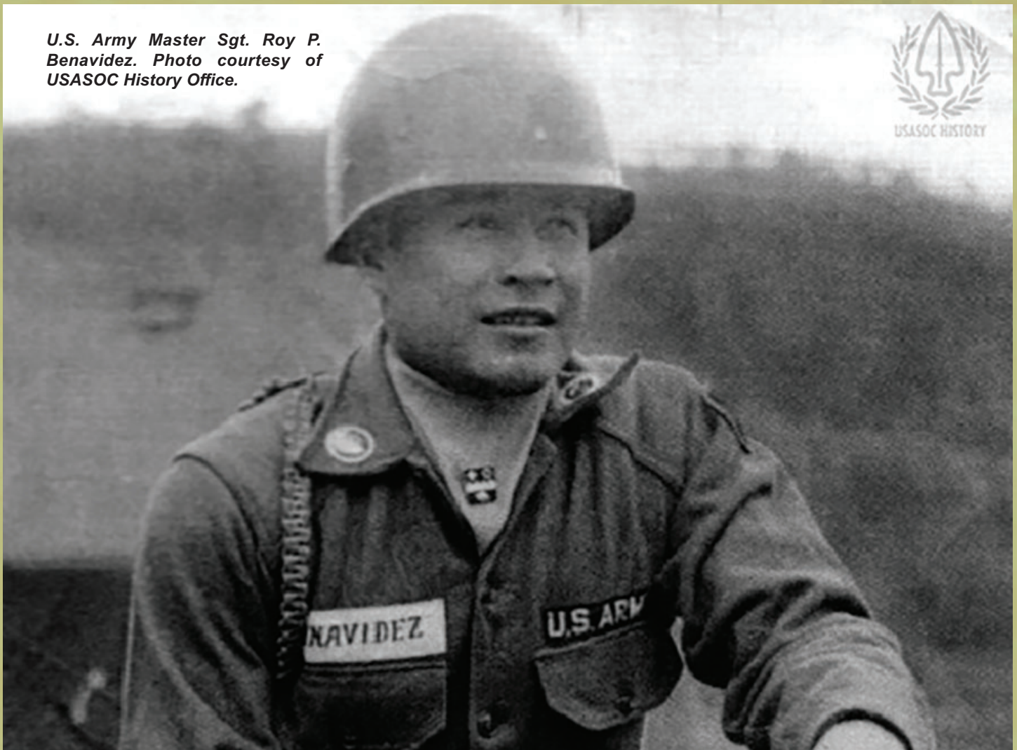
U.S. Army Master Sgt. Roy P. Benavidez.