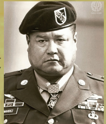
U.S. Army Master Sgt. Roy P. Benavidez.

Benavidez died in San Antonio, Texas, November 29, 1998.