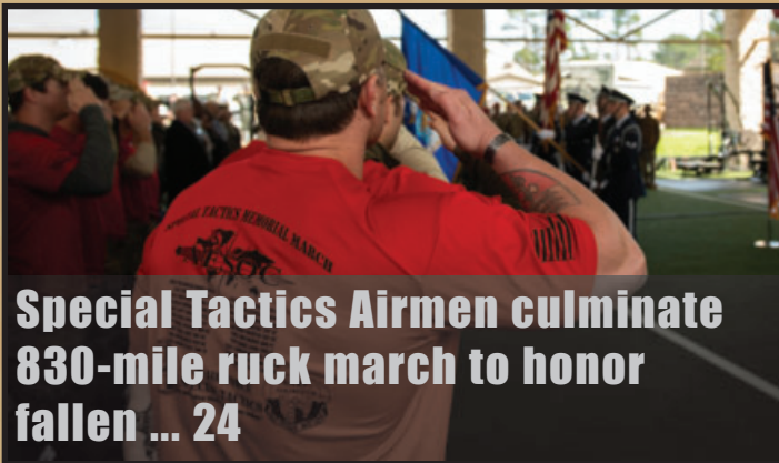
Special Tactics Airmen culminate 830-mile ruck march to honor fallen ... 24