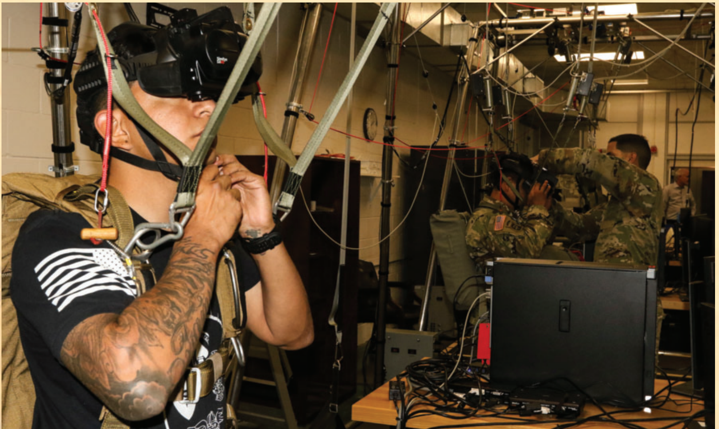
A paratrooper prepares for virtual reality jump training on the new Parachute Simulator 7 at the Joint Riggers Facility, MacDill Air Force Base, Tampa, Fla., Feb. 21.

Simulator training gives jumpers the opportunity to practice and refine their canopy control techniques in a safe virtual environment. Mistakes can be made and corrections