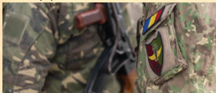
U.S. Air Force's 7th Special Operations Squadron deployed to Bacau, Romania March 10-15, to conduct mission essential tasks, and simultaneously familiarize Romanian SOF with the CV-22 Osprey.

"The biggest takeaway for me, is the Romanian partners are more than willing to host us, but they are thirsty to work with us as far as continued training," said the mission commander. "Looking forward to coming back, not just in Bacau but into Romania in general, so that we can work in the dynamic air space that they have, and their terrain, but also working with the ROU SOF members who seem to be very much interested in working with specialized air power like the tiltrotor Osprey."