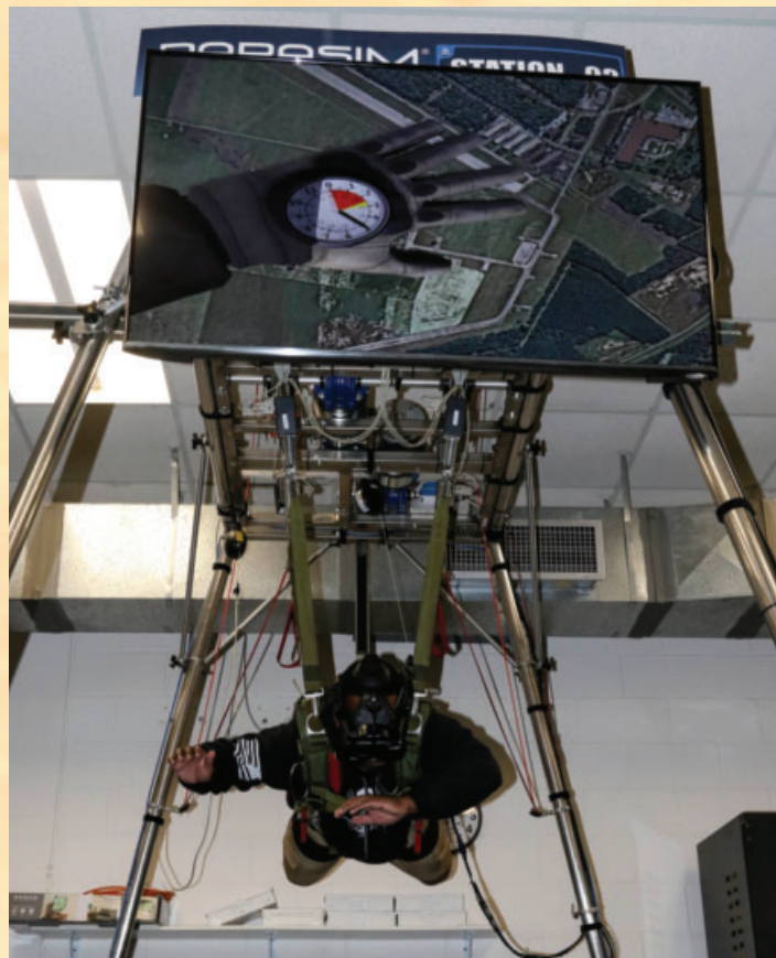
A paratrooper participates in a virtual reality jump training on the new Parachute Simulator 7 at the Joint Riggers Facility, MacDill Air Force Base, Tampa, Fla., Feb. 21.

This will play a significant role as the commands prepare to transition to the bottom of container deployment method for the RA-1 parachutes as jumpers will have to learn new body positions necessary to deploy their parachutes.