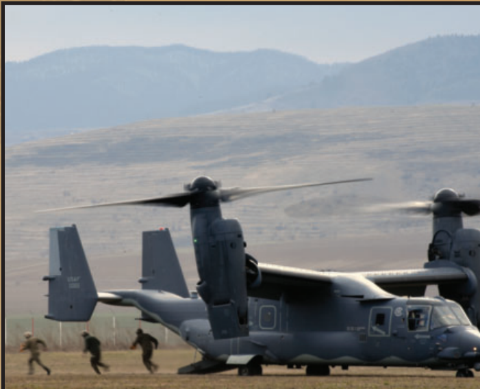
Strengthening relationships through combined training ... 13